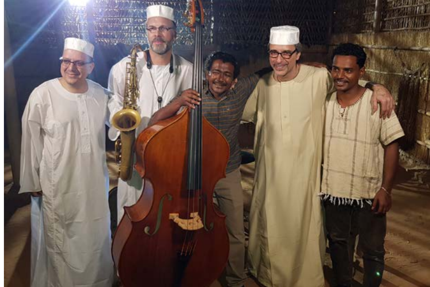
In January 2018, American jazz trio The Petrio visited Sudan on an artistic exchange, where they played a series of public concerts, including with Sudanese musicians, and also held “master classes” for aspiring jazz artists. While in Sudan, they filmed a music video with Sudanese musicians that detailed the group’s trip—complete with a visit to the market to be outfitted in Sudanese national dress.

Well-developed modern painting in Sudan includes artists ranging from the late Professor Ahmed Shibrain to the well-known Rashid Diab, whose work resonates across the Middle East. Younger artists returned from exile, such as Abushariaa Ahmed, should also be acknowledged for their artistic renderings of Sudanese history, culture, and society. It is difficult for many Sudanese artists to make a living selling their work inside Sudan, so many turn to international exhibitions—including artistic hubs like Nairobi, London, New York City, and the Gulf states—to raise their profile. As a result, many Sudanese artists remain unknown even to more cultured Americans, though it is likely that, with greater exposure, their work would fascinate US audiences. As one Sudanese artist remarked, “We see artists in the West get showered with support and appreciation by the masses and the media. We simply don’t have that here.” 10 An exhibit at a US-based