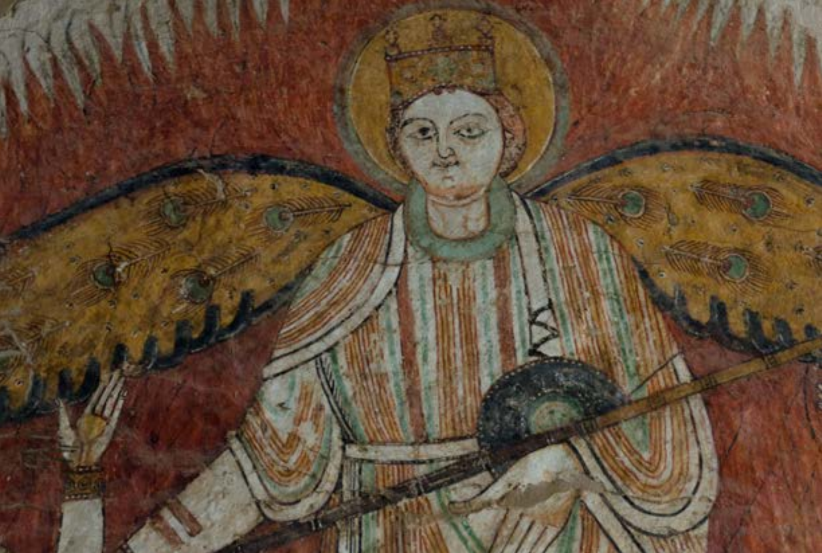
A Christian fresco of the Archangel Michael from the ancient Sudanese city of Faras (now underwater due to flooding from Egypt's Lake Nasser) is on display in the Khartoum National Museum. Many of Sudan's historic artifacts have been excavated and preserved with the assistance of western experts, and Sudan's ongoing archaeological sites remain of great interest to university researchers.

US colleges and universities, and through low-cost options like podcasts by academics. Some academic connections exist between the United States and Sudan—especially through the Sudanese diaspora in the United States—and should be leveraged. A similar opportunity offers to develop a curriculum on US literature for Sudanese students, particularly for those wishing to advance their English-language study.