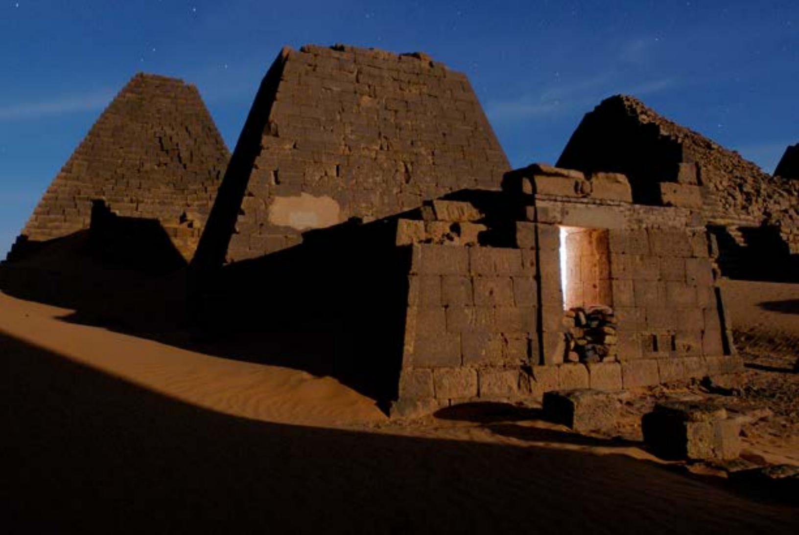
The pyramids of Meroë at night. Sudan is home to some two hundred pyramids, relics of ancient Nubia, which attract modest numbers of international visitors but yield great potential for Sudan's nascent tourism industry.