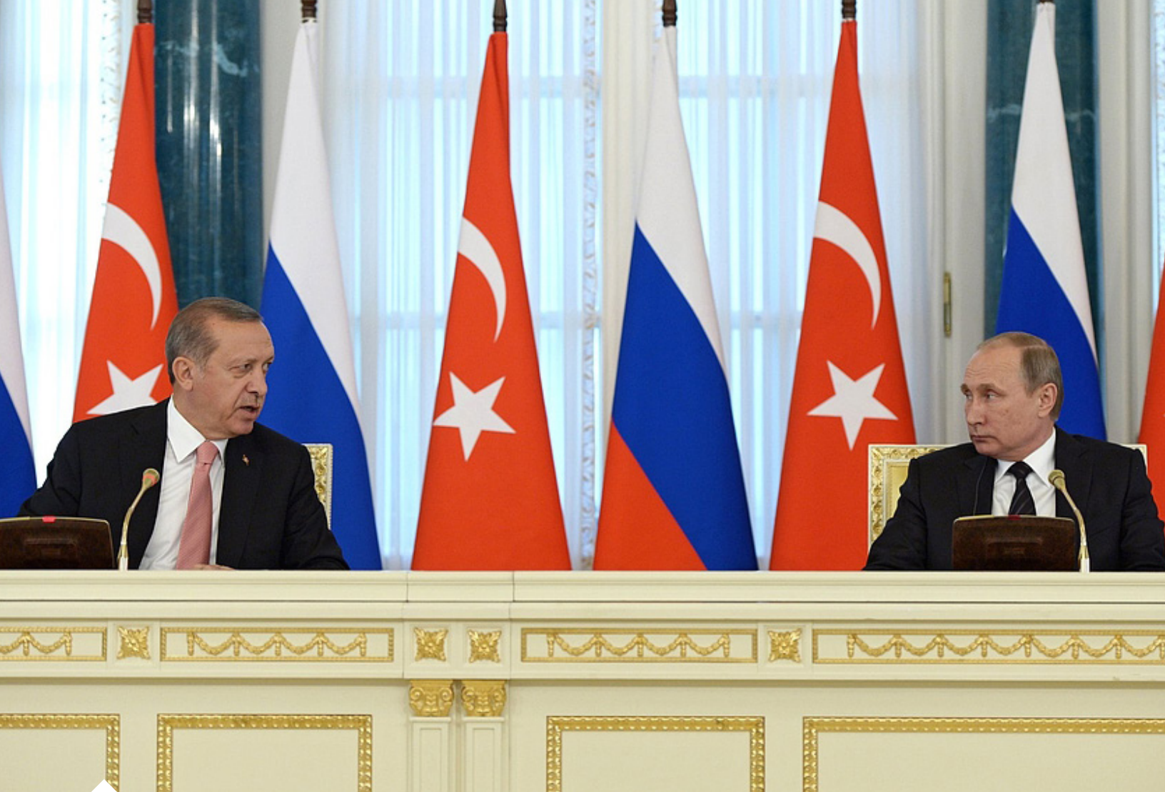
News conference following talks with President of Turkey Recep Tayyip Erdogan.

export. 49 In early 2014, Iraqi Prime Minister Nouri al-Maliki suspended payments to the KRG, following statements from the latter about future independent oil exports. This prompted the KRG to increase its independent oil exports to Turkey. The suspension of payment, combined with the recent decrease in the price per barrel of crude, deprived the KRG of needed financing to pay government salaries. Thus, despite exporting 300,000 barrels per day (bpd) of crude through Turkey, the KRG was running a $290 million deficit per month. 50 This financial crisis delayed salary payments, including to the Peshmerga forces allied with both the KDP and PUK, and who together provide security for the KRG. To address the serious shortfall in funds, the KRG began to leverage potential future oil revenues to raise money from international lenders, who were keen to avoid entangling themselves in the Baghdad-Erbil disagreement. The result was unfavorable lending