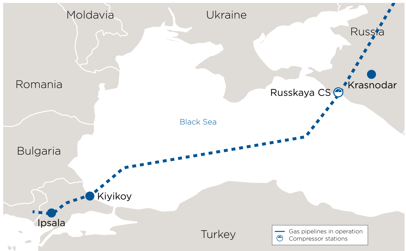
Map 1. Planned Turkstream pipeline route