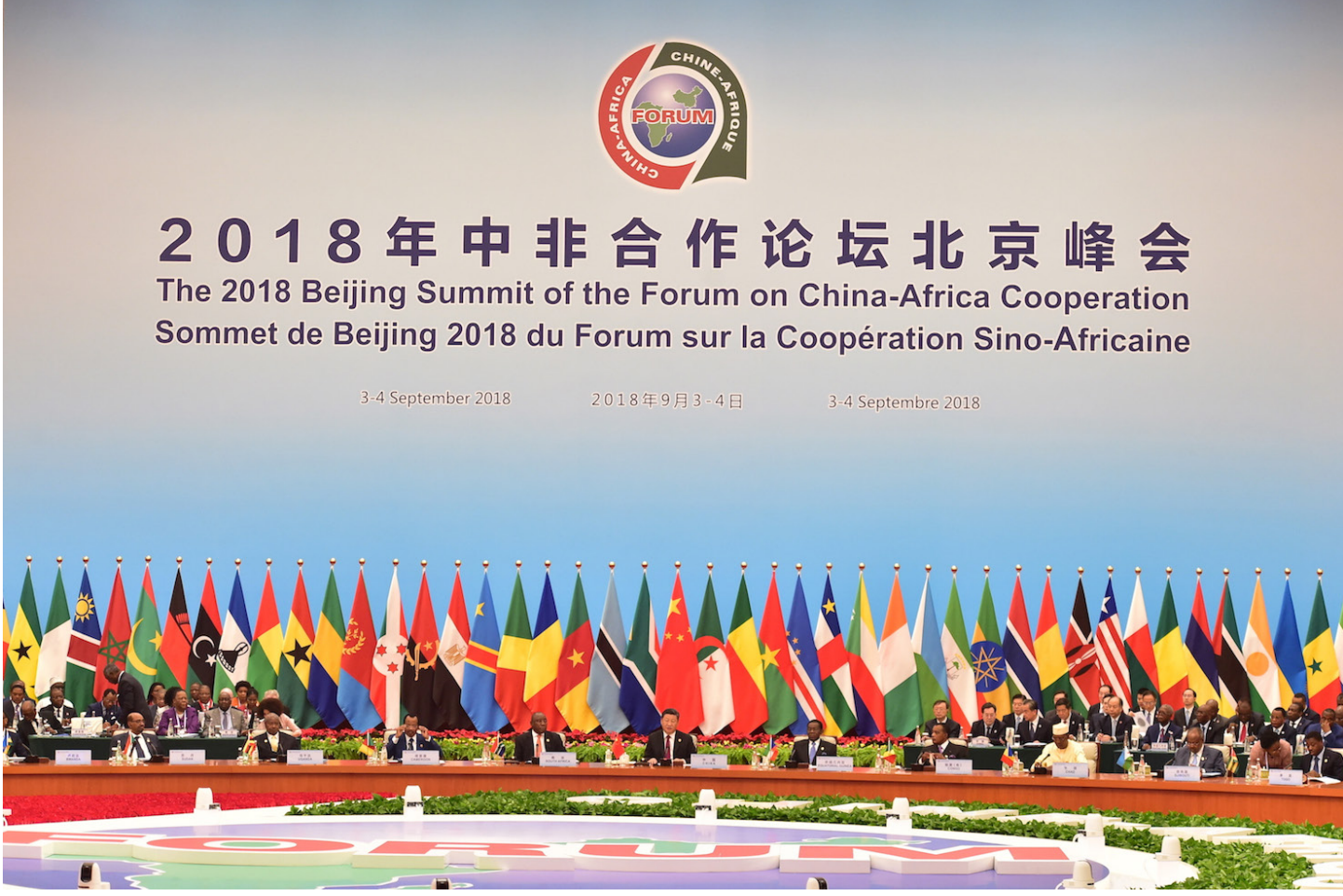
Chinese President Xi Jinping chairs the 2018 Forum on China-Africa Cooperation in Beijing, with 49 African heads of state or government in attendance.

(a nonreciprocal trade agreement granting duty-free access to the US market for certain products), a hamstrung Export-Import Bank, and OPIC (which is limited to using only debt tools) as the foundation of its commercial relationship with Africa. The creation of the USDFC throws open a new door to innovation in development finance for the United States and will finally begin to level the playing field.