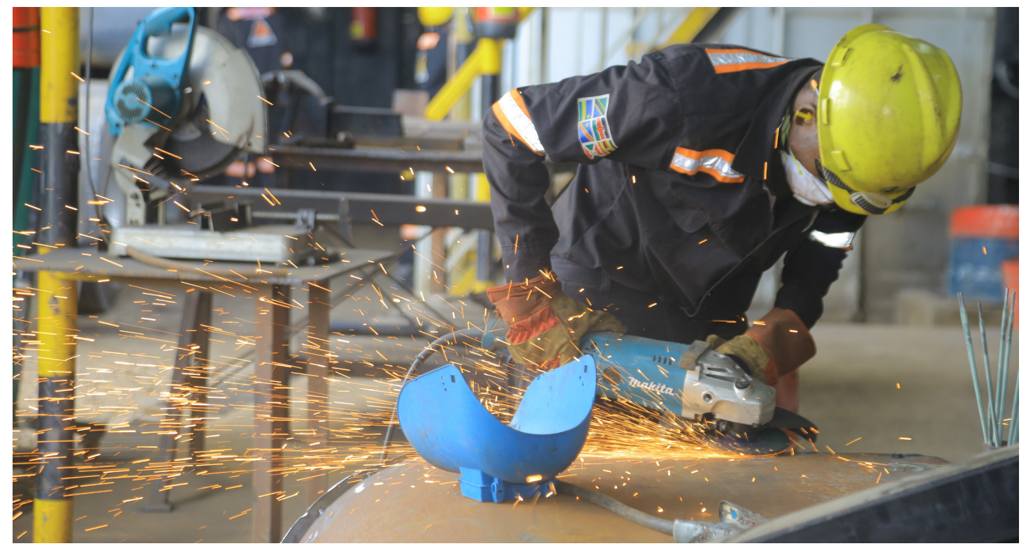
Alistair Group, established in 2007 with just two trucks, used a seven million OPIC loan in 2012 to expand its operations. The company now offers shipping and logistics services for major mining, oil, and gas companies as well as global relief organizations across the African continent.

stakeholders, and providing technical assistance to build capacity in both the private and public sectors.<sup>42</sup>