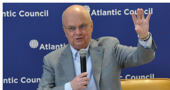
Gen. Michael Hayden (Ret.), former NSA and CIA Director, addresses students at the 2015 Challenge in Washington, DC.