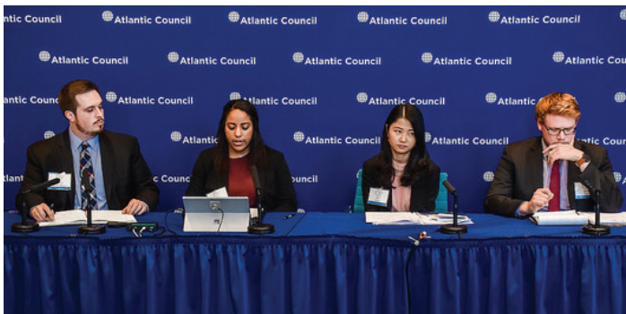
Student team presents in the final round of the 2017 Student Challenge in Washington, DC.