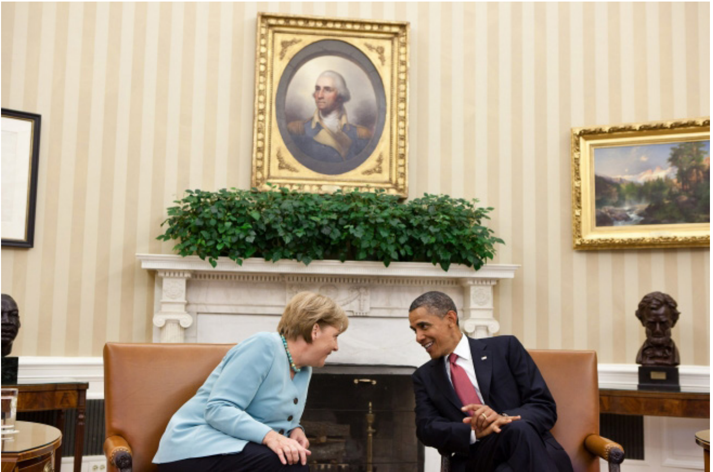
US President Barack Obama and German Chancellor Angela Merkel prior to the start of their bilateral meeting, June 7, 2011.

the fundamental disagreement about the 2003 Iraq war, exacerbated by diverging approaches to the financial crises of the late 2000s, and laid bare by the reported activities of the NSA. American apathy toward German culture beyond World War II history, Oktoberfest, and luxury cars has done little to counter the negative narratives. While the United States and Germany continue to cooperate on many international issues at the diplomatic level, the trickle-down effects of these narratives have increased political pressure, particularly within Germany, which may complicate future diplomatic relations.