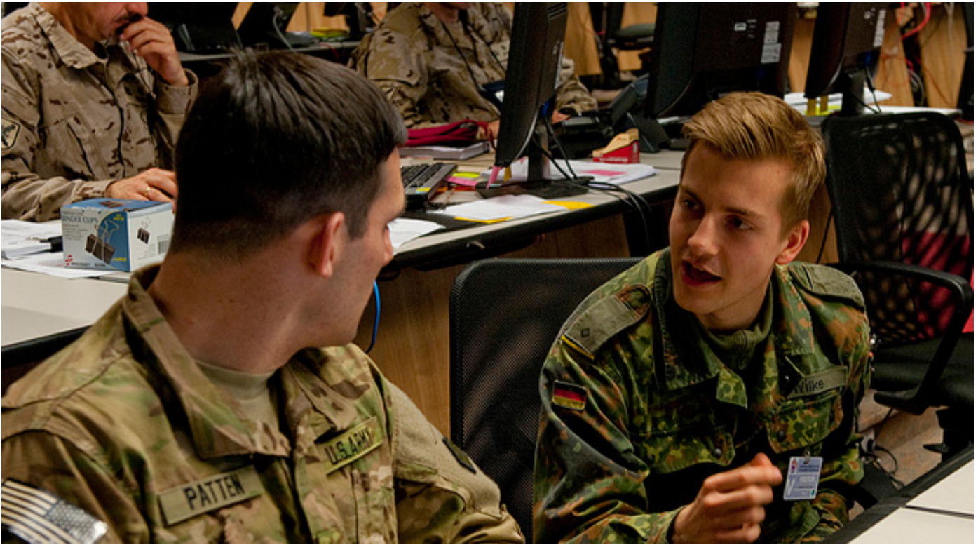
An American soldier talks to a German soldier and learns some new German words during a break at Exercise Unified Endeavor in the Grafenwoehr Training Area at the US Army Europe's Joint Multinational Training Command in Germany.

itarism that took hold in Germany in the wake of World War II never really went away. The Next Generation of Germans typically recoils from additional spending and investment on defense, finding few situations they believe would warrant the deployment of military troops despite proclaiming a desire to be more involved in world affairs. This has translated into a situation where military readiness has fallen and modernization efforts have stalled—a “hollow force,” as some critics see it.