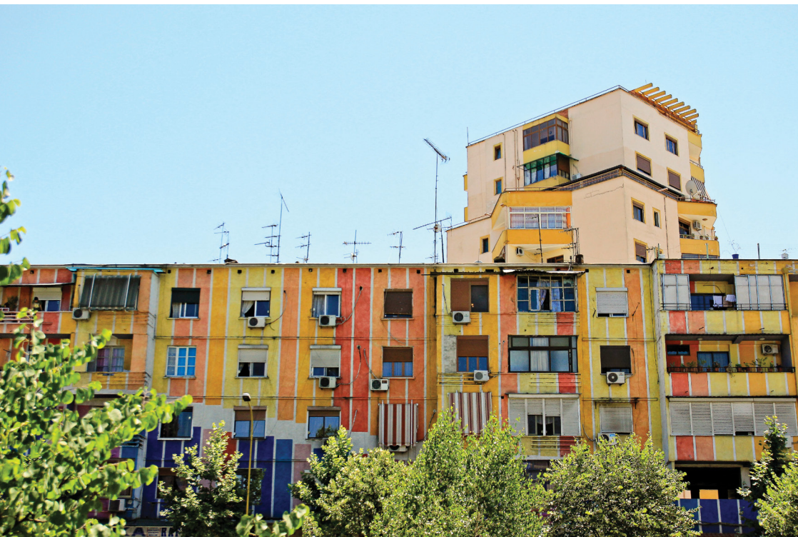
The miracle of a fresh coat of paint. Soviet-era buildings got a fresh look in Albania's capital in the early 2000s to show a country being transformed.

Albania was a rapid, early reformer. For many countries in transition, crucial economic reforms—such as the adoption of market-oriented prices, establishment of budgetary discipline, and a unified and market-determined exchange rate—have been difficult to implement because of resistance from entrenched interest groups fearful of losing their privileges. But in Albania, many of these measures were begun during the first year of IMF membership. In part this resulted from the previous regime failing so comprehensively. The people were ready for a new direction. Moreover, public support was helped by IMF and World