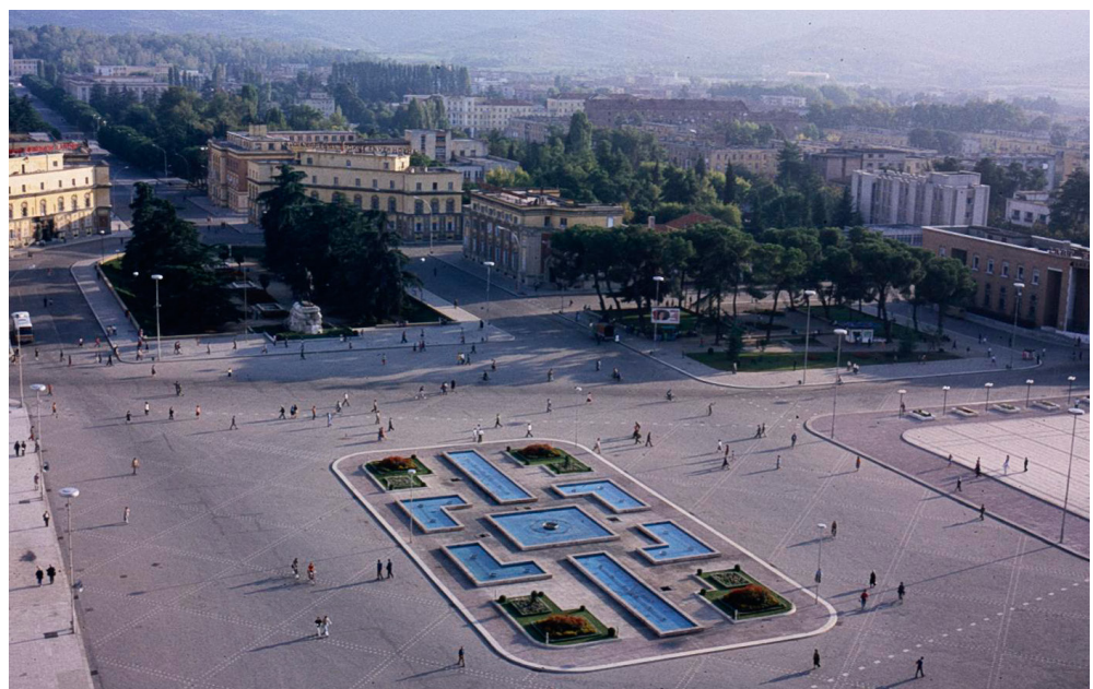
Tirana's Skanderbeg Square has transformed since 1988 as Albania began to enter the global economy.

When Albania joined the IMF in October 1991, it was not only looking for financial support but