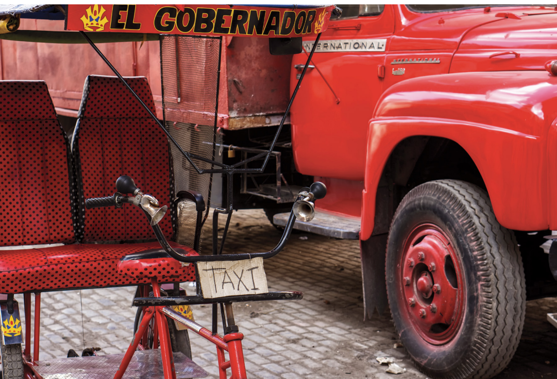
Bicycle taxis have become a popular source of private income for Cubans in response to the growing tourism sector on the island. Could the IFIs help advance this sector?

similar to the advocacy role played by President George H. W. Bush in 1991-92 vis-à-vis IMF engagement and membership for Russia and other countries of the former Soviet Union.