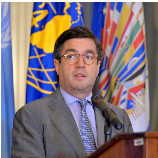
Luis Alberto Moreno, President of the Inter-American Development Bank, has discussed the possible road-map for Cuba to join the IDB.

Despite a host of reforms introduced since 2008, Cuban economic growth has been weak. From 2008-2014, average annual GDP growth reached only 2.8 percent. While this is close to the Latin American and Caribbean average, it is only around half the originally anticipated 5.1 percent forecast by the Cuban government. Growth in the agricultural and industrial sectors fell particularly short of expectations, with average annual rates of only 0.6 percent and 2.5 percent respectively, while private household consumption registered only 2.6 percent growth—well short of the amount needed to provide the hoped-for, and