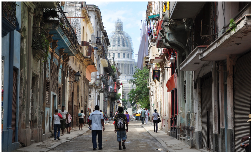
The Cuban government's renovation of El Capitolio signals the many potential changes as it seeks to create a new international image.

Finally, the statutory requirement known as the Gonzalez Amendment (1972) requires that