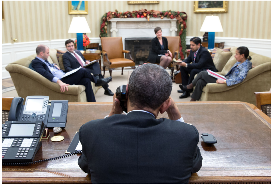
President Barack Obama talks with President Raúl Castro on December 16, 2014, opening new communication one day before historic policy changes.

Now that Cuba has caught the eye of foreign investors and the international community, it is a good time to reignite discussion on Cuba's reintegration into the global economy. As with so many other countries before, the critical first step will be to regain access to the international financial institutions (IFIs), with a particular focus on the