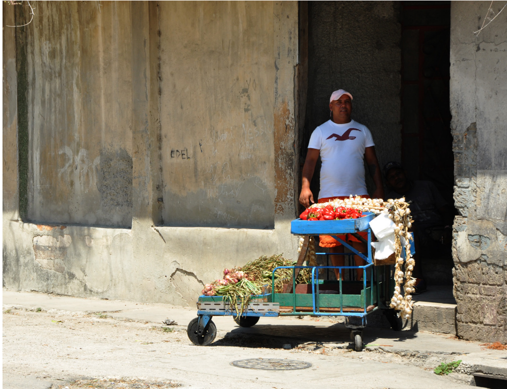
Entrepreneurs are popping up on Cuban sidewalks and street corners since President Raúl Castro began to expand the small-business sector in the late 2000s.