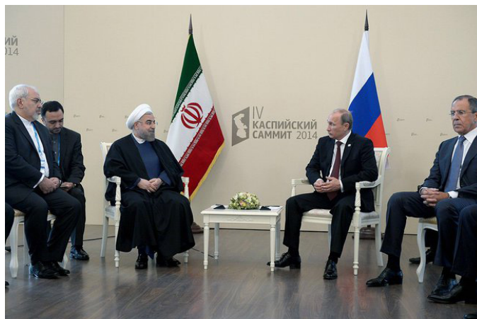
Iranian President Hassan Rouhani (center left) talks with Russian President Vladimir Putin (center right) during Caspian Sea Summit in Astrakhan, Russia, September 29, 2014.