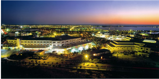
Iran's Chabahar port at night. Iran hopes that the development of Chabahar will boost trade.

New Delhi's INSTC will include multi-modal transportation routes running from the Iranian port through Iran and Afghanistan providing India long denied access to Central Asia. India has had difficulty establishing a position in Central Asian oil and gas production, in part due to its lack of direct access to the region. The INSTC would help eliminate the geographic leverage that Russia and China exert over the Central Asian states' exports and, therefore, their economies.