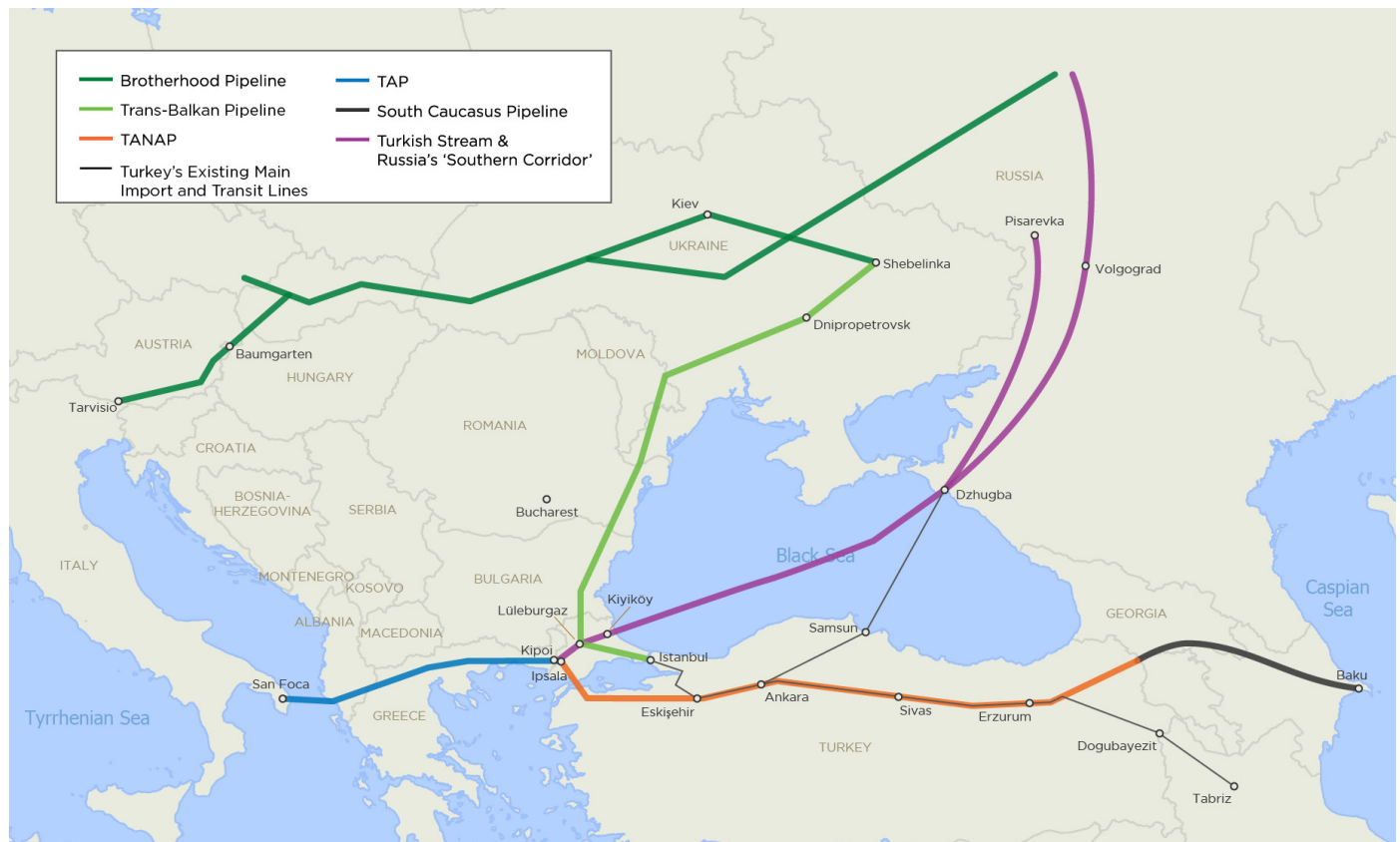
Map 1. The Eurasian Pipeline Network