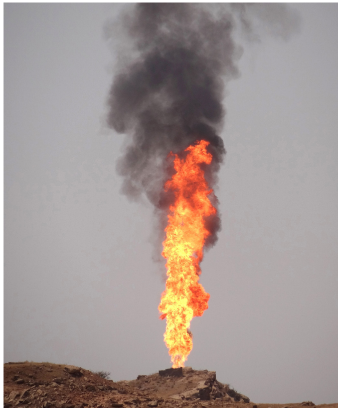
A gas flare near Gachsaran, Iran. Iran's natural gas exports will be the central factor impacting the Euro-Atlantic community's interests in the Eurasian energy infrastructure.

Almost all of Iran's current gas production is domestically consumed. While Iran exports a small volume of natural gas, primarily to Turkey, it has had to import gas from Turkmenistan. 12 In 2013, 90 percent of Iran's 9.2 bcm of