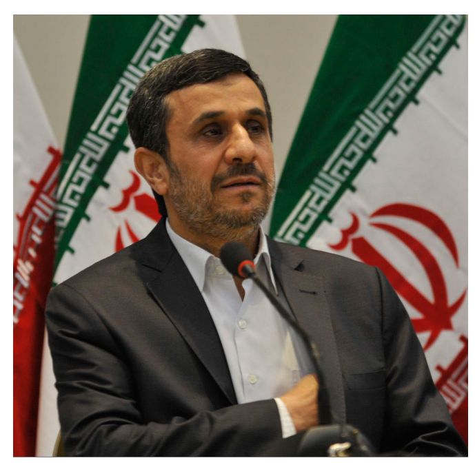
The 2005 election of hardline President Mahmoud Ahmadinejad heightened Saudi-Iran tensions after a temporary thaw.

gas necessary to avoid stifling economic activity.<sup>26</sup> To counter this limitation, Saudi Aramco has been seeking to develop non-associated gas fields, finding some success in the Karan dry gas field, which produces 1.8 billion cubic feet per day, and looking to find more in the Arabiyah and Hasbah fields, which could come to production toward the end of 2015. Nonetheless, these fields are difficult and expensive to tap because they are offshore and produce sour gas, which in light of the heavily subsidized domestic NG prices ($0.75 per million BTUs as set by the Council of Minister), would create large, albeit undisclosed, losses to Saudi Aramco.<sup>27</sup> Since NG is plentiful in some parts of the Gulf, it makes little sense for the kingdom to spend a great deal of money to develop expensive alternatives.