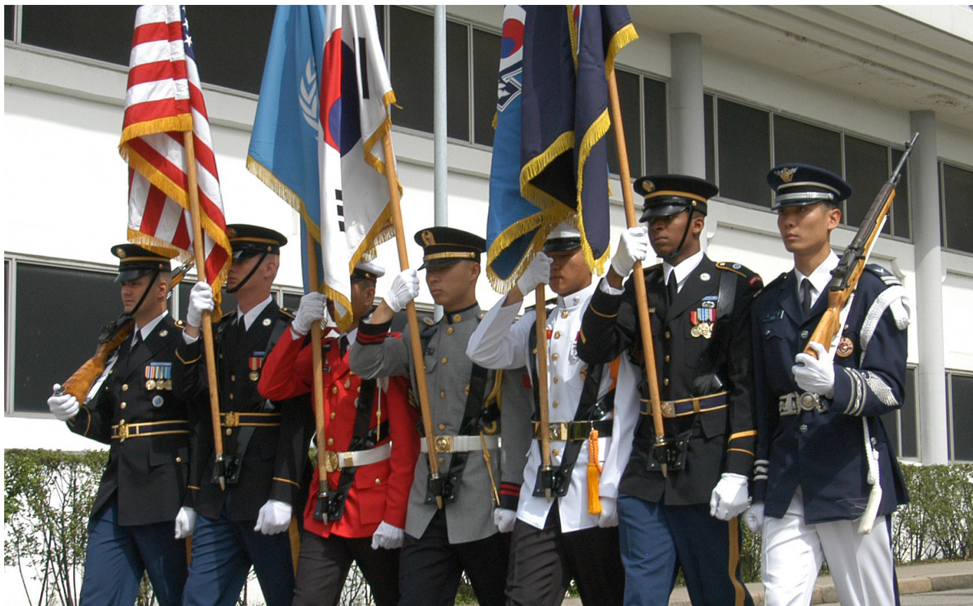
South Korean and US soldiers parading during a Memorial Day ceremony organized by United States Forces Korea.

considered the most important in the world in strategic terms by scholars and policymakers alike. 55 The United States and its allies, however, do not have the same kind of extraordinarily antagonistic relations with China as Washington and its allies did with Moscow during the Cold War. The relationship between the United States and China is far more complicated. Washington seeks to manage Beijing's rise by balancing, but also by pursuing robust trade ties and cooperation with China. South Korea itself does not seek to balance China and is nervously hedging between Washington and Beijing. Nevertheless, the importance of the Korean peninsula in maintaining stability in Northeast Asia and in protecting vital US security interests in the region has not changed.