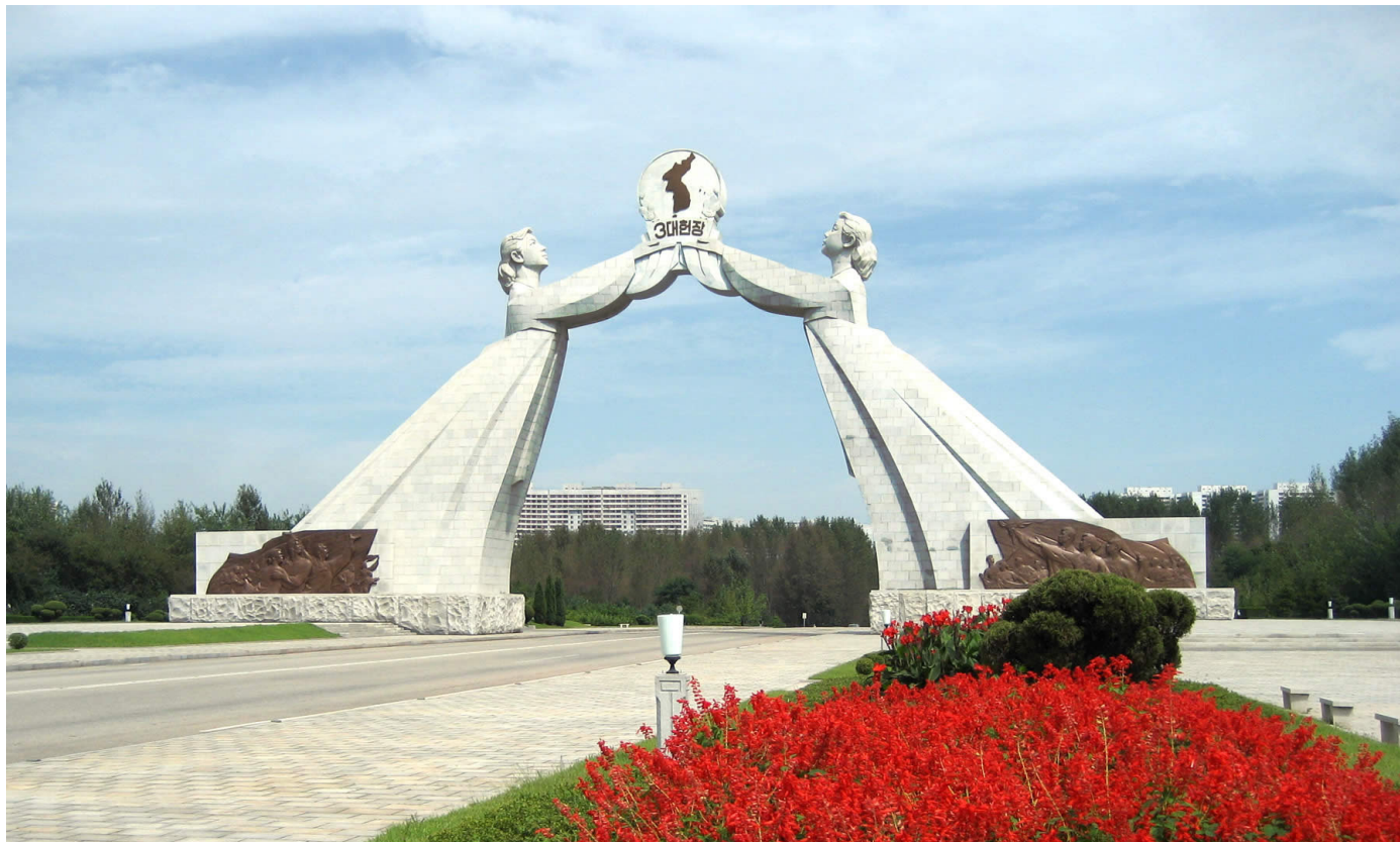
The so-called Arch of Reunification erected in 2001 in Pyongyang, North Korea.

third”) that mocked Kim Jong-un on Chinese social media. 14 China might still take minor actions to express displeasure or attempt to pressure North Korea. Nevertheless, Beijing is unlikely to push far enough to cause Pyongyang to change its behavior out of the concern that the Kim regime might destabilize or lash out. North Korea might then take advantage of China’s policy of tolerance to act more assertively and aggressively.