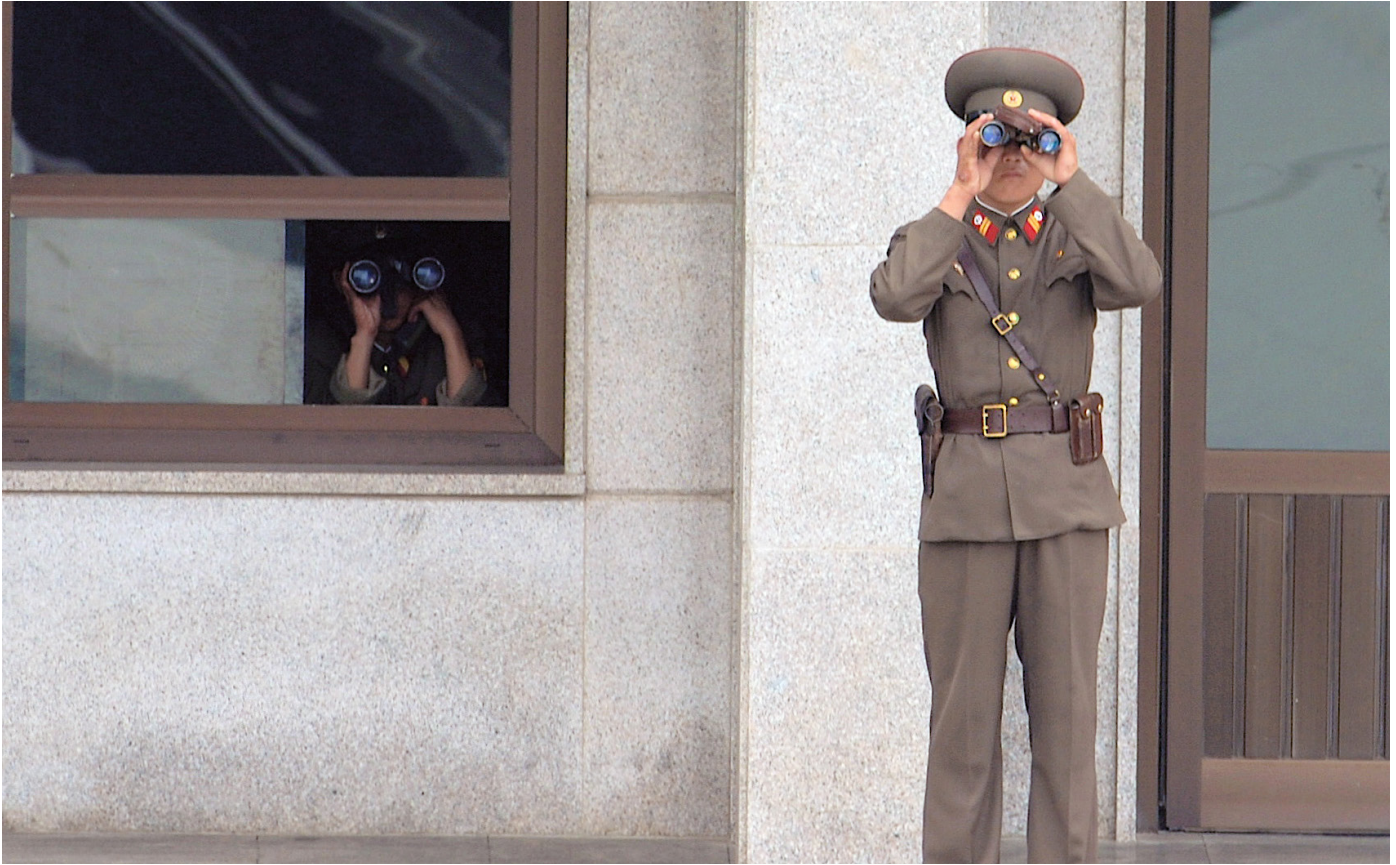
North Korean soldiers looking across the Korean Demilitarized Zone.

The factor that might lead to the fall of the Kim regime is North Korea's pervasive black market economy. With the end of the Cold War, Soviet and Chinese aid more or less dried up, partially contributing to the outbreak of a massive famine in North Korea between 1994 and 1998, leading to somewhere between 240,000 and 3,500,000 deaths out of a total population of about 22 million at the time. 31 During this period, North Korea's state-run food distribution system collapsed, leaving ordinary North Koreans to survive on their own by engaging in black market activities, which are now widespread and are even utilized by North Korean government officials to reap their own private profit. According to a survey of North Korean refugees conducted by Marcus Noland and Stephan Haggard, "nearly half of respondents said all of their income was derived from private business activities at the time they left the North." 32 Furthermore, the country's economy is gradually becoming beholden to dollars and yuans rather than North Korean won. As of 2015, "Pyongyang has become a de facto dollar-using economy, while border regions and economic zones such as the Rajin-Sonbong area are