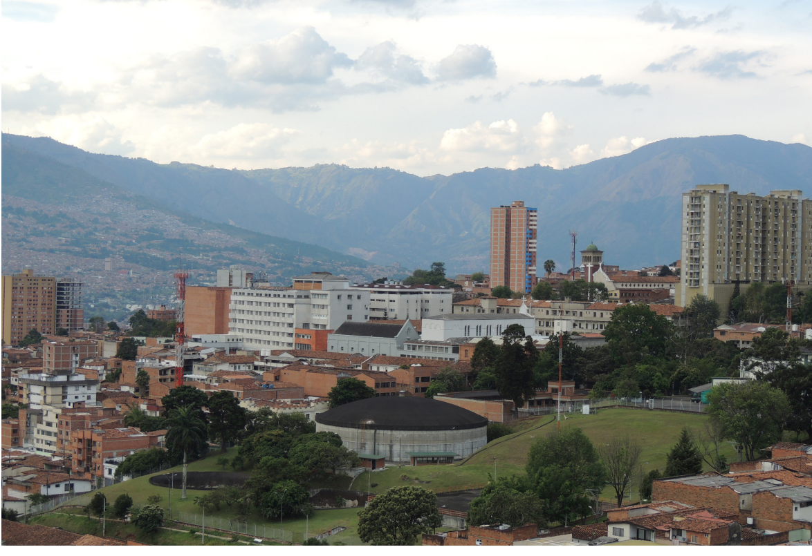
A new image. Medellín, once known for its crime, is now associated with innovation.

Security was restored and other critical institutional changes were made. However, institutional legitimacy and public trust have worsened in recent years. Corruption scandals are tainting local and regional administrations, government budgets sometimes make their way into the hands of a political class interested in deepening traditional patronage, and the judiciary and