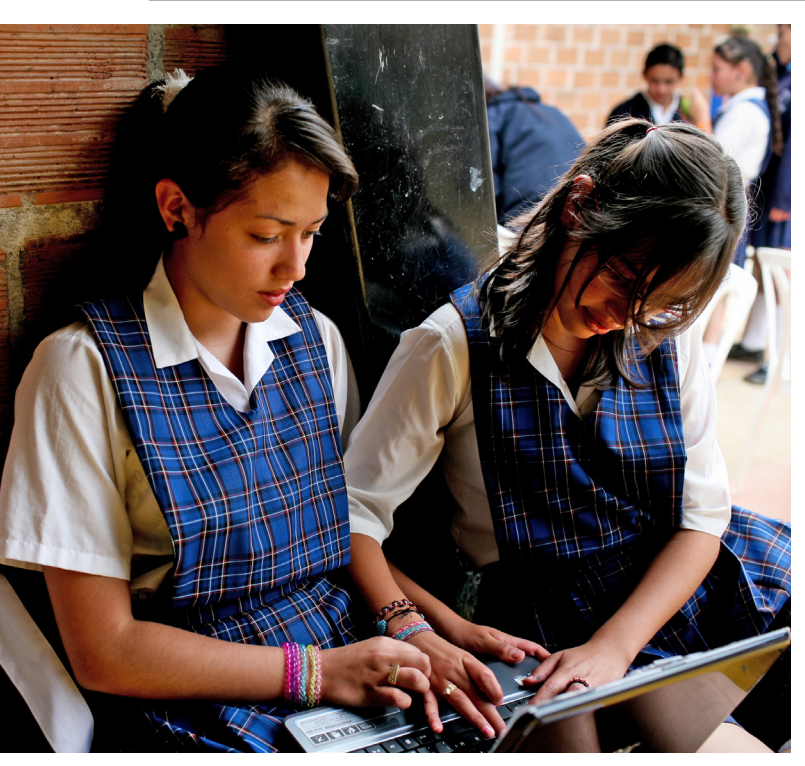
Educational access is up, but quality remains a concern. Here, students at a rural high school in the department of Antioquia.

equivalent to a 500 percent increase over the past thirteen years.<sup>24</sup> Today, Colombia is ranked eighteenth on the list of FDI recipients generated by the Trade and Development Conference of the United Nations.<sup>25</sup>