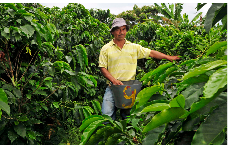
Now, more of a shot at social mobility. A coffee farm worker in the department of Cauca.

n the early 1990s, Colombia faced serious challenges in terms of health care services. Less than 20 percent of the population had health insurance coverage. In 1993, the Law on Social Security (Law