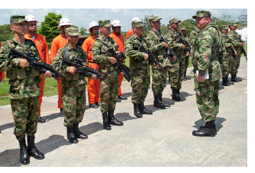
The armed forces are widely credited for helping to usher in Colombia's security transformation. Here, troops are prepared for inspection.

lthough peace is potentially closer than ever. Colombia is still home to the world's longest armed conflict. Its origins stretch to the mid-1960s, but the initial catalyst dates back to the 1948 assassination of Liberal caudillo Jorge Eliécer Gaitán. This unleashed "La Violencia"-two decades in which Liberal and Conservative party members killed one another in a struggle for political power. The two parties finally agreed in 1958 to alternate the presidency every four years and equally divide all other governmental positions. However, as was the case in many Latin American countries, left-wing guerilla groups-including the Revolutionary Armed Forces of Colombia (FARC) and the National Liberation Army (ELN) that still exist today—emerged and gained strength in the decades after the Cuban Revolution.