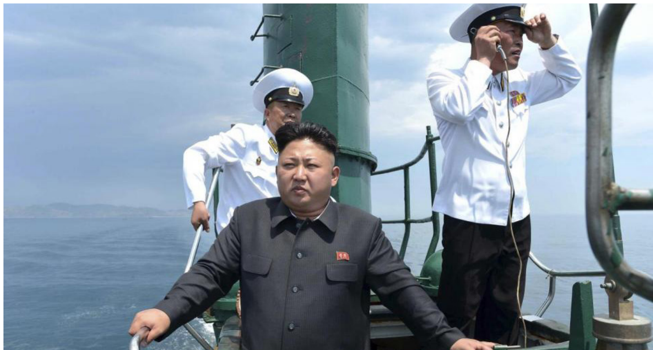
North Korean leader Kim Jong-un stands on the conning tower of a submarine during his inspection of the Korean People's Army Naval Unit, June 2014.

people—may have died of starvation, but there was no significant attempt by the international community to intervene. 16 Thus, so long as some semblance of central government existed in Pyongyang, the international community would be reluctant to intervene in North Korea no matter how severe the humanitarian crisis—particularly since the North Korean government would now be presumed to possess nuclear weapons.