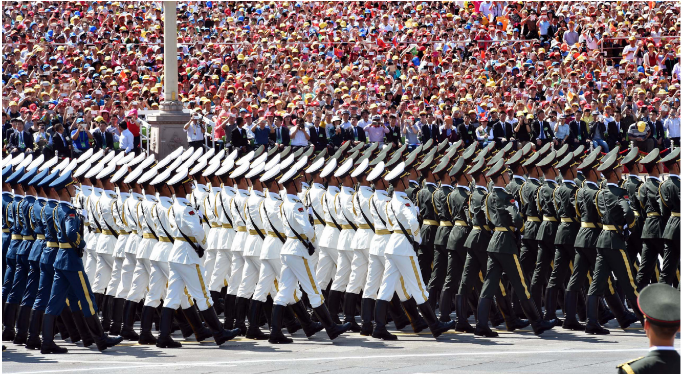
Chinese Military Parade during the Victory Day celebrations, Beijing, September 2015. Photo credit: GovernmentZA/Flickr.

in the case of surface ships, the capability to shoot down or otherwise defeat anti-ship missiles; and the ability to shoot down, sink, or drive off Chinese aircraft and ships (including submarines) that are attacking Japan's ships and aircraft.