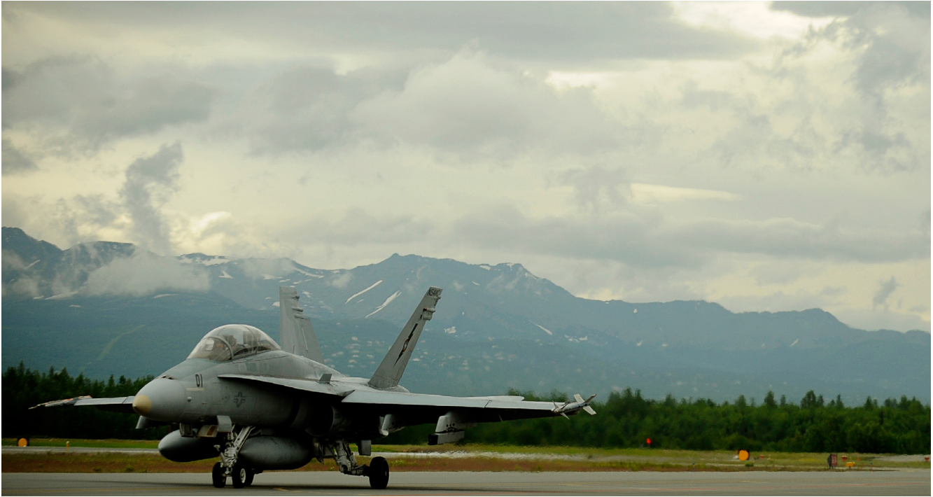
F/A-18's from Marine Corps Air Station Futenma, Okinawa, Japan, taxi out to the runway during exercise Northern Edge 2009, Alaska, June 2009.

focused on this problem for more than two decades, ever since the Iraqi Scud attacks of the 1991 Gulf War. Even today, however, the US capability to accomplish this task is limited. For Japan to acquire an independent capability to perform this mission would require an enormous investment of resources by a country whose defense spending is tightly constrained. For these reasons, Japan should refrain from attempting to acquire a capability to find and destroy mobile missile launchers greater than that required to neutralize the mobile missile launchers that could be landed on a small island such as Ishigaki-shima or Miyako-jima. Defense against the North Korean ballistic missile threat should center on improved missile defenses and nuclear, biological, and chemical incident-response capabilities. Japan should depend on the United States to deter North Korea from launching missiles against Japan or, if deterrence fails, to conduct any operations to find and destroy missile launchers before they can launch their missiles.