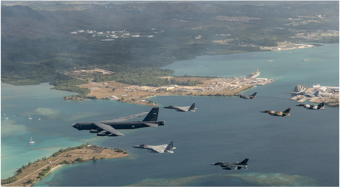
US Air Force, Japan Air Self-Defense Force and Royal Australian Air Force aircraft, fly in formation during an exercise Cope North 15, off the coast of Guam, February 2015.