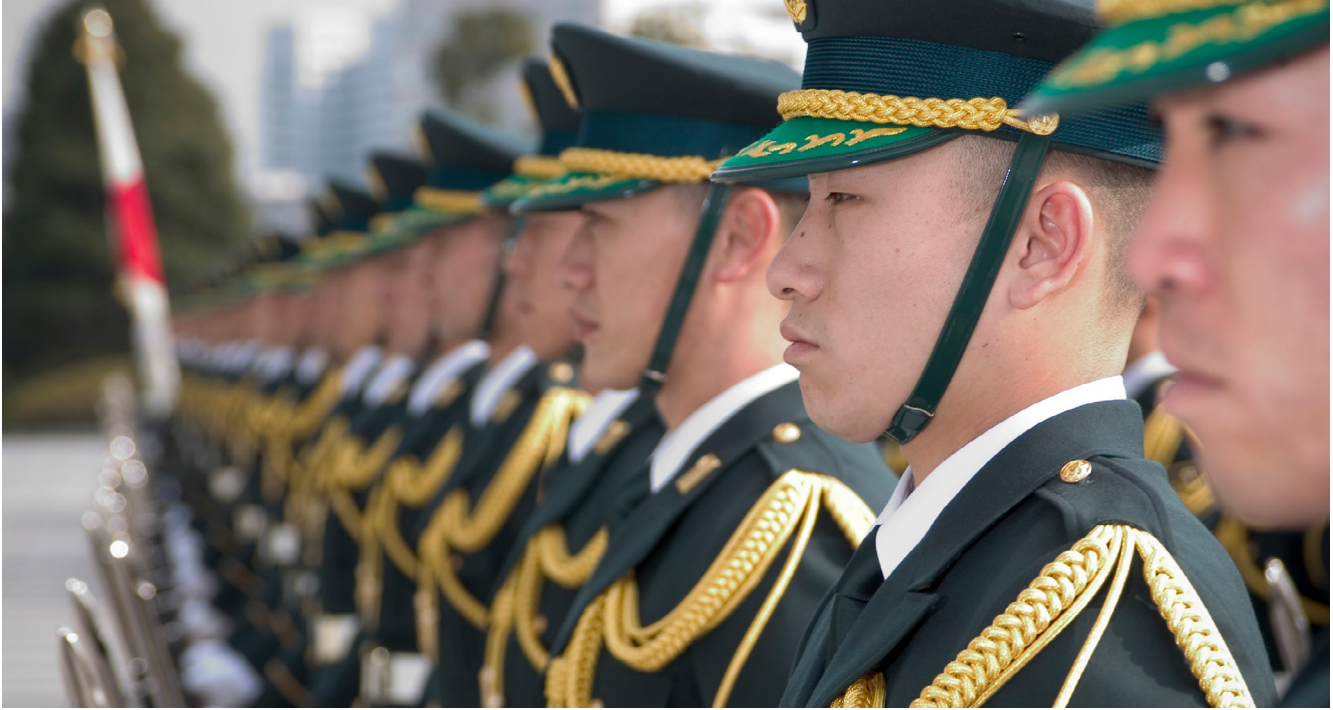
Japan's Ground Self-Defense Force Special Honor Guard stand in formation awaiting the arrival of the US Chief of Naval Operations, Adm. Mike Mullen, Tokyo, January 2006.