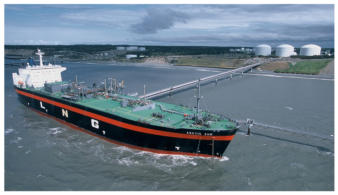
The Kenai LNG Plant in Alaska has exported US LNG to Japan for more than forty years.

Bolivia's production has leveled off as key fields decline and lower gas prices constrain investment.