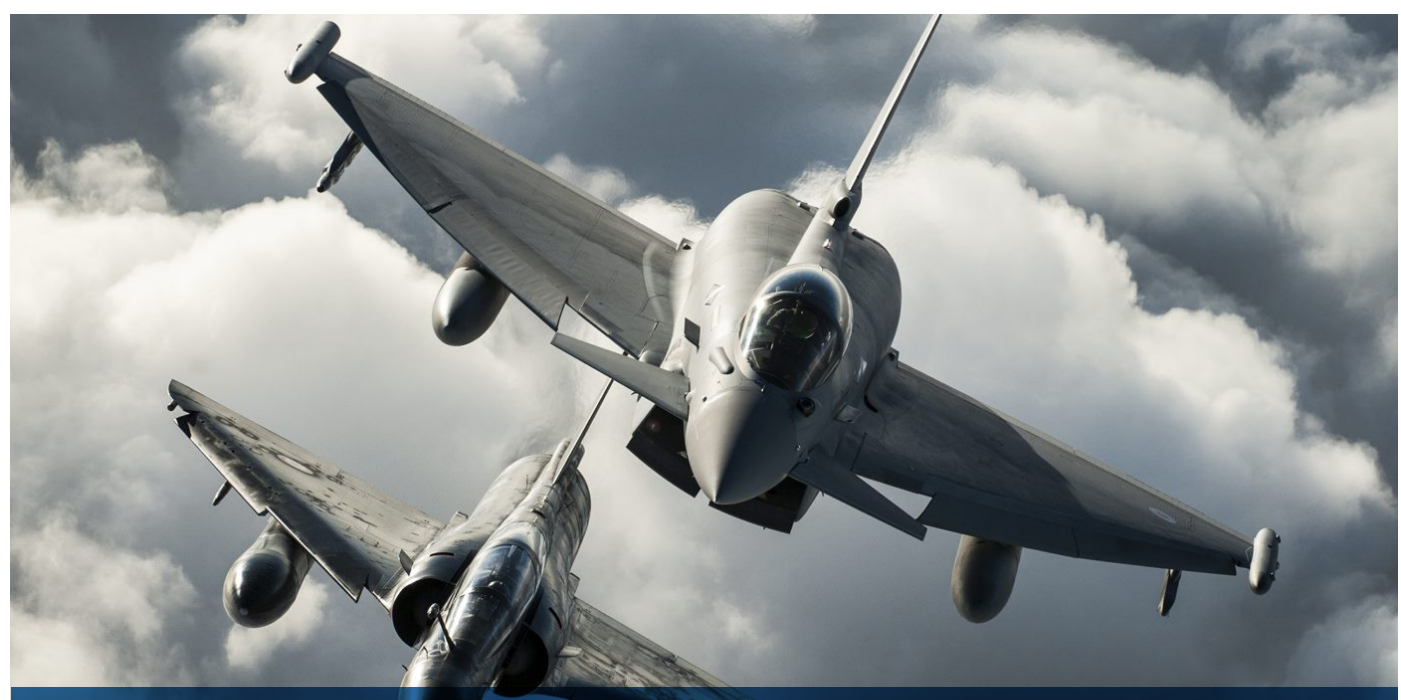
Exercise Capable Eagle: British and French forces conduct a joint exercise to improve military cooperation. An RAF Typhoon (top) and a French Air Force Mirage (below) practice their drills together during the 2013 exercise.

equipment worth $7 billion. These defense sales, and several others, not only help France conduct what is often termed as "realpolitik defense diplomacy" with Gulf countries but also heavily contribute to the wellbeing of its national defense industry, which relies extensively on exports.<sup>13</sup> In addition to selling various types of weapons, France periodically conducts joint exercises with Gulf militaries. For example, in November 2013, French and Saudi Arabian forces conducted an air and ground drill to train soldiers on offensives in al-Sirwat mountain range in southwestern Saudi Arabia.<sup>14</sup> In February-March of that year, French and Qatari forces conducted their quarterly Gulf Falcon Exercise 2013, involving roughly 1,300 French and 1,700 Qatari soldiers engaged on operational and tactical levels on the ground, in air, and at sea. The previous exercise in 2008, dubbed Gulf Shield 1, involved French, Qatari, and Emirati forces (including 1,500 French military personnel, two frigates and eight Mirage fighter jets) and was focused on large-scale war games in the Gulf.<sup>15</sup>