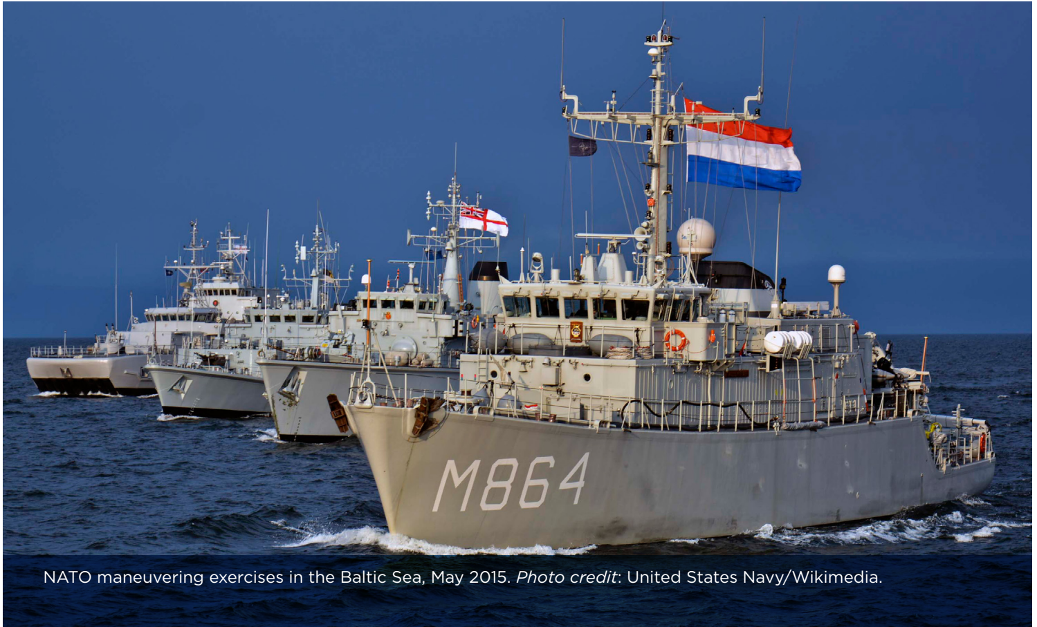
NATO maneuvering exercises in the Baltic Sea, May 2015.

to incorporate Finland and Sweden as part of their partnership efforts. 2