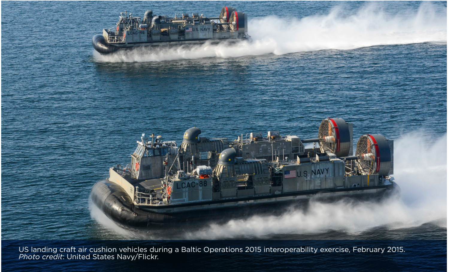
US landing craft air cushion vehicles during a Baltic Operations 2015 interoperability exercise, February 2015.

submarines, along with twelve patrol boats with limited anti-submarine warfare capabilities.