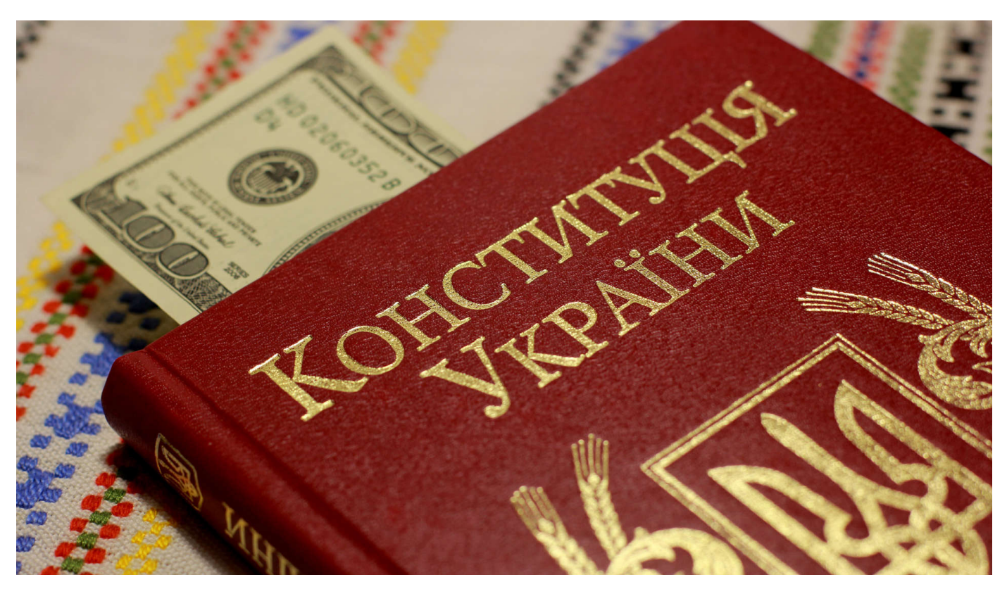
Constitution of Ukraine.

The Russian state has manifestly breached Article 2(4) of the United Nations Charter. The key question is how Ukraine realistically can obtain recovery for the losses it has suffered. Resolutions of the UN General Assembly and a ruling from the International Court of Justice might be possible pathways; but there are prior steps to be taken.