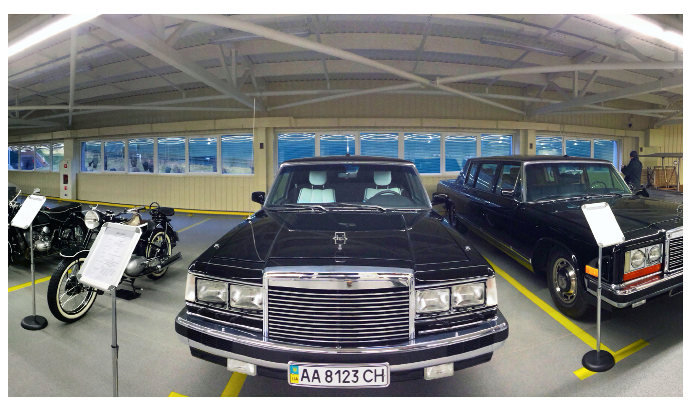
Ex-Ukrainian President Yanukovych's extensive collection of cars and motorcycles in Mezhyhirya, Yanukovych's former residence.

contributing to the resolution of the case. Under such circumstances, the prosecutor had the right to petition the Court for a verdict without trial." These deals quickly netted the Georgian state assets of over $1 billion.