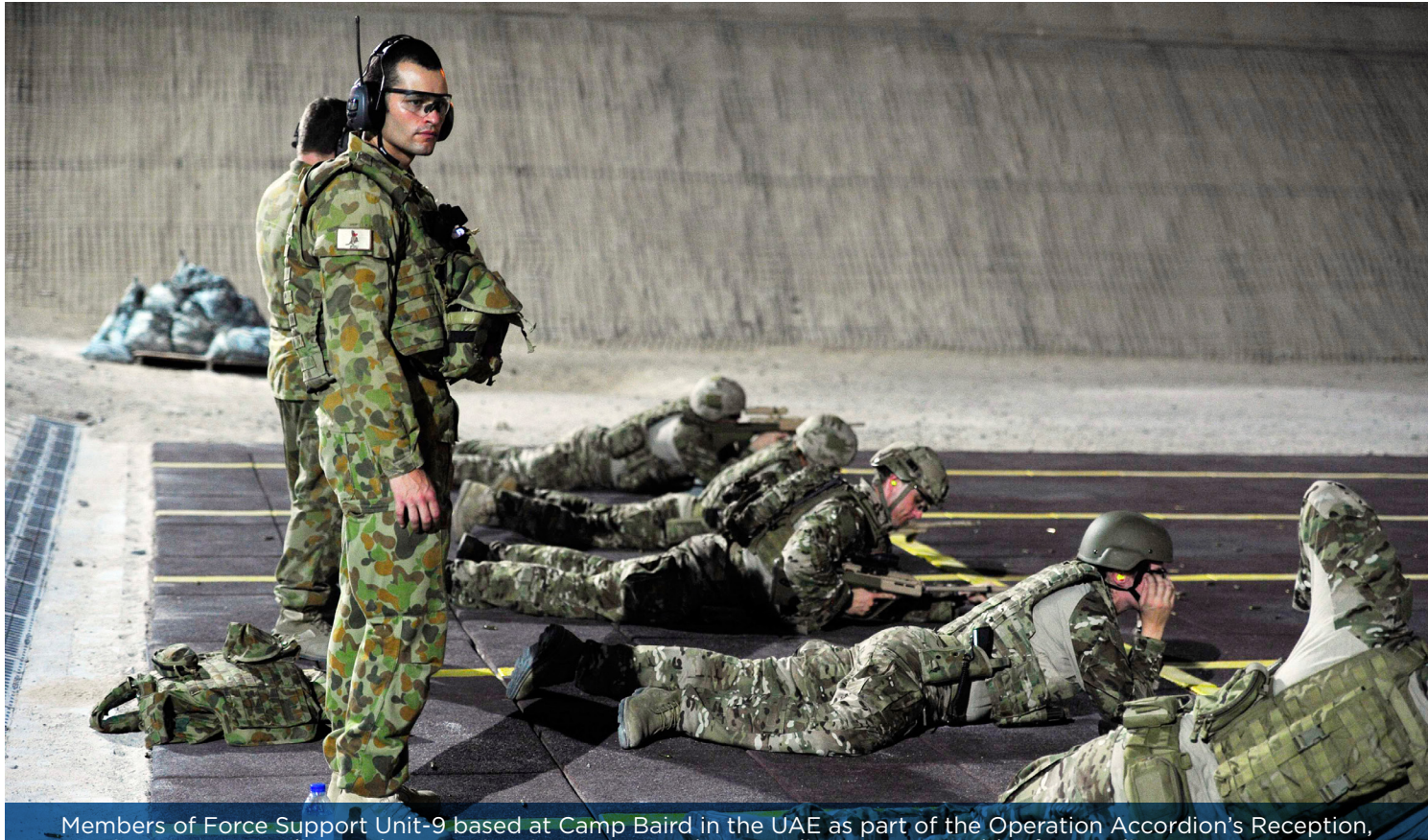
Members of Force Support Unit-9 based at Camp Baird in the UAE as part of the Operation Accordion's Reception, Staging, On-Forwarding and Integration, in May 2014.

agreements on law enforcement, climate change, higher education, and research cooperation. In 2013, the two countries signed a memorandum of understanding stating Australia would supply uranium for the UAE's four planned civilian nuclear power plants. In 2005 the two countries began discussions on a free trade agreement (FTA), and came close to signing one, until the GCC decided the following year that their members should sign only collective multilateral trade deals. Negotiations for an Australia-GCC FTA began in 2006, but have yet to be concluded.<sup>14</sup> Australia has flagged the GCC FTA as a policy priority.