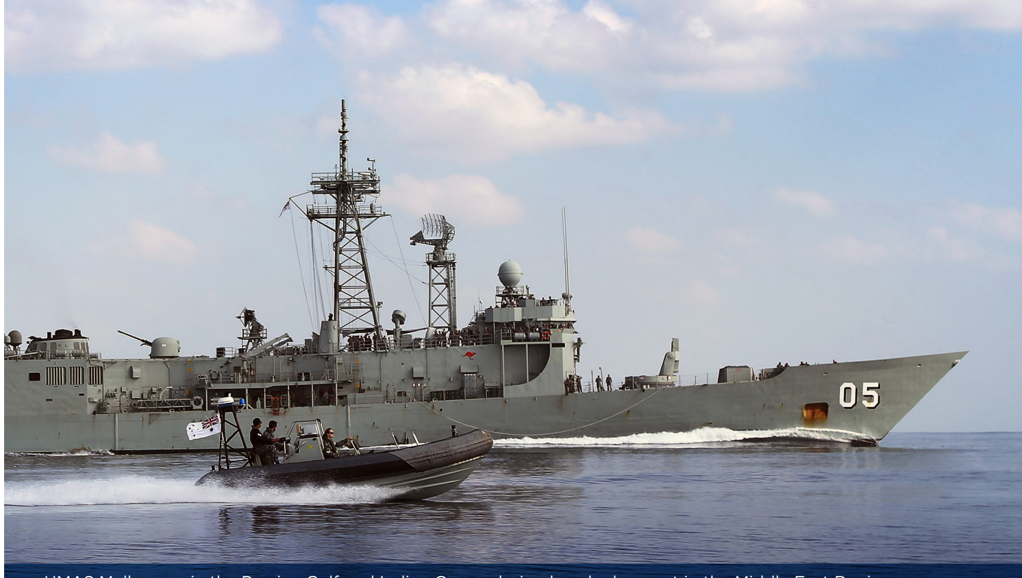
HMAS Melbourne in the Persian Gulf and Indian Ocean during her deployment in the Middle East Region on Operation MANITOU.

A third type of operation-the contribution of a major surface combatant for maritime security in the Gulf region-has endured continuously since the end of the first Gulf War and may help indicate the future of Australian interests in the region. That operation began as a contribution to US-led operations against Iraq, but has endured because it serves Australia's direct interests of maintaining free and secure trade routes, targeting piracy, and building regional cooperation.<sup>6</sup> These interests are not as high profile or high priority as responding to a crisis or supporting an ally, but are important nonetheless and provide broader benefits than are initially obvious. Through participation in the Combined Maritime Force, Australia gains operational experience for its forces; builds its international profile; contributes to achieving mutual allied objectives; strengthens regional cooperation and partner capacity;