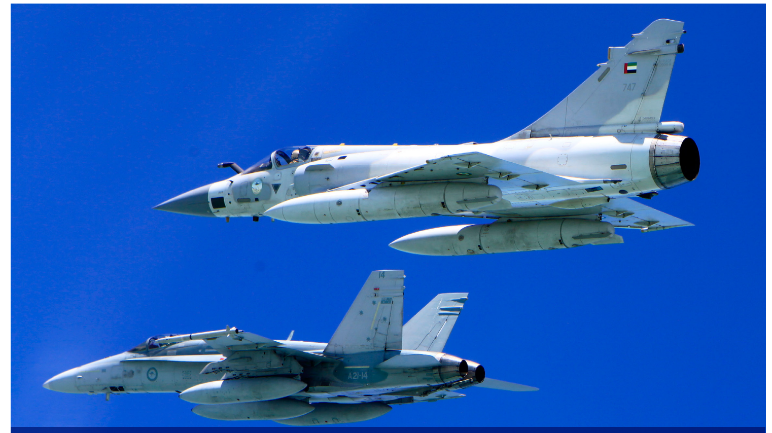
A Mirage 2000-9 from the UAE Air Force and an FA-18A Hornet from the Royal Australian Air Force fly side-byside during Exercise Pitch Black, August 2014.

the fear of foreign jihadists returning home or the potential spread of Islamic State of Iraq and al-Sham militants into Australia's backyard, it will be difficult to justify a significant presence in the Middle East to the Australian public. Cultural issues can also be a barrier in Australia, which has a problematic history with non-Anglo cultures. Despite a significant legacy of Arab populations in Australia from its earliest days, the 2005 Cronulla riots and current wave of Islamophobia show there are still challenges to cultural acceptance.<sup>21</sup>