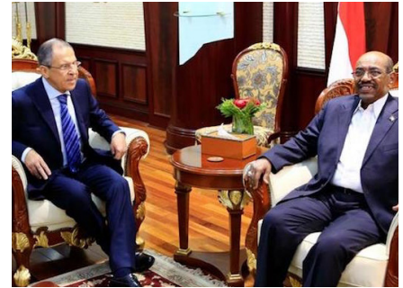
Russian President Vladimir Putin shakes hands with Syrian President Bashar al-Assad and Chinese President Xi Jinping; Russian Foreign Minister Sergei Lavrov meets with Sudanese President Omar al-Bashir.

Russia engaged in a broad covert operation not only to undermine public confidence in the integrity of the US presidential election, but also to influence its outcome. 23 Russian influence operations in Europe—including in Ukraine—may have served as a template for these activities. Concerns are now being raised about Russia's influence operations to impact the upcoming elections in the Netherlands, France, the Czech Republic, and Germany.