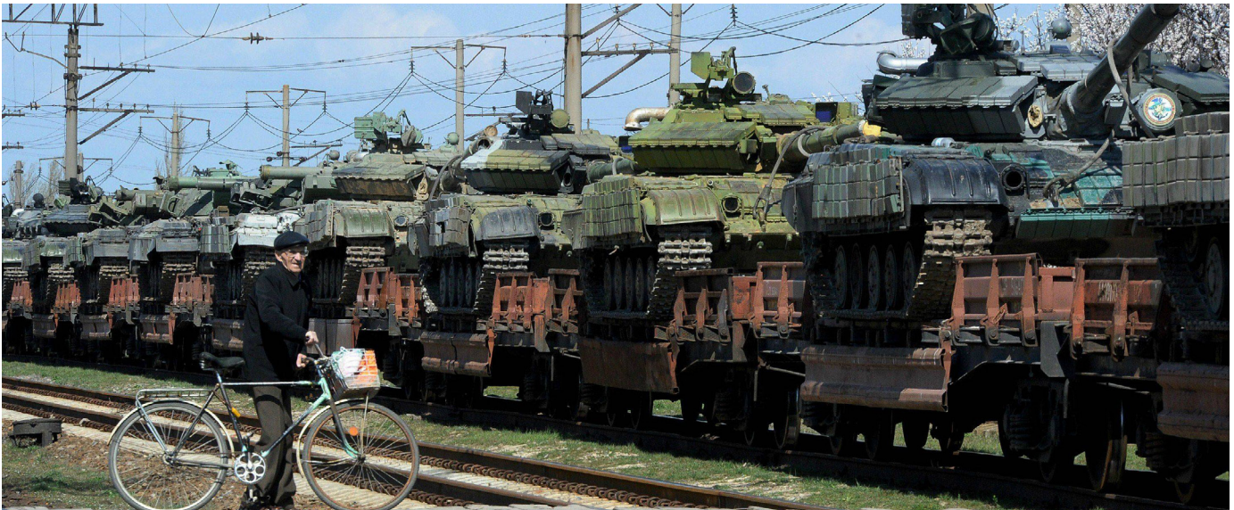
Russian tanks enter Crimea in March 2014 in flagrant violation of Ukrainian sovereignty.

1. Russia's use of force to seize control of foreign territory. Russia's decision to forcibly seize and annex Crimea represent a flagrant violation of international norms protecting sovereignty and territorial integrity. Since the end of World War II, the use of force to seize control of foreign territory has been remarkably rare and broadly condemned. 17 Moscow's seizure of Crimea appears intended, in part, as retribution for the Ukrainian people's uprising against pro-Moscow president Viktor Yanukovich. Moscow's action violated the terms of the Budapest Memorandum, to which it was a party. 18 It has also been met with global disapproval, with one hundred states voting in favor of a UN General Assembly resolution against Russia's actions in seizing Crimea. 19