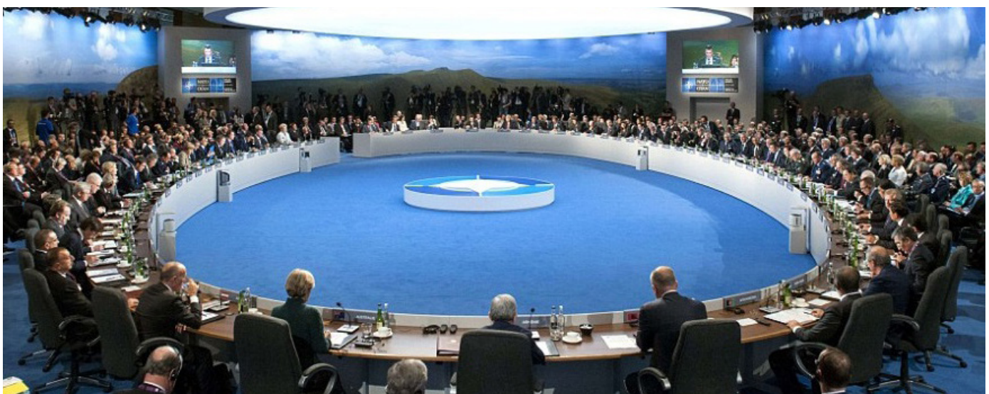
NATO leaders convene for a 2014 summit meeting. Allies must work toward a common strategic vision for Russia.

At the same time, Western policy should consciously pursue the longer-term strategic vision set forth above. If Russia begins to transition toward more democratic and accountable governance in the future, it could once again become a partner with the West in contributing to international security and supporting key tenets of the rules-based order.