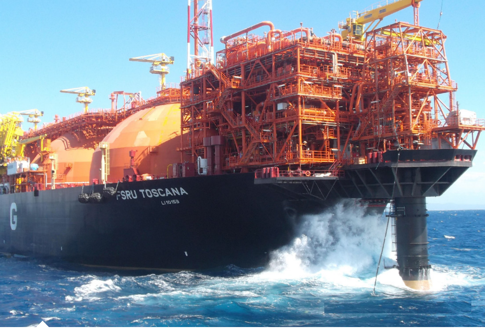
Italy's first cargo of US LNG was delivered from Sabine Pass to the floating storage and regasification unit (FSRU) Toscana on December 7, 2016. FSRUs are increasingly popular because they are quicker and less expensive to install than onshore facilities.

unit (mbtu). The price is close to the breakeven price of Russian pipeline gas but $2-3 below the full-cycle price for US LNG at today's Henry Hub price of about $3 per mbtu.<sup>9</sup>