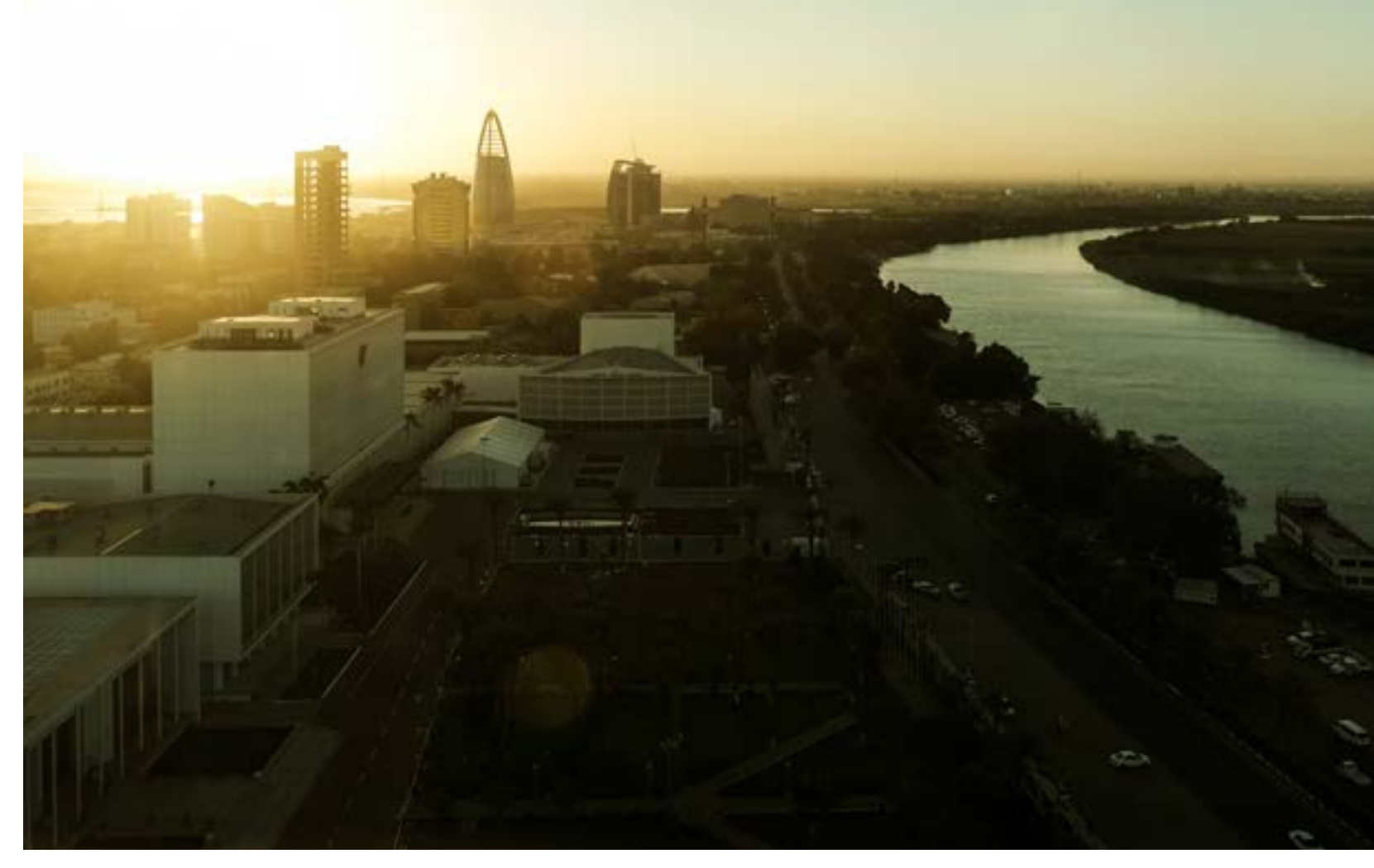
Sudan's capital Khartoum is strategically located along the Nile River.

Finally, the Khartoum leadership managed to survive, and to continue to enrich itself, by shifting the economic costs of its policies onto the general population. For instance, perhaps as much of 75 percent of the budget is devoted to national security and defense.<sup>12</sup> Bashir has defended this allocation, saying in 2015, "To those voices that speak in the street or in the media about the armed forces budget, I say that if 100 per cent of the state's budget was allocated to the army to secure the country then that would still not be enough."13 Over the long term, the neglect of the social sector has had a profound impact on the population of Sudan. For instance, Sudan is ranked 165th (out of 188 countries) in the United Nations Development Programme's 2016