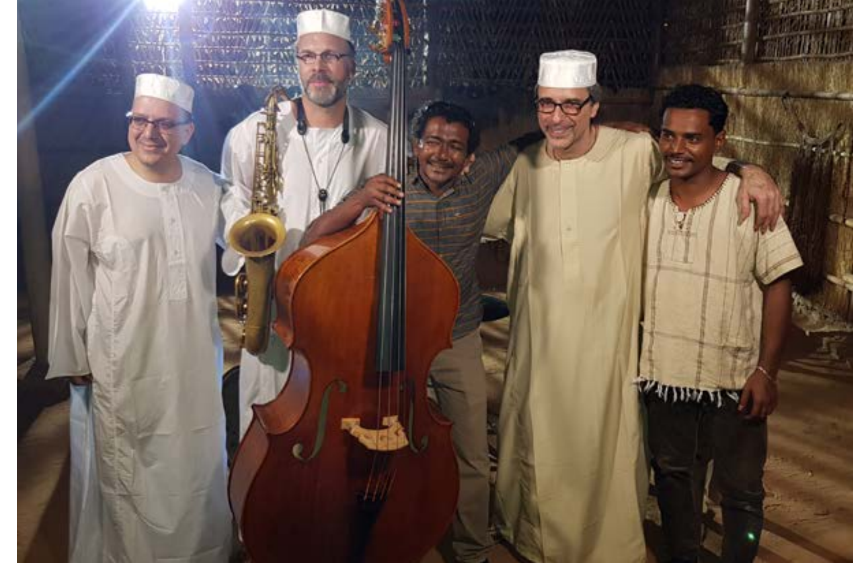
outfitted in Sudanese national dress.

US popular music, as well as more traditional genres like jazz and folk, is widely listened to in Sudan. In 2017, for example, an American jazz trio traveled to Sudan to participate in a series of public concerts and "master classes" with Sudanese musicians. While in Sudan, the group joined with local Sudanese musicians to film a music video-directed and produced Sudanese entrepreneurs-that has been wildly popular online.<sup>9</sup> Musical exchanges or training of this type-both in Sudan and in the United States-offer additional opportunities for widespread cultural engagement.