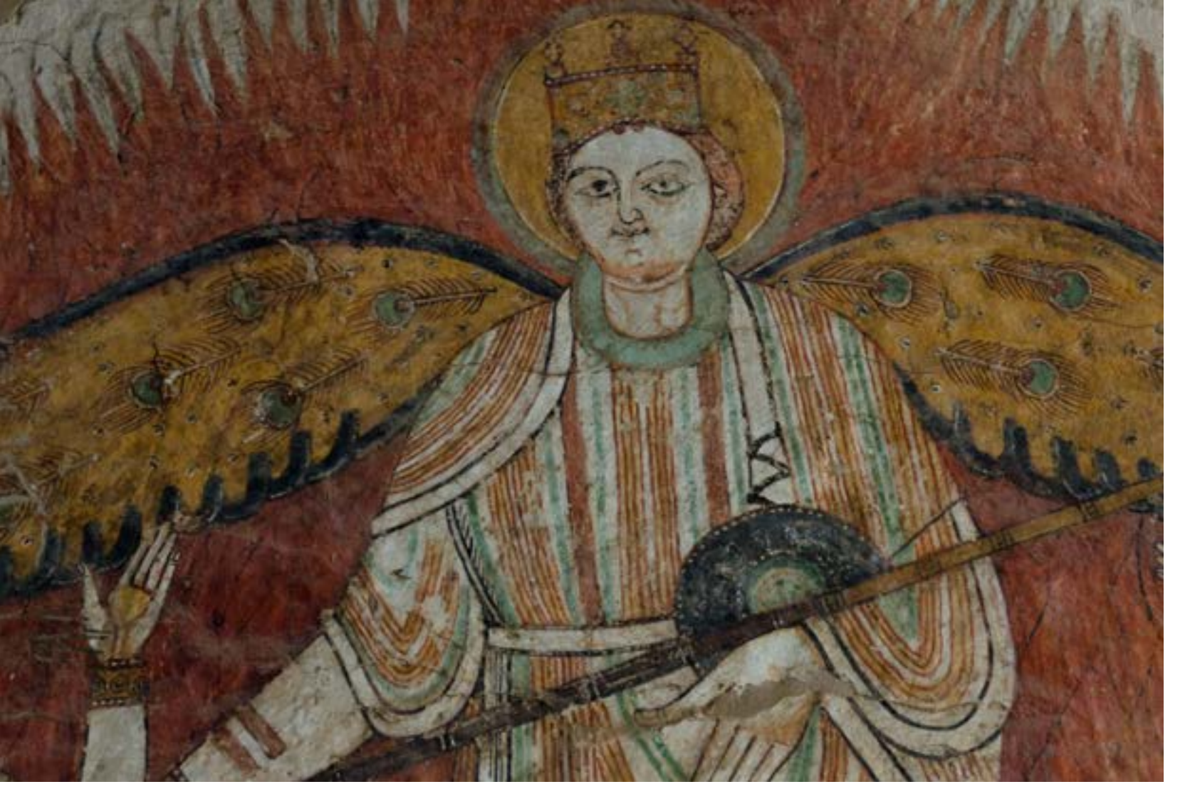
A Christian fresco of the Archangel Michael from the ancient Sudanese city of Faras (now underwater due to flooding from Egypt's Lake Nasser) is on display in the Khartoum National Museum. Many of Sudan's historic artifacts have been excavated and preserved with the assistance of western experts, and Sudan's ongoing archaeological sites remain of great interest to university researchers.

US colleges and universities, and through low-cost options like podcasts by academics. Some academic connections exist between the United States and Sudan-especially through the Sudanese diaspora in the United States—and should be leveraged. A similar opportunity offers to develop a curriculum on US literature for Sudanese students, particularly for those wishing to advance their English-language study.