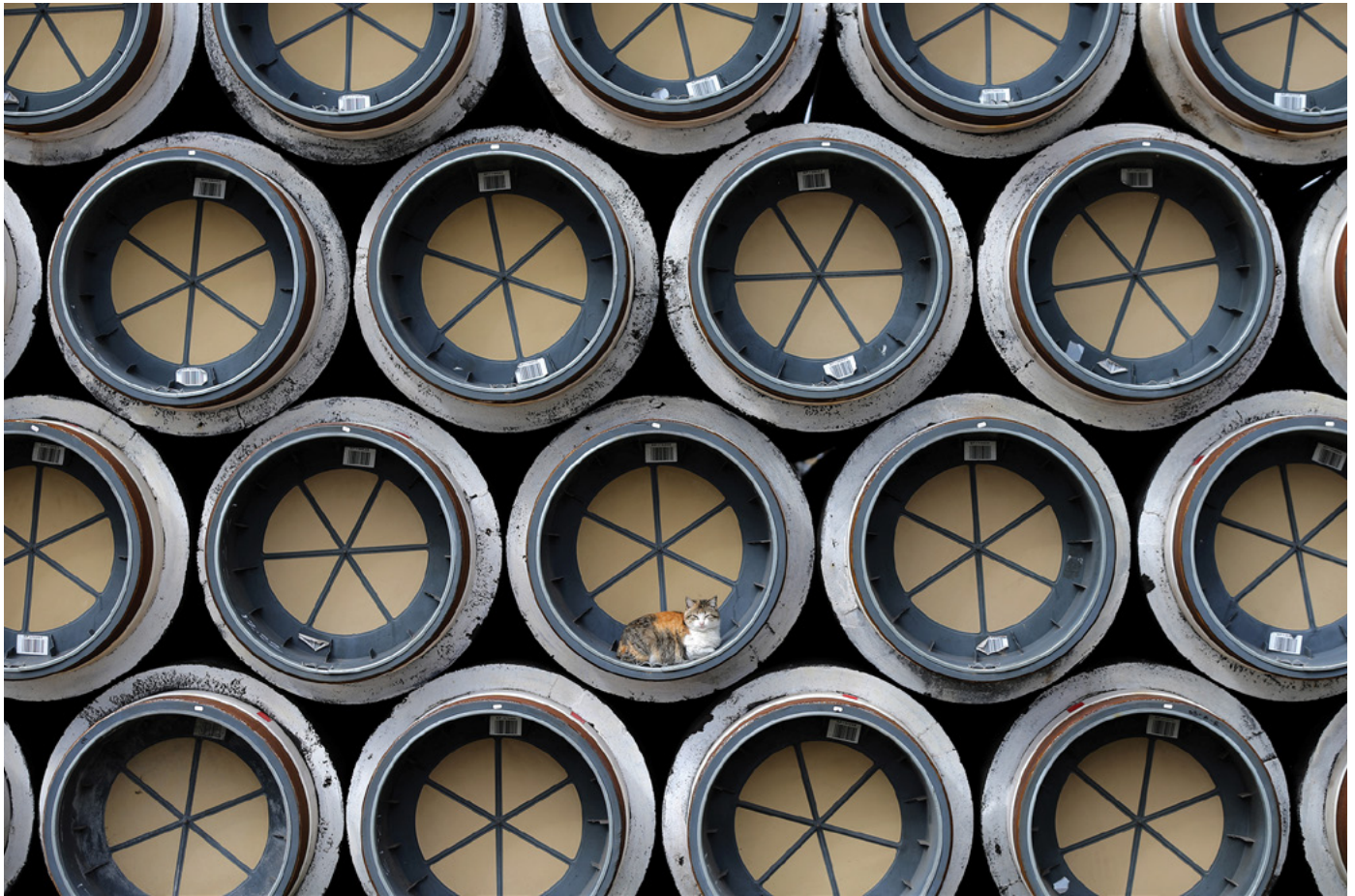
A cat rests among pipes meant to be used for construction in terminated South Stream gas project, stored in the Black Sea port of Varna, Bulgaria, March 27, 2018. Picture taken March 27, 2018.

requirements for other Gazprom customers in southeastern Europe, notably Bulgaria and Greece.