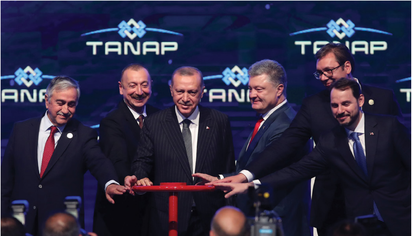
Turkish President Tayyip Erdogan poses with his counterparts Aleksandar Vucic of Serbia, Ilham Aliyev of Azerbaijan, Petro Poroshenko of Ukraine and Turkish Cypriot leader Mustafa Akinci during the inauguration ceremony of Trans-Anatolian Natural Gas Pipeline (TANAP), in Eskisehir, Turkey June 12, 2018.

including: the state of democracy in Hungary; rule of law; human rights, particularly concerning migrants; and the government's effort to close the highly regarded Central European University, funded by liberal Hungarian-born financier George Soros.