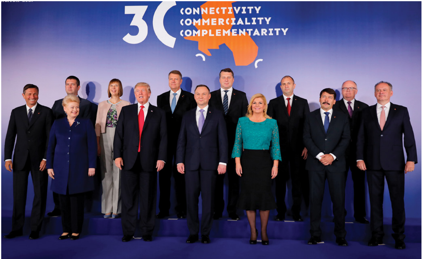
U.S. President Donald Trump, Polish President Andrzej Duda and Croatian President Kolinda Grabar-Kitarovic take part in a family photo along with other heads of states and delegates during the Three Seas Initiative Summit in Warsaw, Poland July 6, 2017.

secure a maximum of €195.9 million if the project were to secure PCI status. 67 But, this would still leave the three countries around €110 million short of necessary grant aid to ensure commercial operations in a low-throughput scenario.