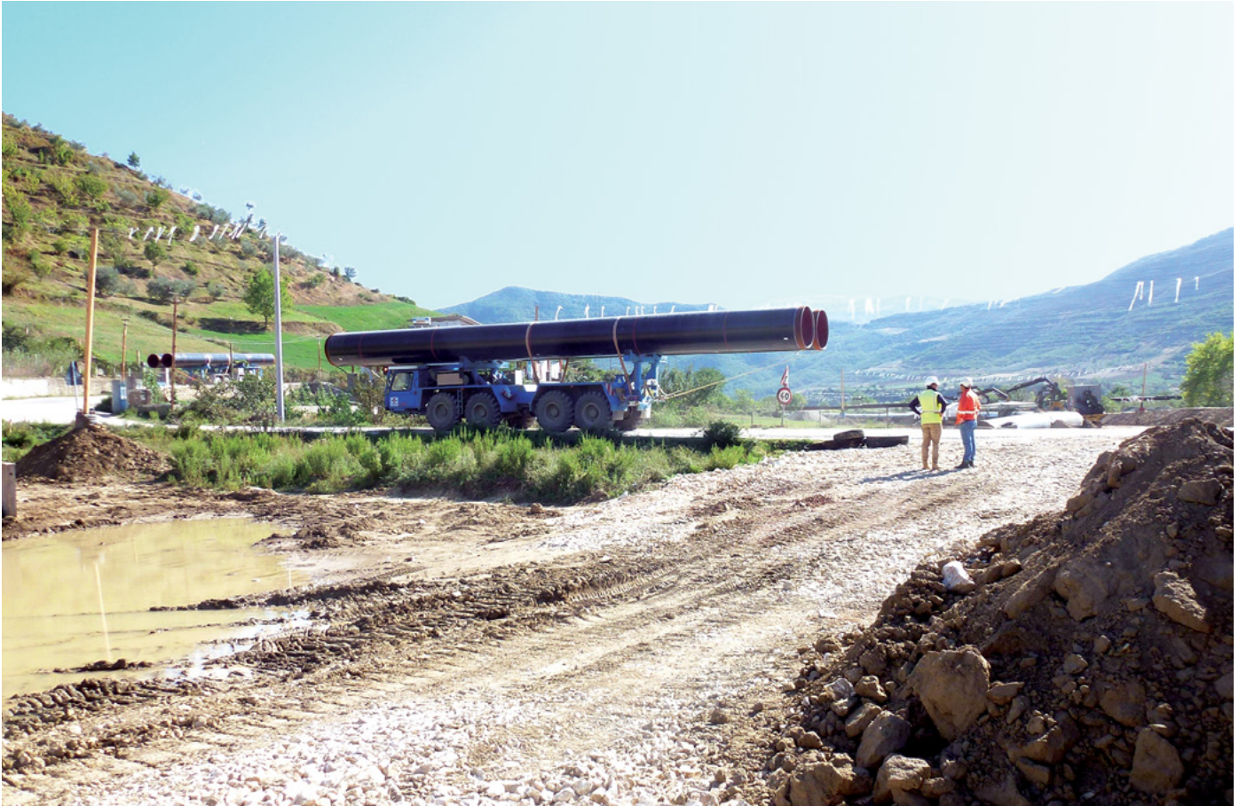
Pipes for the construction of the TAP pipeline through Albania, taken in September 2017. As of September 2018, pipelaying for the onshore portion through Albania is nearly complete.

constitutes a key market, and would play a crucial role in transmission to markets served by hubs like the Central European Gas Hub at Baumgarten. The ECA argues that Croatia, “as the only well-established and sizeable gas market connected to IAP will therefore play a crucial role as an anchor offtake markets over the first five to ten years of operation.” 43 Although gas accounts for one quarter of Croatia’s energy mix, the south and coastal parts of the country—in effect, the coastal strip south of Split and the Dubrovnik area—currently lack any significant gas supply.