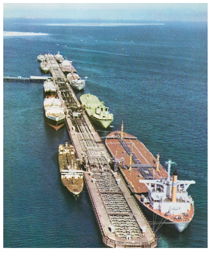
Large tankers loading at Kharg oil terminal, which handles significant quantity of Iran's crude exports.

to China belonged to the NITC.<sup>28</sup> Interestingly, Iran recently underwent a gap of not delivering oil to China for eighteen days, the longest in three years. Though it