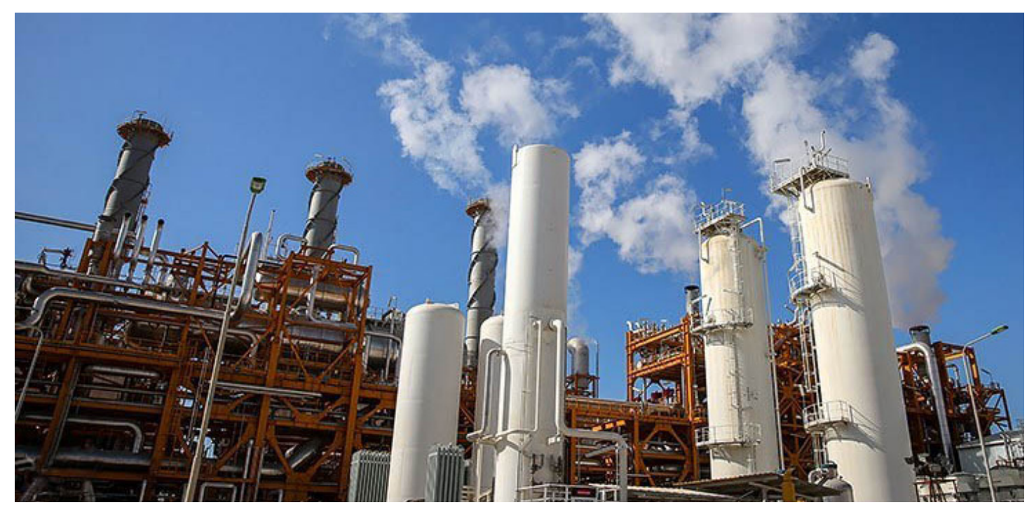
South Pars Onshore Facilities near Asaluyeh City, December 11, 2013.