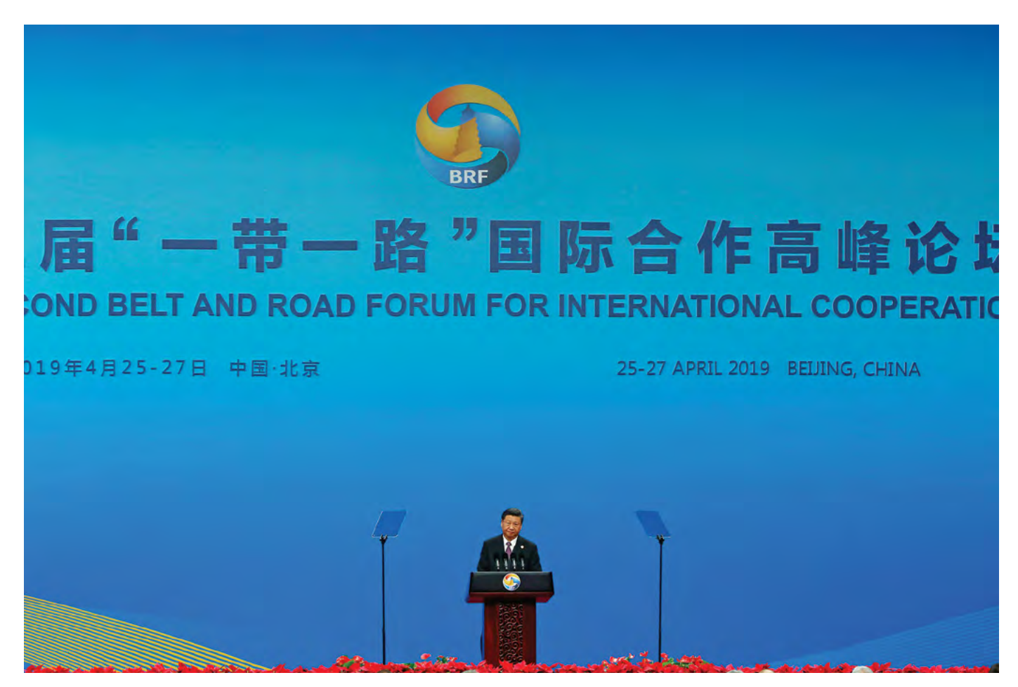
Chinese President Xi Jinping attends the opening ceremony for the second Belt and Road Forum in Beijing, China April 26, 2019.

taking office in 2014, and Chinese FDI into Egypt has spiked in the same period, drawing more than $15 billion.<sup>49</sup> This can partly be explained as a diversification policy by Egypt, as the United States and Europe grew more overtly critical of Cairo after al-Sisi's coup was followed by a crackdown on protests. In comparison, China's commitment to non-interference in the domestic politics of other countries presents an attractive alternative. An Egyptian official described the perception of China: "There are economic powers who have the ability to help us but not the desire, and others who have the desire but not the ability. China tops the list of those who have both the ability and the desire."50 China's port projects in Egypt, part of the "industrial park-port interconnectivity" initiative described above, are substantial, but only part of Chinese FDI into Egypt.