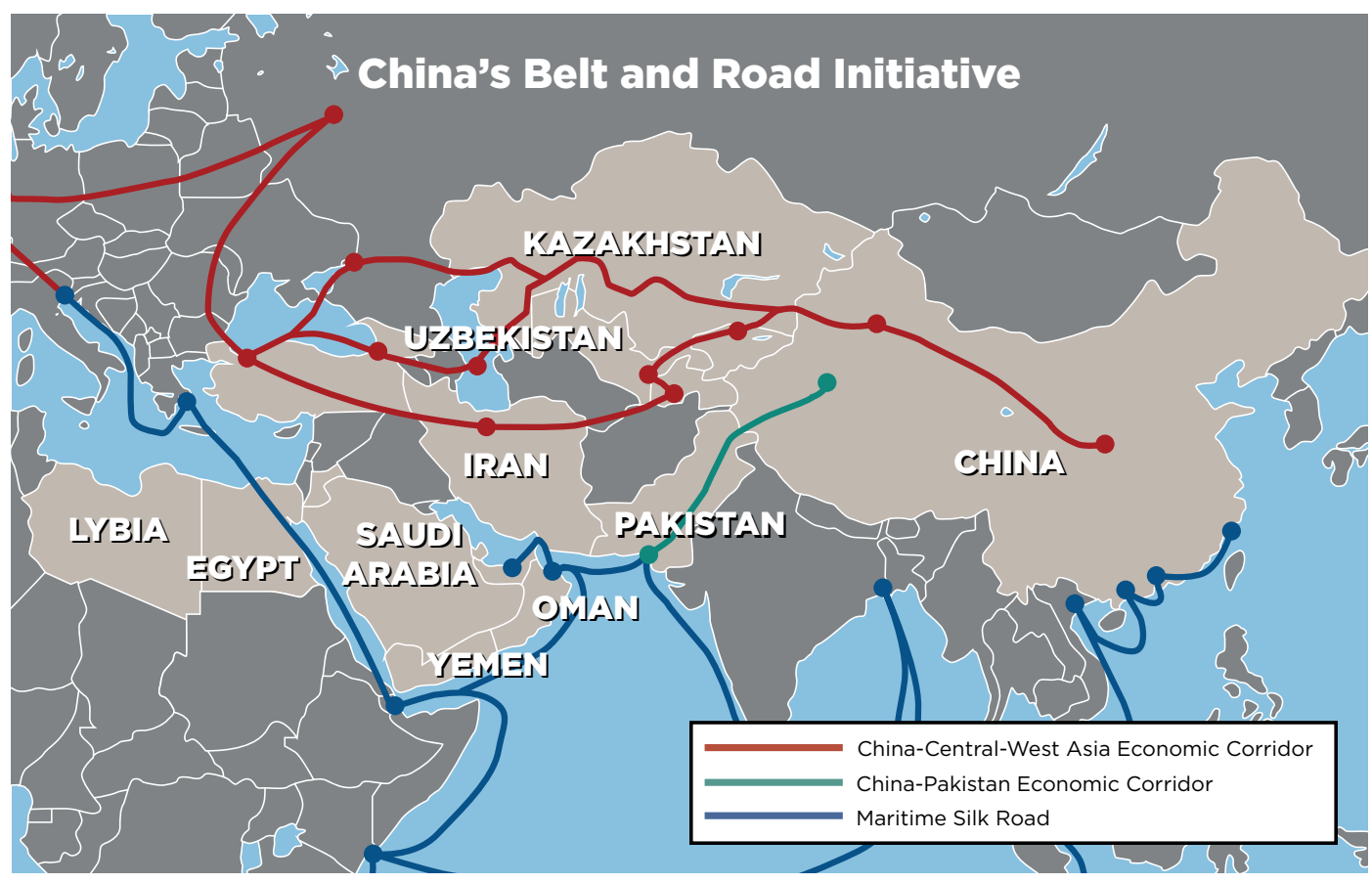
Map of China's Belt and Road Initiative. Sources: International Road Transport Union, Brookings, Council on Foreign Relations

accounting for 8 percent of China's global contracts during that period.<sup>46</sup>