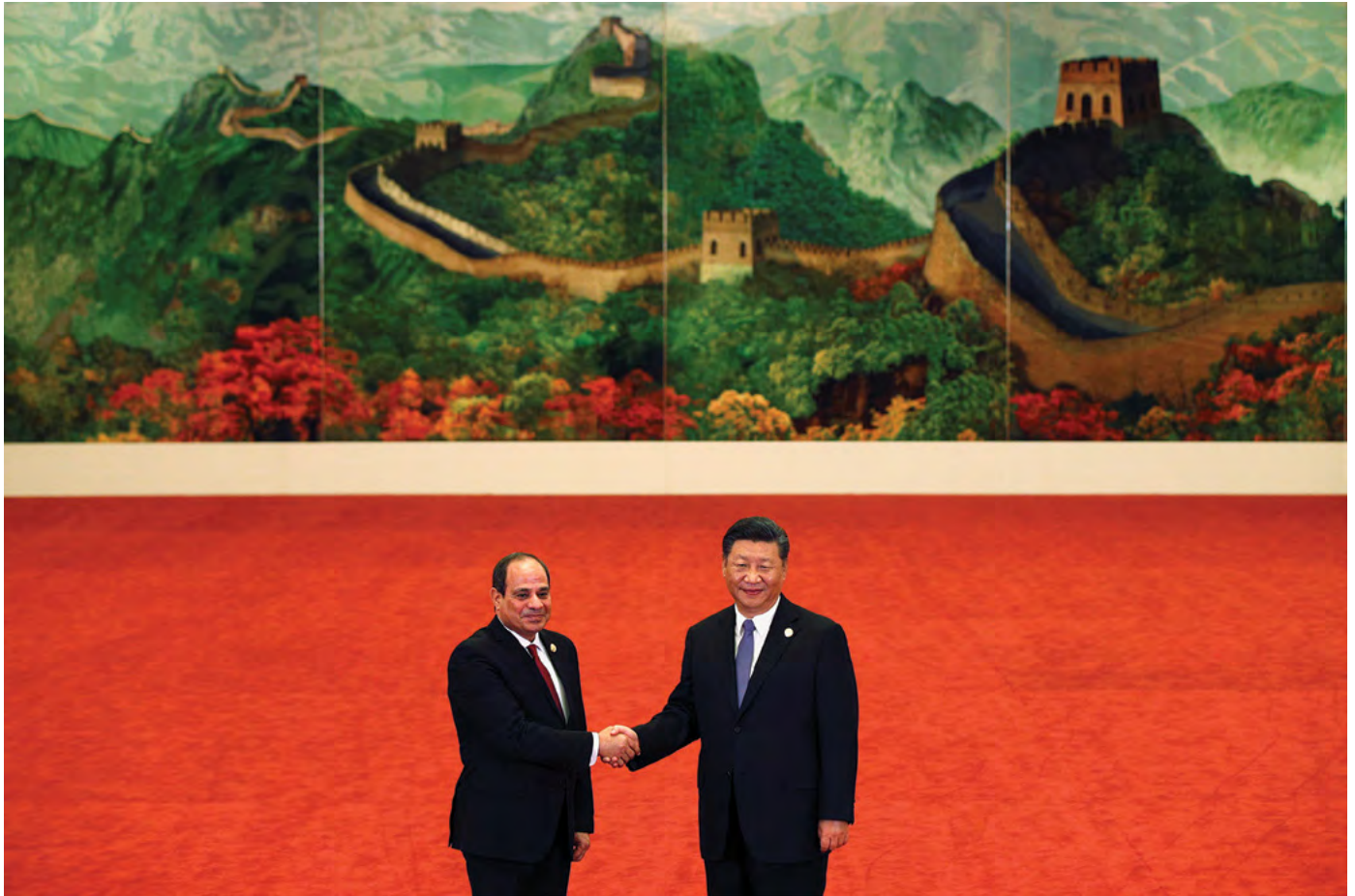
Egypt's President Abdel Fattah al-Sisi, left, shakes hands with Chinese President Xi Jinping during the Forum on China-Africa Cooperation held at the Great Hall of the People in Beijing, September 3, 2018.

CASCF was created as a multilateral platform for China and the states of the twenty-two-member Arab League to exchange views and promote cooperation in politics, trade, culture, technology, and international affairs. 24 A ministerial meeting is held every other year, attended by the foreign ministers of all CASCF member states. At these meetings, common goals for the next two years are established; during the 2016 ministerial meeting, BRI cooperation and the 1+2+3 cooperation pattern were the focus. 25