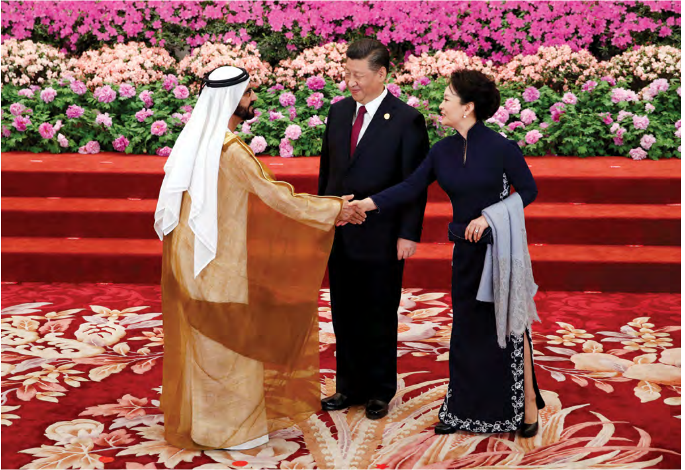
Chinese President Xi Jinping attends the opening ceremony for the second Belt and Road Forum in Beijing, China April 26, 2019.

This indicates that China and the United States actually share similar interests in the Middle East. Israeli scholar Yitzhak Shichor has noticed a “relatively high convergence” of US and Chinese “attitudes, policies, and behavior on a variety of Middle East issues.” 60 He also emphasizes that Beijing does not have anywhere near the same level of political influence as Washington in capital cities throughout the region. This is mostly because of the tremendous gap between China’s economic footprint and its comparatively small contributions to public goods in the region. There is a perception that until China is more deeply engaged on security issues, it will not be considered a top-tier player. BRI projects may provide a solid first step toward changing this perception, as might China’s public