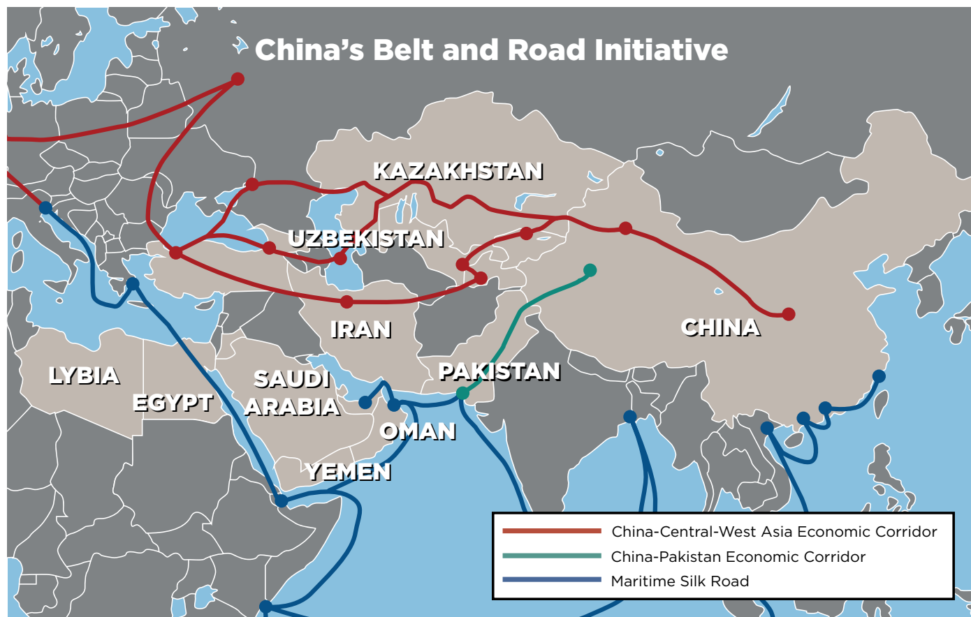
Map of China's Belt and Road Initiative. Sources: International Road Transport Union, Brookings, Council on Foreign Relations

accounting for 8 percent of China's global contracts during that period. 46