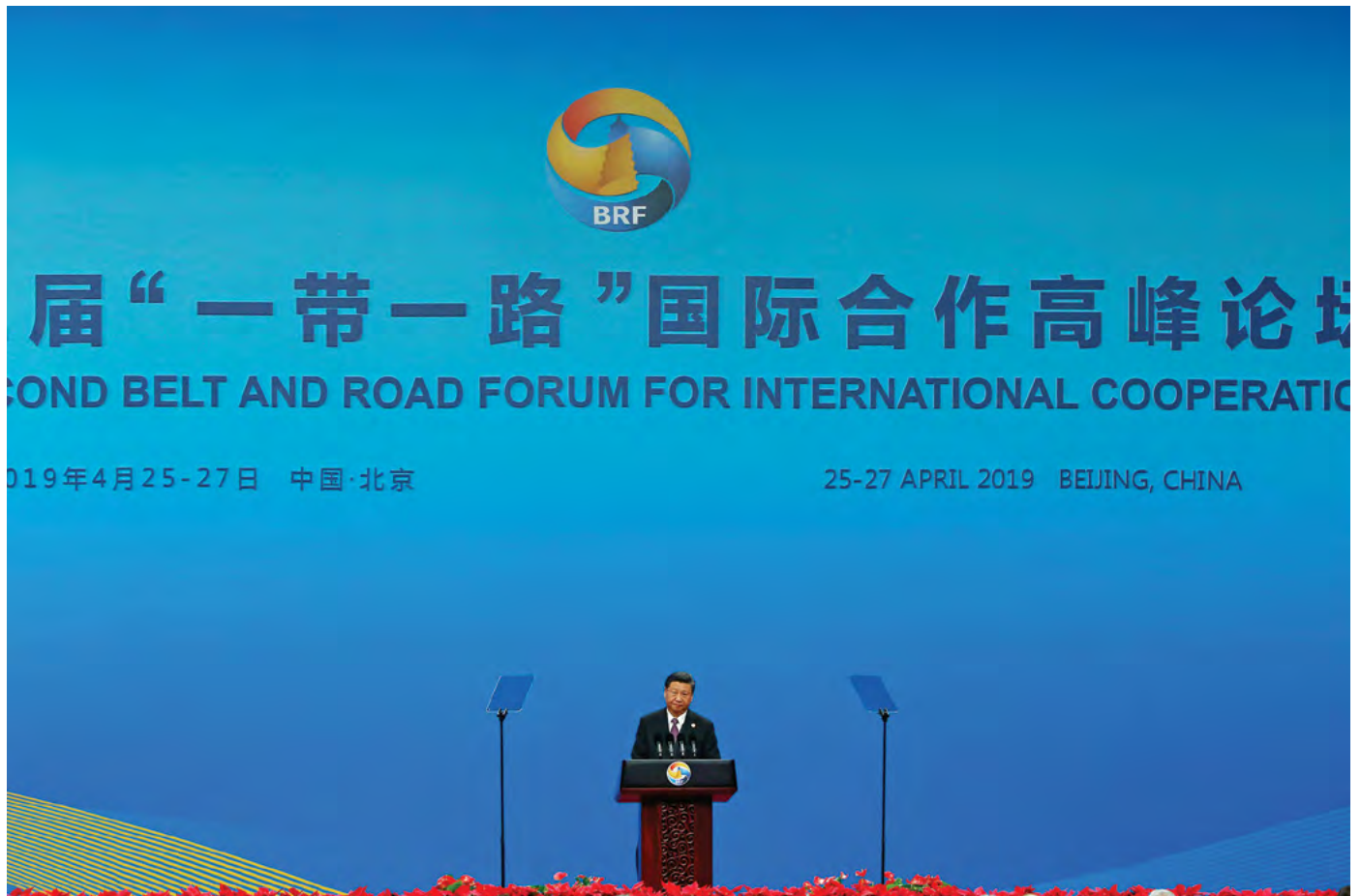
Chinese President Xi Jinping attends the opening ceremony for the second Belt and Road Forum in Beijing, China April 26, 2019.

taking office in 2014, and Chinese FDI into Egypt has spiked in the same period, drawing more than $15 billion. 49 This can partly be explained as a diversification policy by Egypt, as the United States and Europe grew more overtly critical of Cairo after al-Sisi's coup was followed by a crackdown on protests. In comparison, China's commitment to non-interference in the domestic politics of other countries presents an attractive alternative. An Egyptian official described the perception of China: "There are economic powers who have the ability to help us but not the desire, and others who have the desire but not the ability. China tops the list of those who have both the ability and the desire." 50 China's port projects in Egypt, part of the "industrial park-port interconnectivity" initiative described above, are substantial, but only part of Chinese FDI into Egypt.