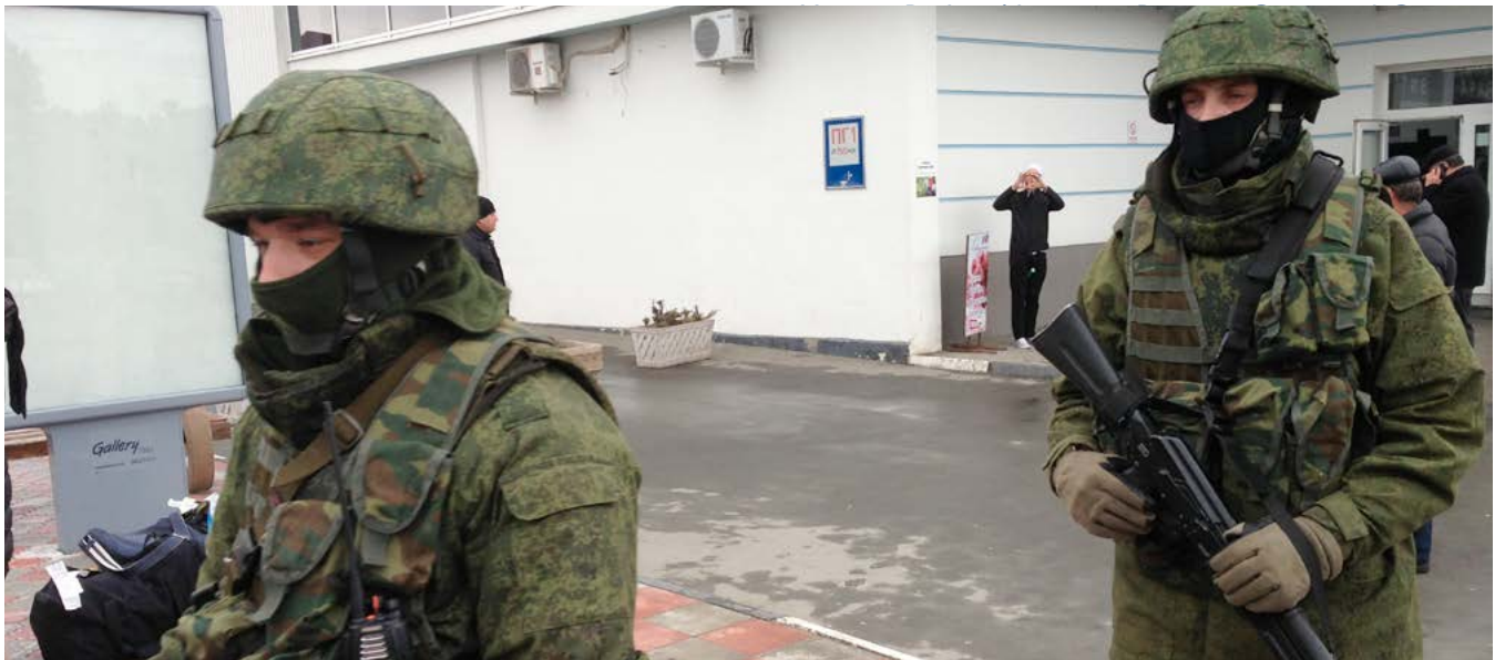
Pro-Russia forces patrol Simferopol International Airport on February 28, 2014.

figure was above 80 percent. Only 18.6 percent of respondents said they did not think of Ukraine as their homeland, while 10 percent said they could not answer the question.