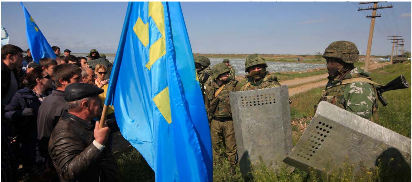
Russian servicemen attempt to block the way for Crimean Tatars crossing a checkpoint connecting Crimea and the Kherson region in May 2014.

swastika was painted on the windows of a school whose headmaster is a Crimean Tatar. 38