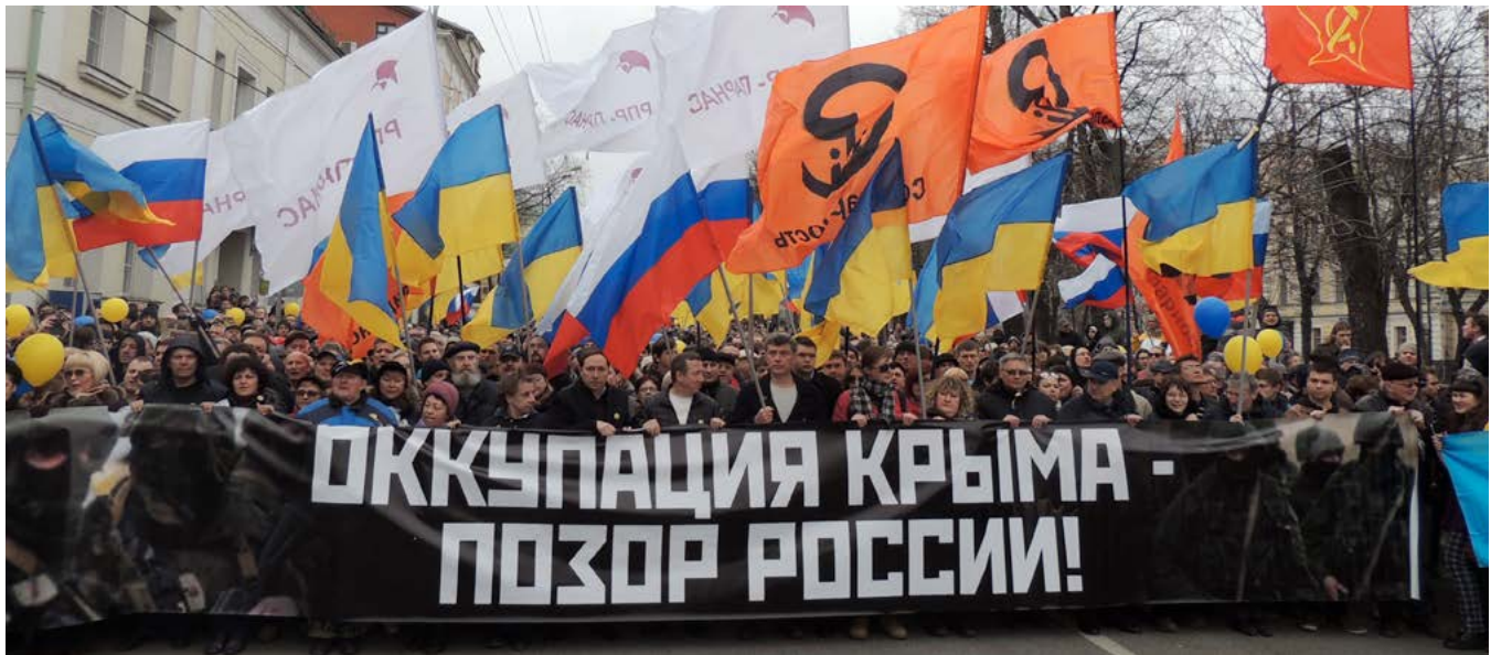
Protesters in Moscow carry a banner reading "Occupation of Crimea Is the Shame of Russia" during a peace march in March 2014.

police department and the Department for Combating Extremism.