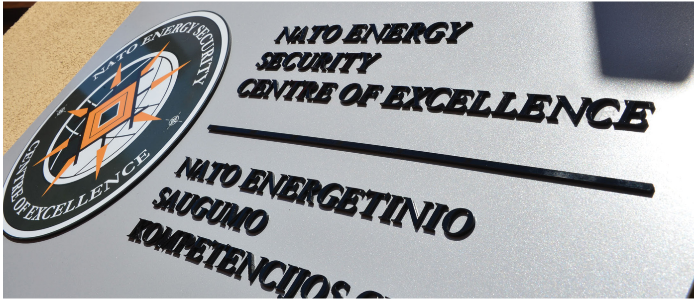
The NATO Energy Security Centre of Excellence in Vilnius.

threatening their energy access. 99 Crippling a country's access to energy could have devastating effects on the ability of a nation to function, potentially halting everyday activity and disrupting access to food and key resources. Russia may use energy manipulation as a tool of statecraft to coerce a country to bend to its will. This must be taken as seriously as other forms of political warfare.