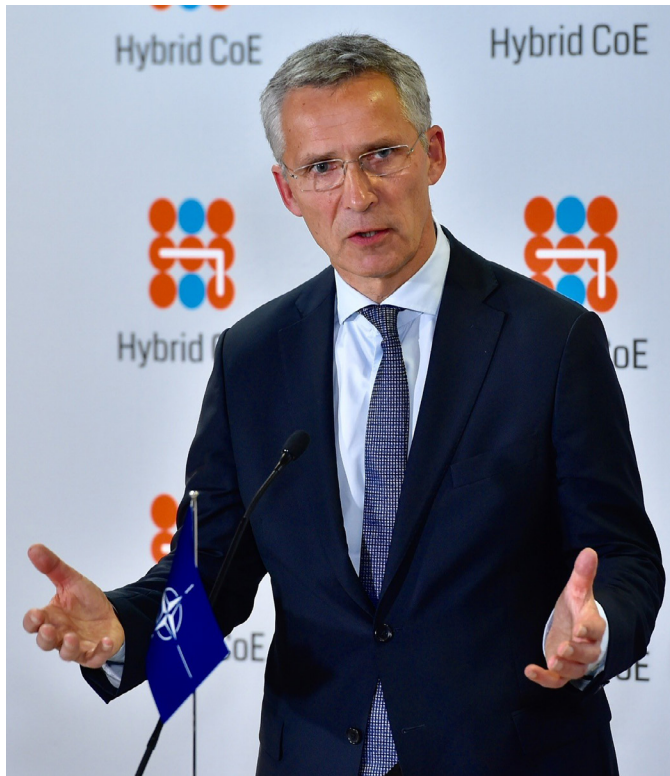
Press point by NATO Secretary General Jens Stoltenberg on occasion of the inauguration of the European Centre of Excellence (CoE) for Countering Hybrid Threats.

whole-of-government challenge. The United States' Open Source Enterprise in the Office of the Director of National Intelligence (ODNI) 40 works to collect, analyze, and distribute data gleaned from traditional and social media to create actionable intelligence that can be applied throughout the US Intelligence Community. This approach is evolving into a unique form of analytic tradecraft that can provide real-time information for policy makers. 41 In addition, the FY20 National Defense Authorization Act authorized the creation of a Social Media Data and Threat Analysis Center (DTAC) funded by the ODNI. While not yet stood up, the center is intended to encourage public-private cooperation