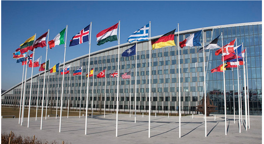
Exterior view of the new NATO headquarters.

and nongovernmental actors from the private sector and civil society. To facilitate cross-headquarters information sharing, NATO committees and divisions—across issues like political affairs, intelligence, defense policy and planning, security, civil emergency, partnerships, operations, and elsewhere—could be asked to appoint representatives to participate in convenings to share information and strategies, as well as feed relevant counter-political warfare insights back into their own committees and divisions.