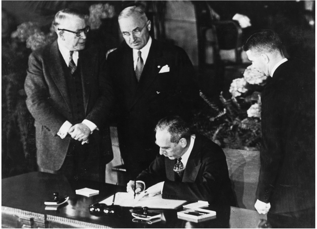
Mr. Dean Acheson (Minister of Foreign Affairs) signs the NATO Treaty for the United States.

their international economic policies and will encourage economic collaboration between any or all of them.