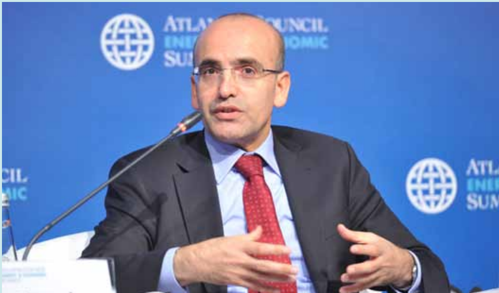
Mehmet Şimşek, Minister of Finance, Republic of Turkey