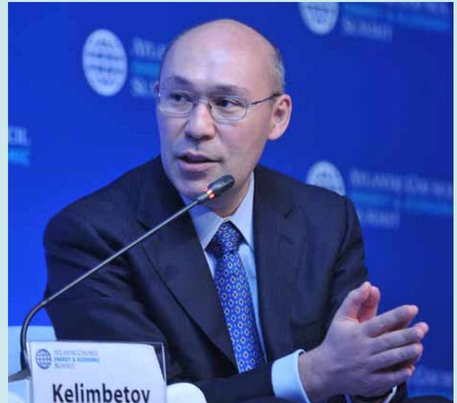
Kairat Kelimbetov, Deputy Prime Minister, Republic of Kazakhstan