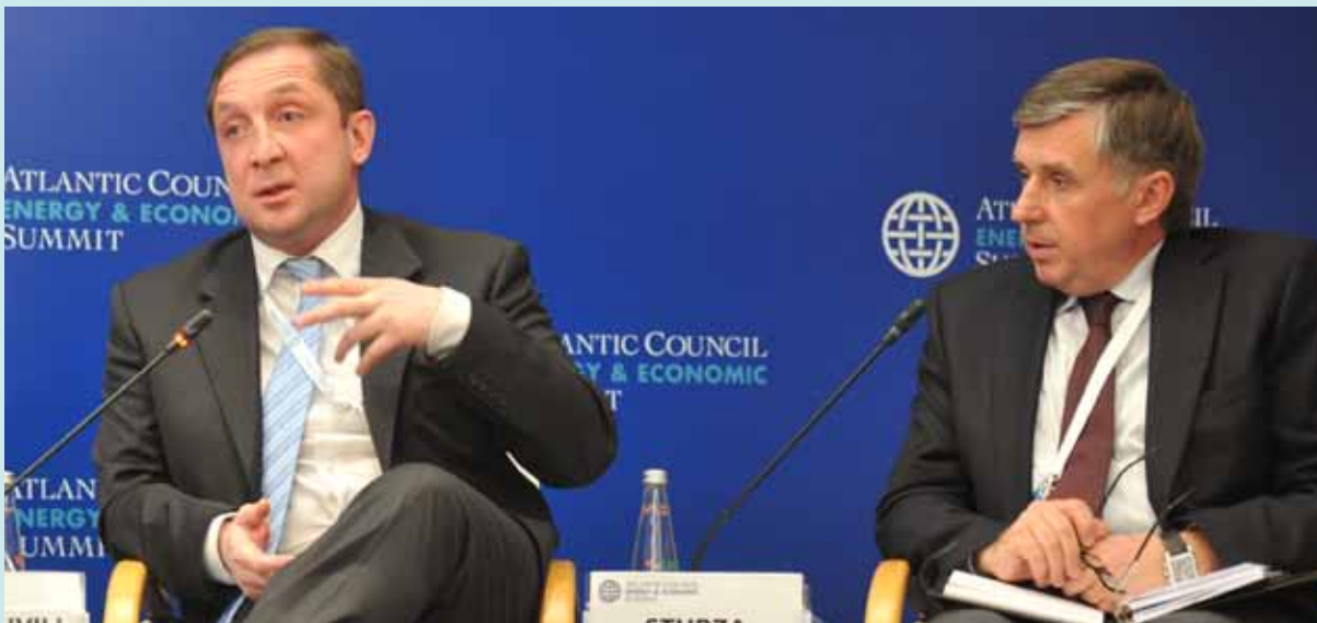
Alexi Petriashvili, State Minister for European and Euro-Atlantic Integration, Republic of Georgia and Ion Sturza, President, Greenlight Investment, and former Prime Minister of the Republic of Moldova