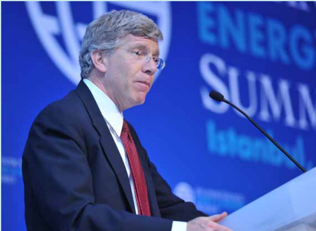
Daniel Poneman, Deputy Secretary, US Department of Energy