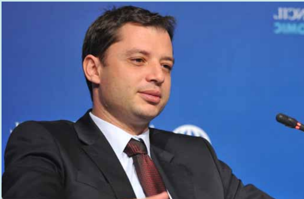
Delyan Dobrev, Minister of Economy and Energy, Republic of Bulgaria