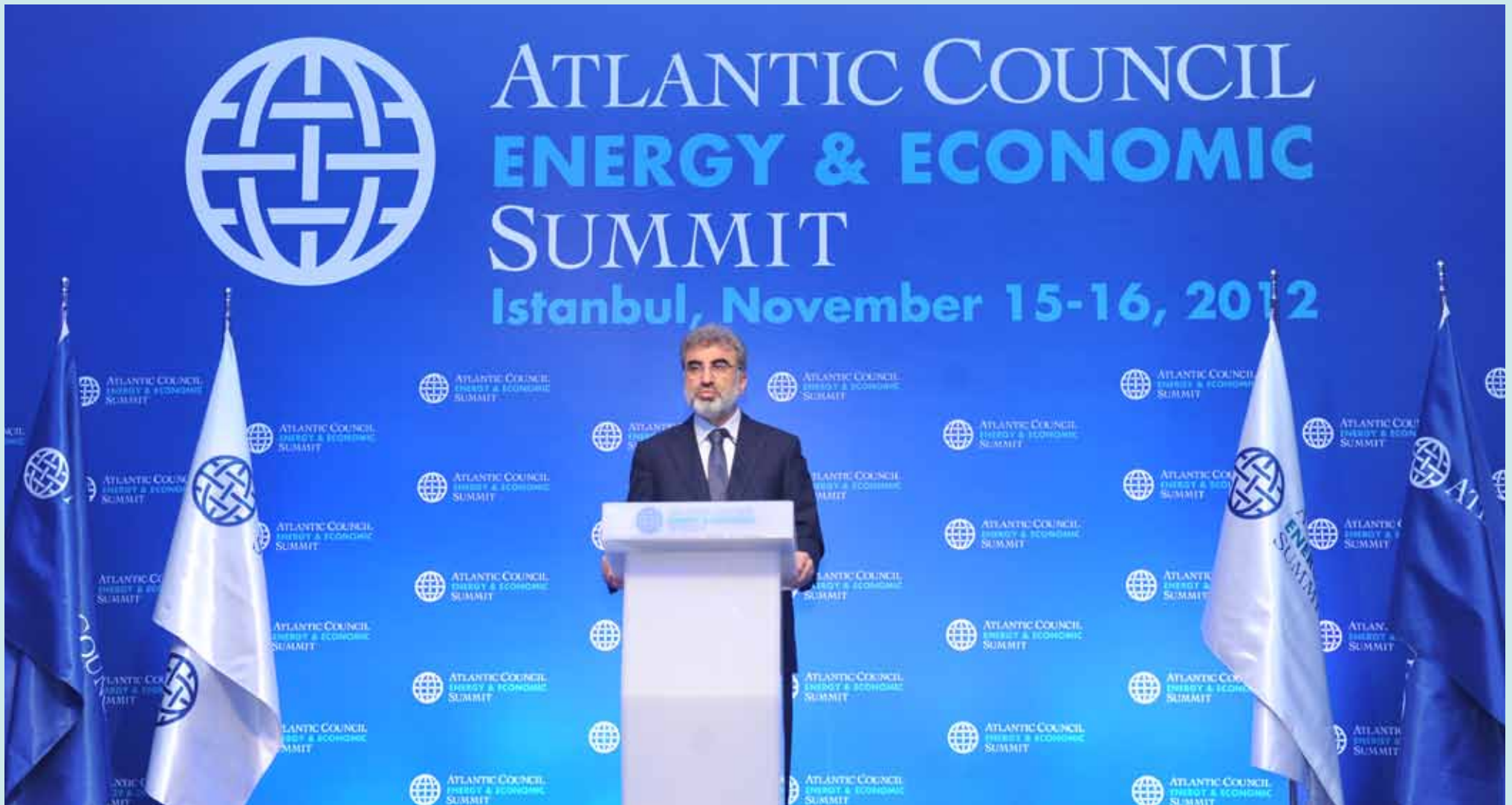
Taner Yıldız, Minister of Energy and Natural Resources, Republic of Turkey