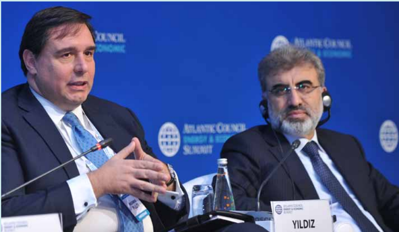
Riccardo Puliti, Managing Director, Energy and Natural Resources, European Bank for Reconstruction and Development; and Taner Yıldız, Minister of Energy and Natural Resources, Republic of Turkey