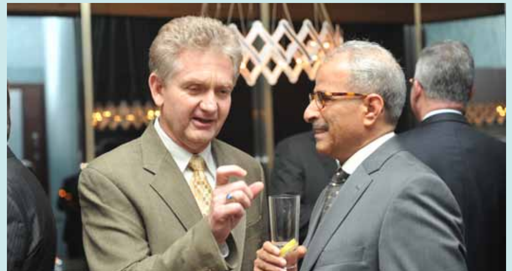
Bud Fackrell, President, BP Turkey and Mohammed Bin Dhaen Al Hamli, Minister of Energy, United Arab Emirates