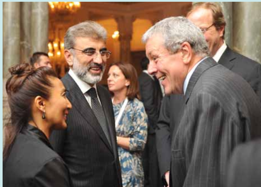
Taner Yıldız, Minister of Energy and Natural Resources, Republic of Turkey and John S. Tanner, Vice President, Prime Policy Group and former US Congressman (D-TN)