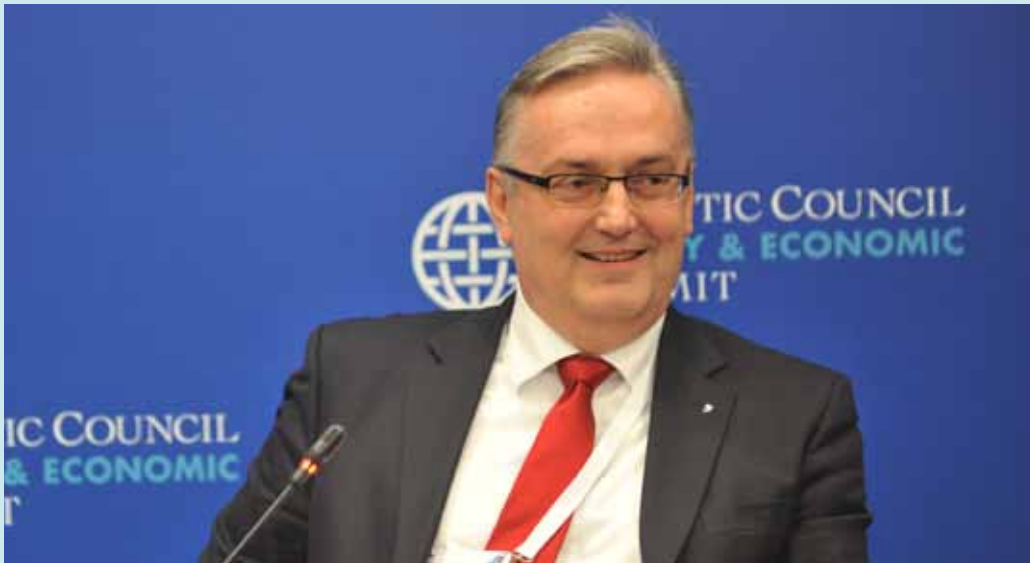
Zlatko Lagumdžija, Deputy Chairman of the Council of Ministers and Minister of Foreign Affairs, Bosnia and Herzegovina