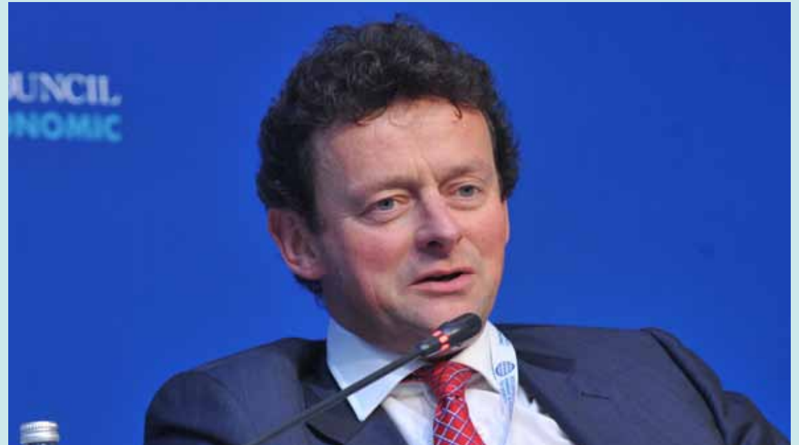
Tony Hayward, CEO, Genel Energy