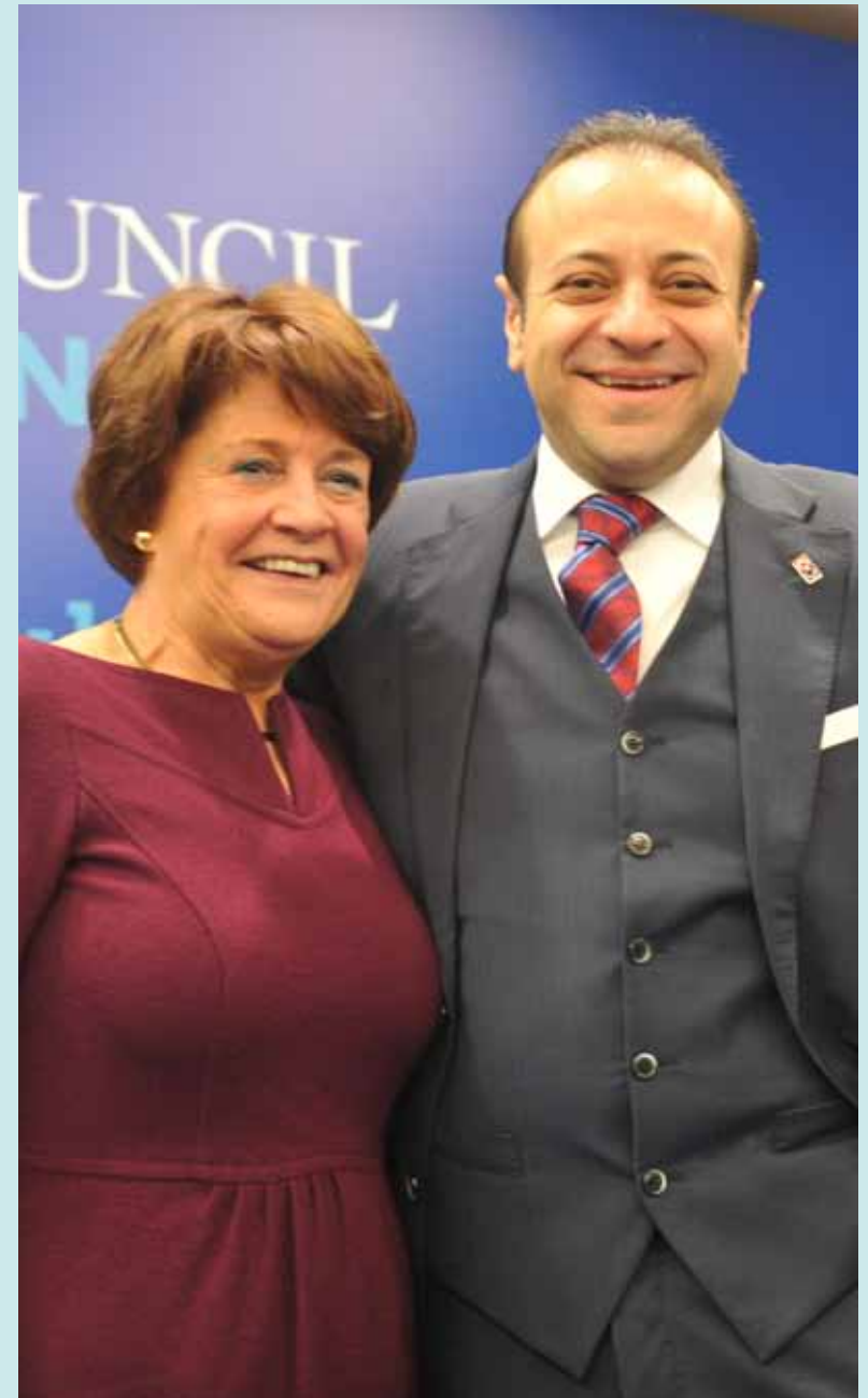
Ria Oomen-Ruijten, MP, European Parliament and Egemen Bağış, Minister for European Union Affairs and Chief Negotiator, Republic of Turkey