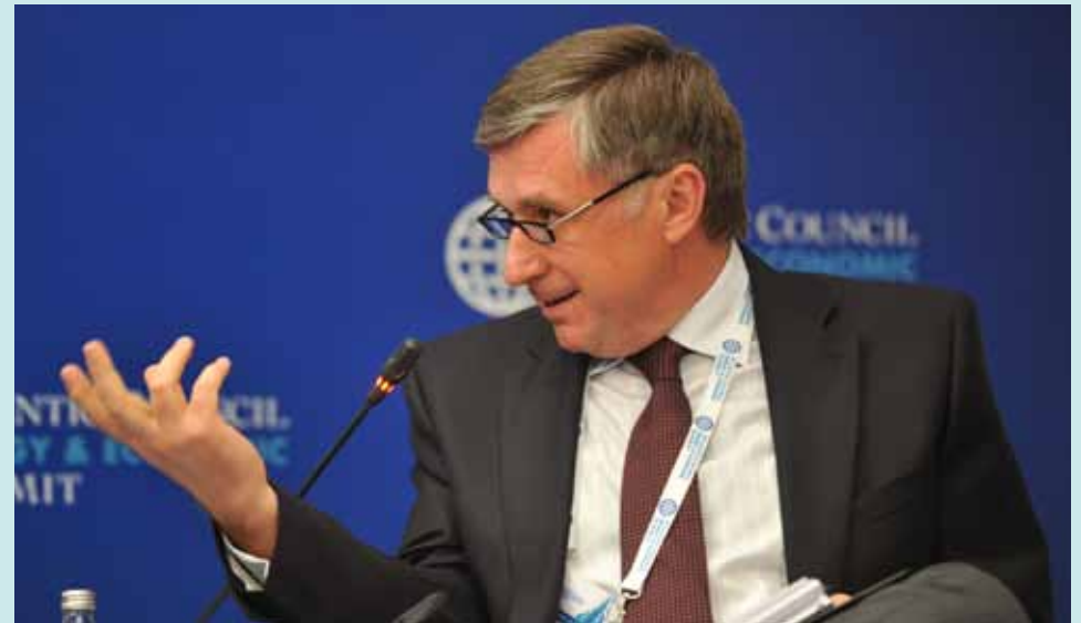
Ion Sturza, President, Greenlight Investment, and former Prime Minister, Republic of Moldova