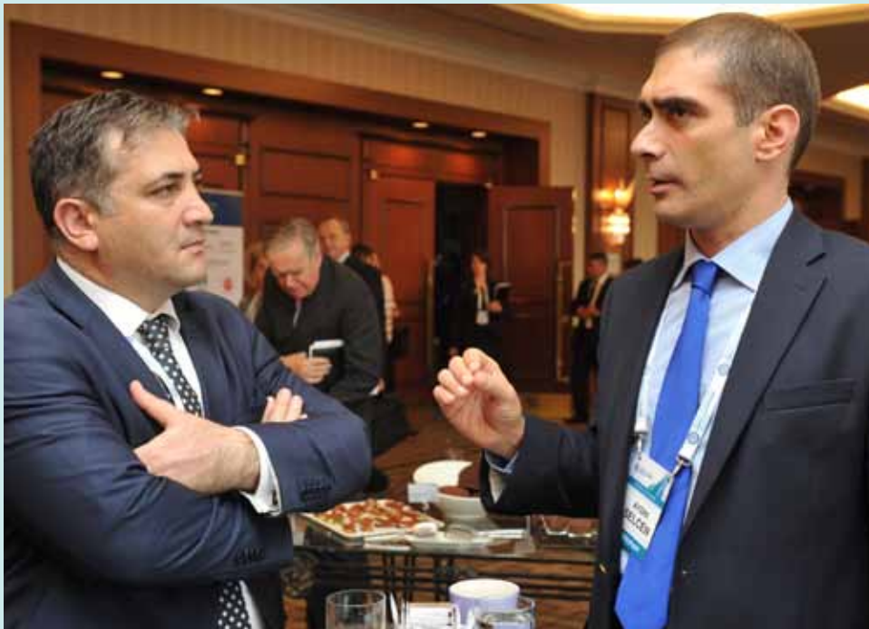
A guest and Aydin Selcan, Consul General of Turkey in Erbil