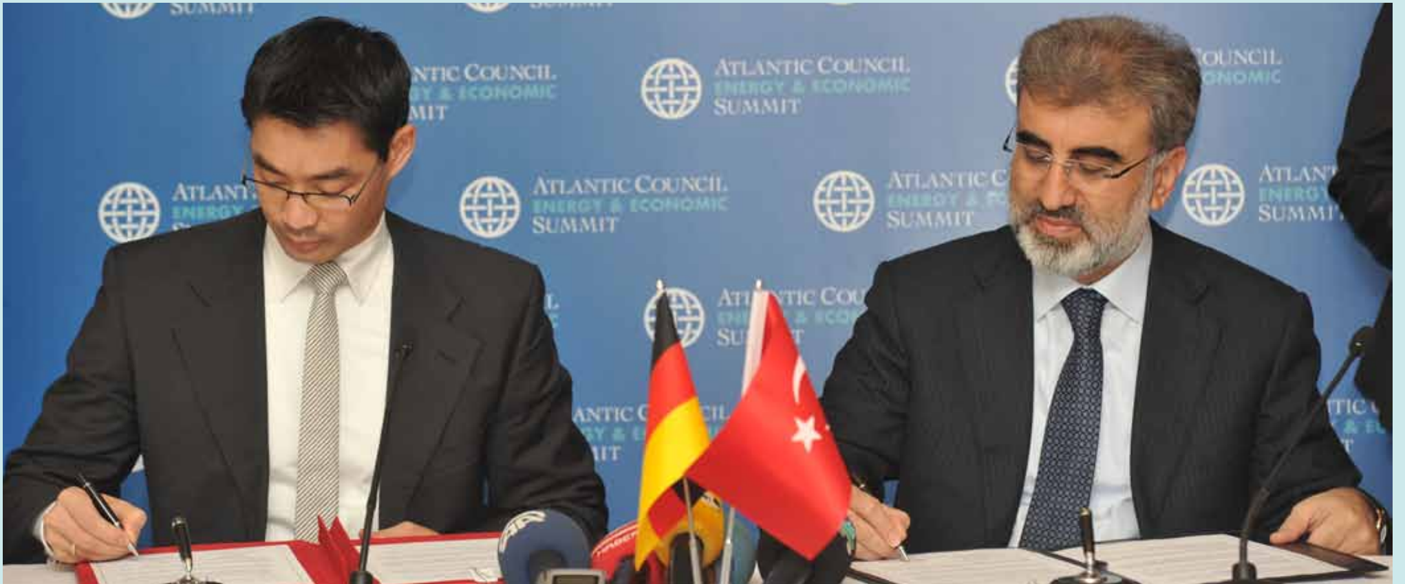
Philipp Rösler, Vice Chancellor and Federal Minister of Economics and Technology, Federal Republic of Germany and Taner Yıldız, Minister of Energy and Natural Resources, Republic of Turkey