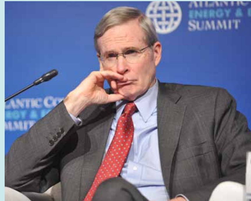
Stephen J. Hadley, Principal, RiceHadleyGates and former US National Security Advisor