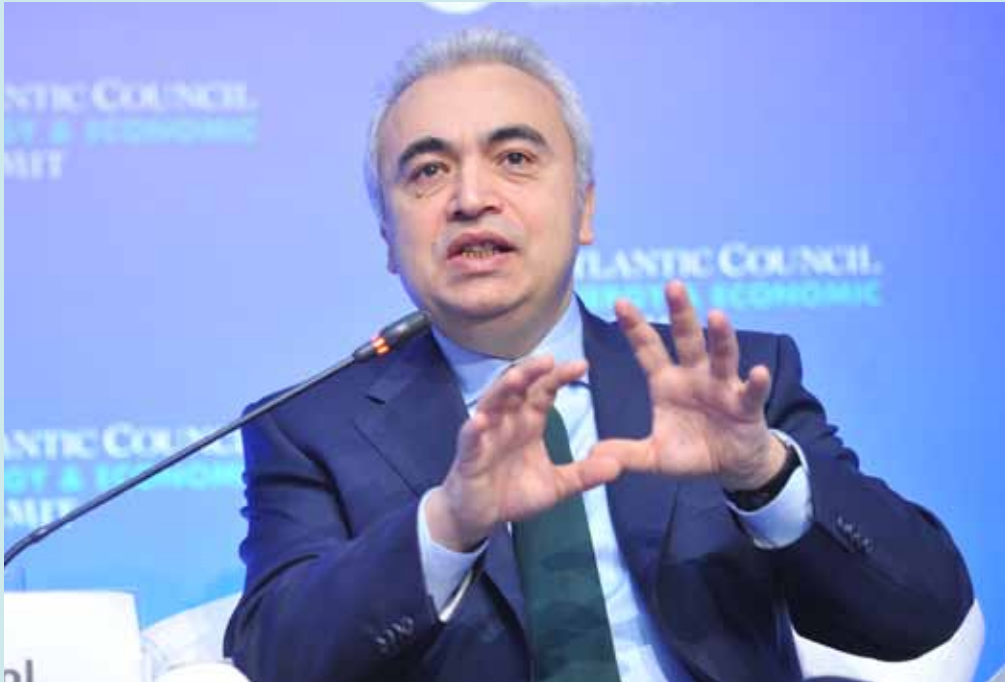
Fatih Birol, Chief Economist, International Energy Agency