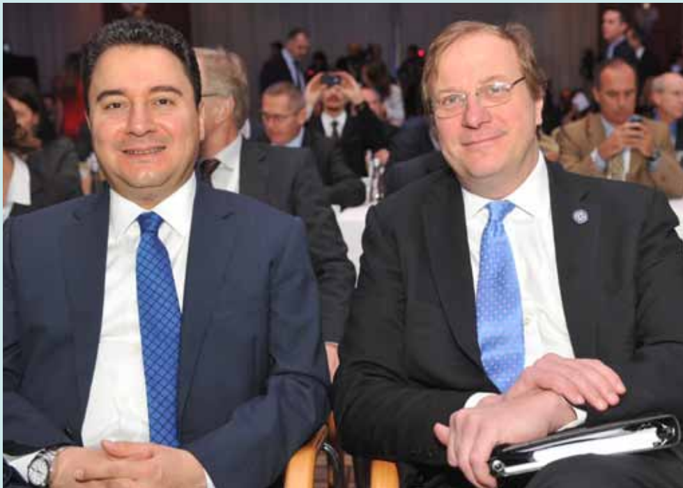
Ali Babacan, Deputy Prime Minister, Republic of Turkey and Frederick Kempe, President & CEO, Atlantic Council