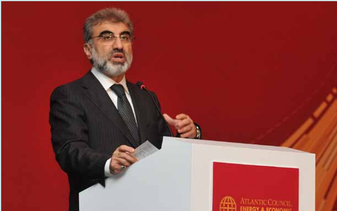
Taner Yıldız, Minister of Energy and Natural Resources, Republic of Turkey