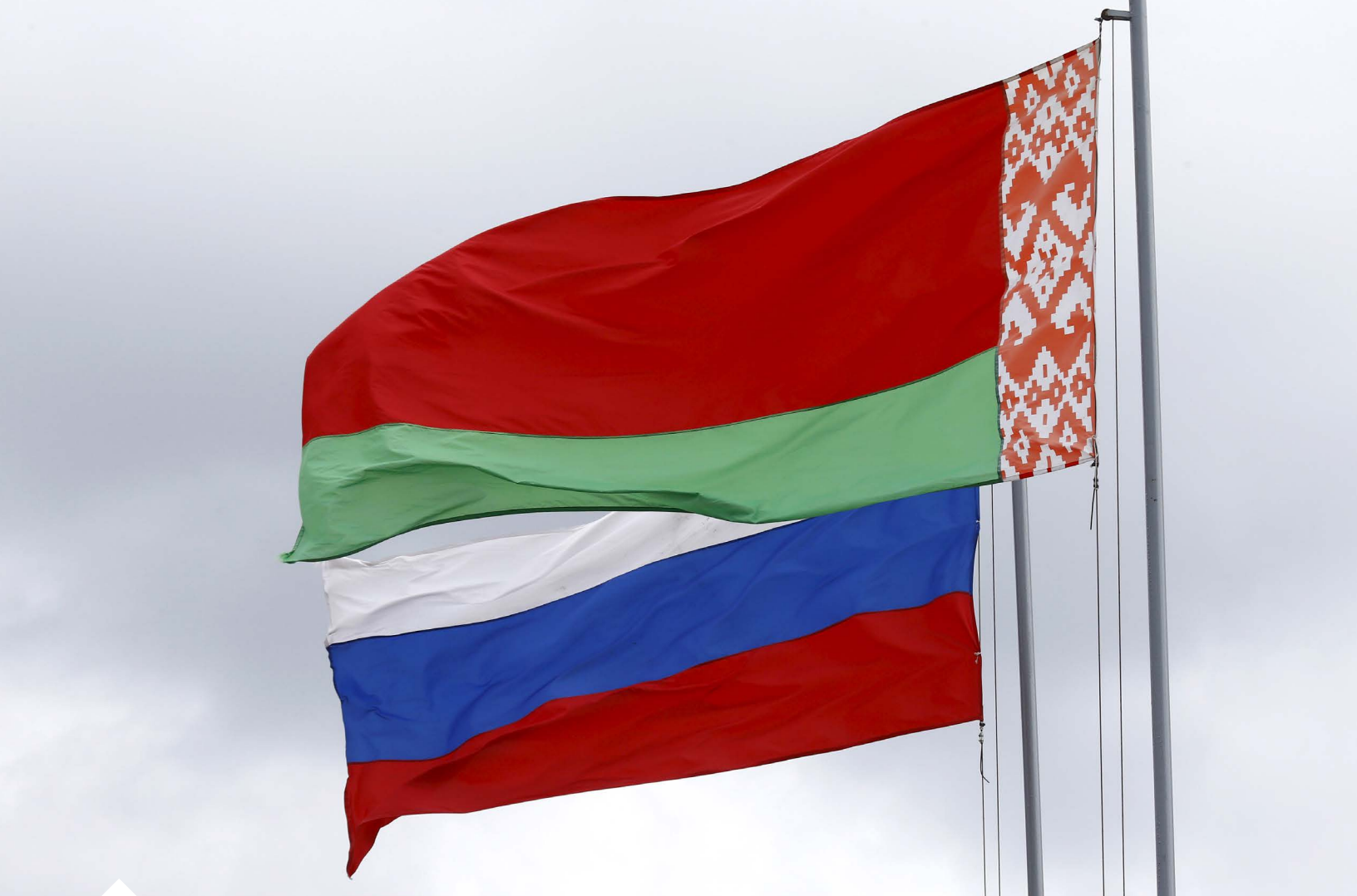
Belarusian and Russian national flags are seen at the construction site of the Ostrovets nuclear power plant.

Minsk dependent on Rosatom's subsidiaries for training, technology, and know-how. Even though the Directorate for Nuclear Power Plant Construction will be operating the Ostrovets NPP, Belarus has no experience operating nuclear power plants and will have to rely on Russian assistance. Moreover, under its contractual obligations, Belarus will be required to purchase some of the crucial components, such as nuclear fuel assemblies, for the Ostrovets NPP from Russia. 34 Hence, not only will Russia remain dominant in the Belarusian natural gas sector, as Minsk does not have any alternative suppliers, it will also reign in its nuclear energy sector.