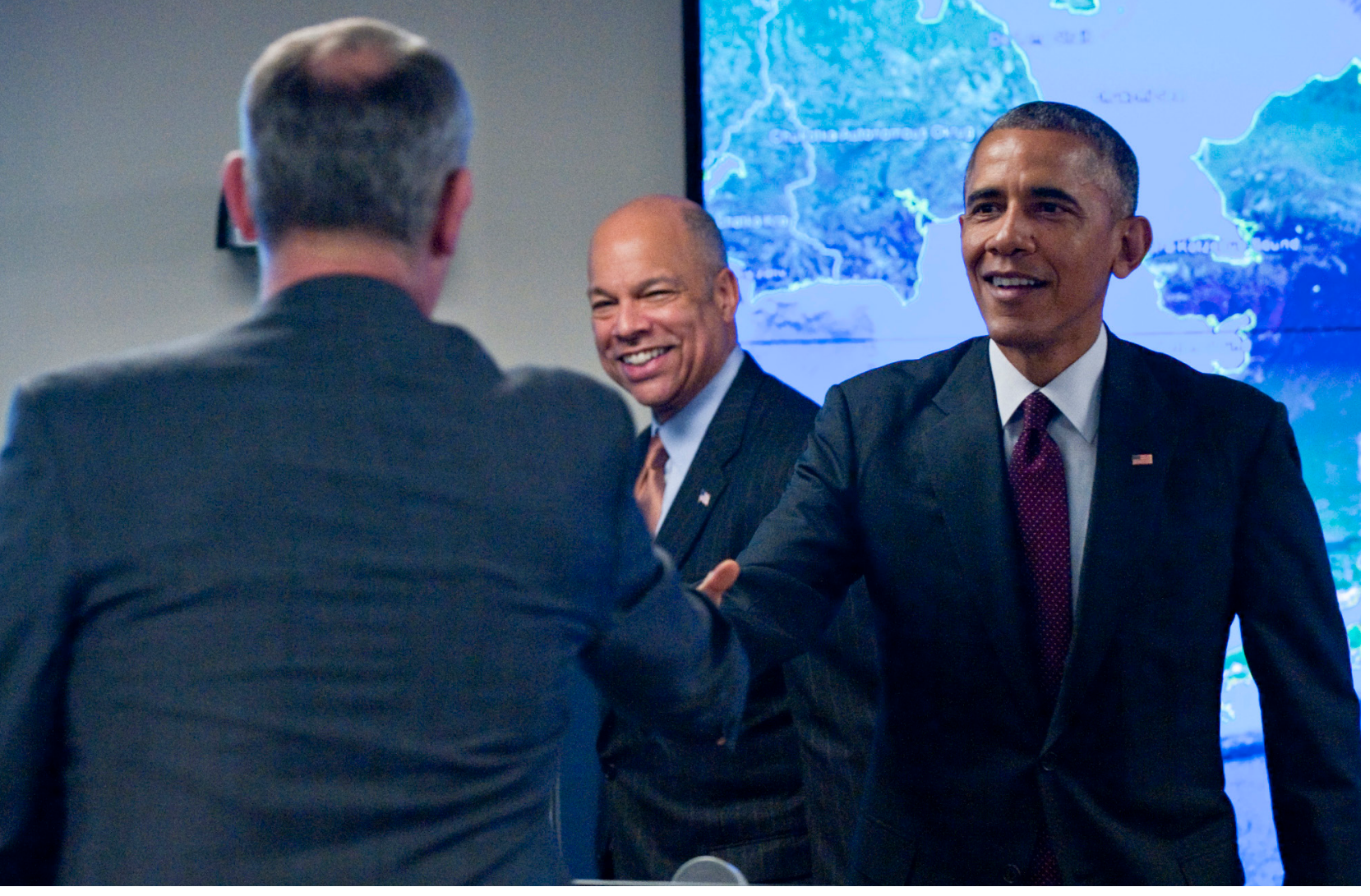
President Obama visits the National Cybersecurity and Communications Integration Center on January 13, 2015.

This coordination office should liaison and share information with the Office of the Director of National Intelligence (ODNI), the Department of Homeland Security (DHS), the GEC, and appropriate Congressional oversight committees.