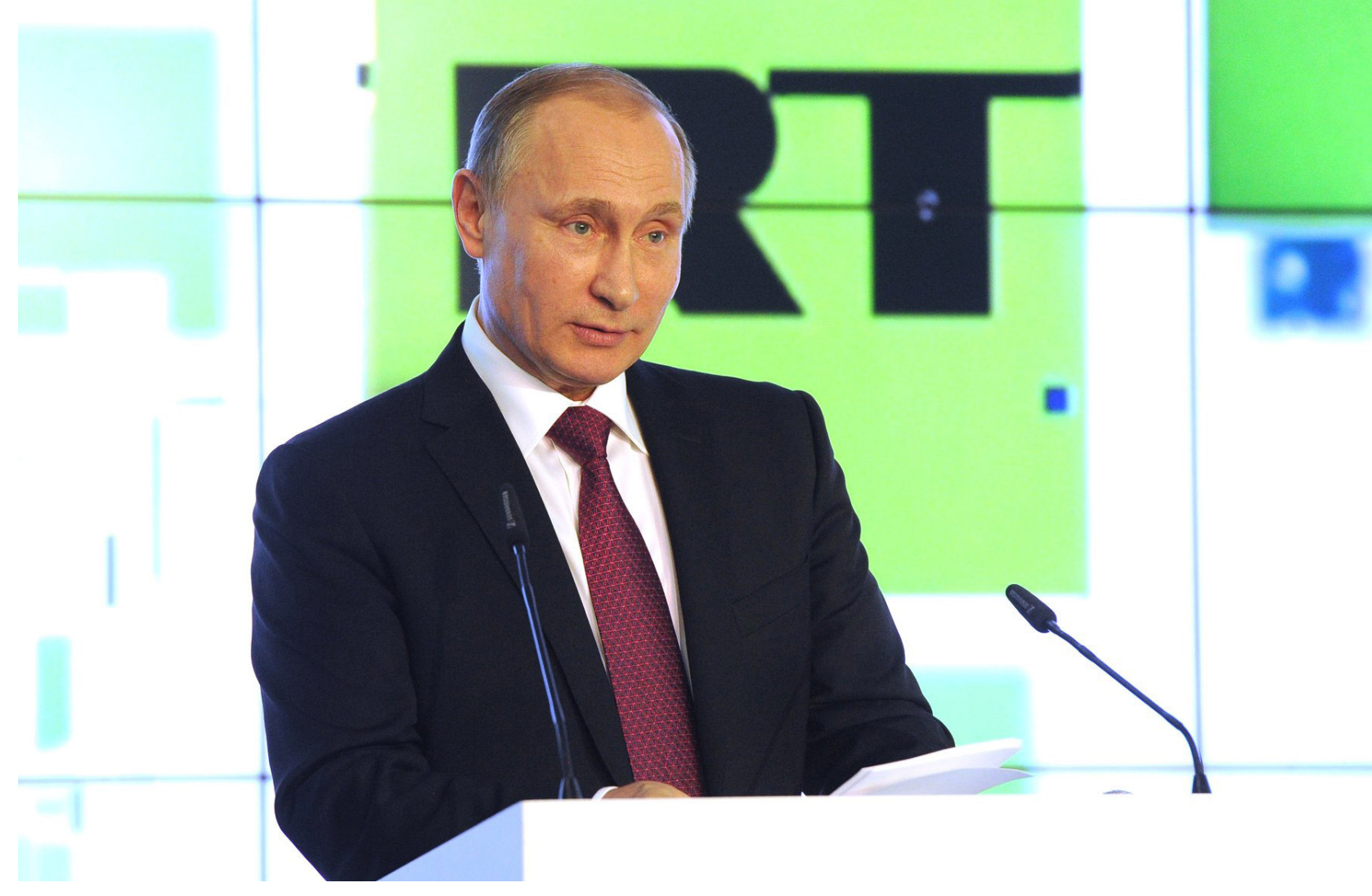
Russian government control of the media is essential to the Kremlin's disinformation campaign.

as the European Union (EU) and NATO, can apply these and other tools to fit their circumstances. In addition to specific suggestions, we recommend creation of a "Counter-Disinformation Coalition," an informal group of like-minded governments and nongovernmental stakeholders, to develop best practices for defending against disinformation—including standards for social media such as a voluntary code of conduct—and recommend responses to future challenges originating in non-democratic countries. While nongovernmental actors can and should develop coordination mechanisms and communication channels among themselves, governments must be part of the broader conversation. Public policy is a core element of an effective response.