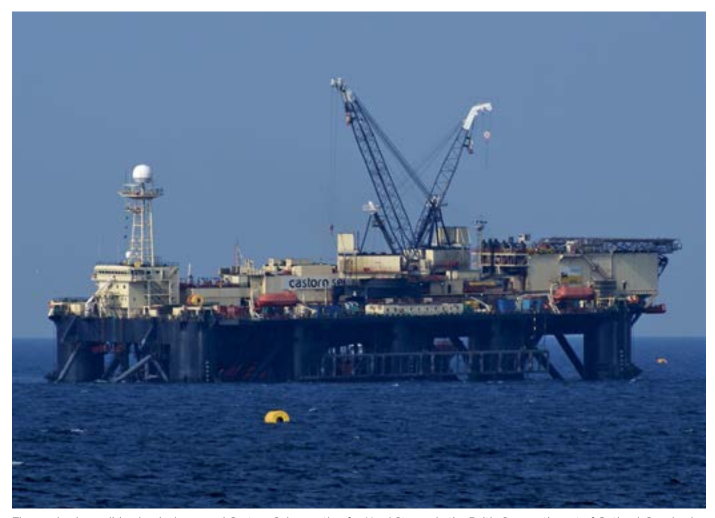
The semi-submersible pipe-laying vessel Castoro Sei operating for Nord Stream in the Baltic Sea south-east of Gotland, Sweden in late March 2011.

Russian interference enters the public domain throughout 2018, it becomes more likely that the United States and its allies will seek a greater range of sanctions on the Russian Federation. Nord Stream 2 is an obvious and immediate target.<sup>41</sup>