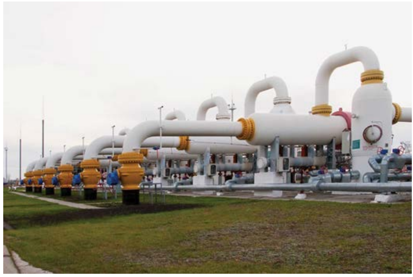
Ukrainian gas pipeline network. Ukraine has the largest pipeline network of any European state.

actually joined the European Union. Furthermore, both as newly liberated and later as new member states, the CEE states were still grappling with the Soviet legacy of a single east-to-west pipeline network, which gave Gazprom significant market power. These legacy issues make it much more difficult to put in place new sources of supply, pipelines, and interconnectors that will provide the CEE states with alternatives.<sup>35</sup>