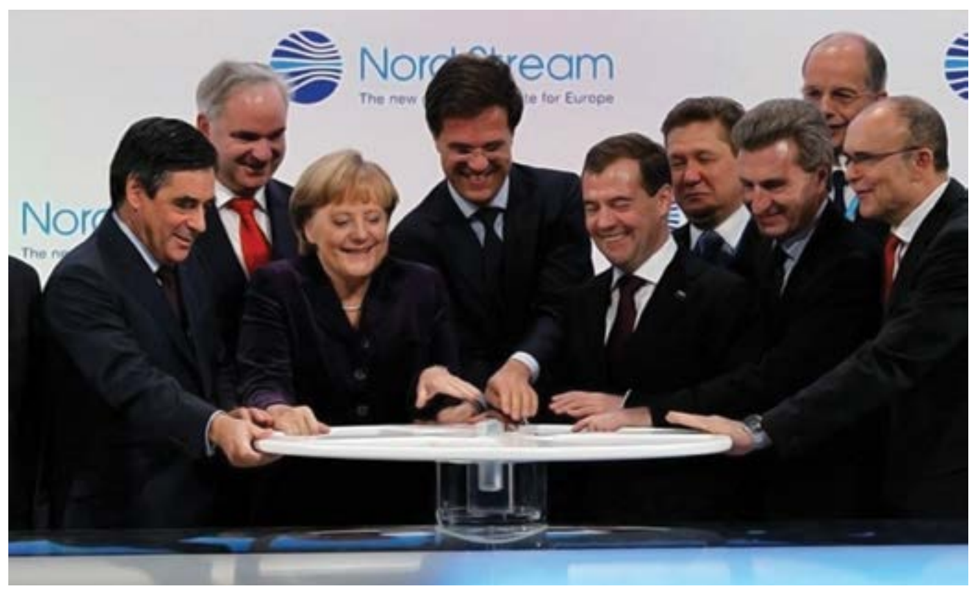
Nord Stream opening ceremony on 8 November 2011 with Angela Merkel, Dmitry Medvedev, Mark Rutte and François Fillon.

a theoretical problem. In 2014, CEE states started sending gas by reverse flow to Ukraine.<sup>7</sup> In response, Gazprom threatened to reduce gas flows to some CEE states in an attempt to stop reverse-flow gas from entering Ukraine—and then actually did so.<sup>8</sup>