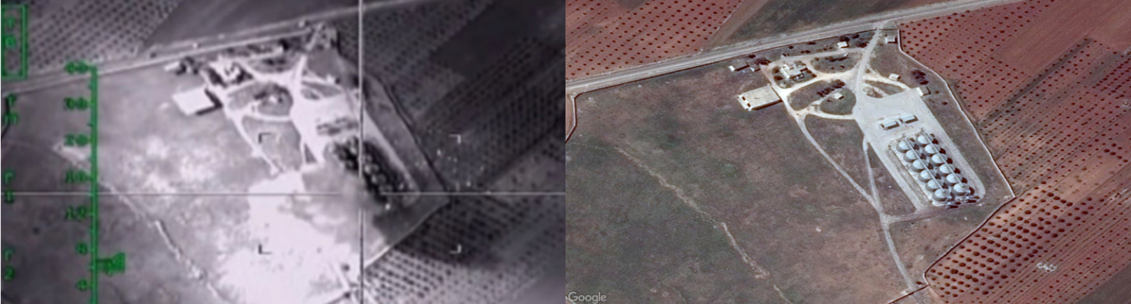
Satellite imagery from Google Earth reveals that the supposed oil storage facility in Al-Thawrah, Syria was actually a grain storage facility located 150 km from this city, at 35.597983, 36.8637443.

Hama, where there was no known ISIS presence. The Russian MoD then published a second video of the same site being bombed on October 3, 25 this time describing the location as an ISIS command post near Raqqa, which is, in fact, over 200 km away from the actual location of the air strike.