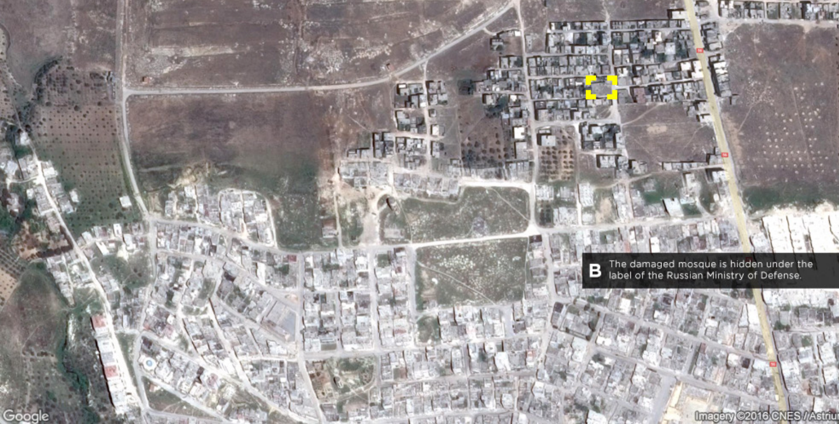
B The damaged mosque is hidden under the label of the Russian Ministry of Defense.

taken after the attack occurred, these structures are all clearly intact. This could only be the case if the aerial image was taken before the air strikes. 44 In addition to this report from Idlib, a March 3, 2016 report by Amnesty International would go on to present evidence that Syria and Russia were deliberately targeting hospitals elsewhere in Syria.