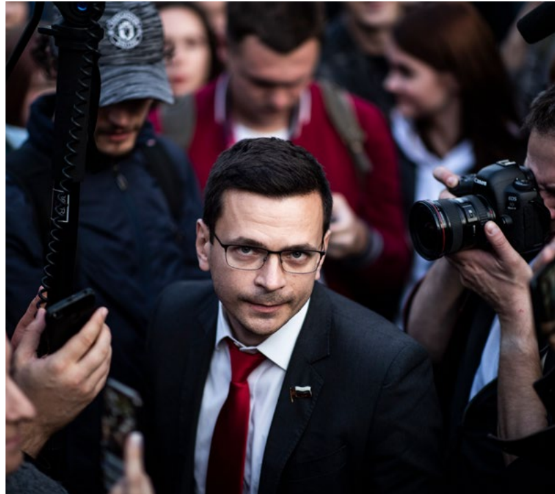
Russian opposition leader Ilya Yashin is one of the candidates prevented by authorities from registering for city elections in Moscow in 2019. Yashin served multiple consecutive ten-day jail terms in August and September, 2019, for organizing unsanctioned protests.

The paradox is that Stalin's new propaganda cult, originally intended as a pillar of Putin's rule and to maintain his image as the new Stalin, is turning increasingly against the Russian president. And the less people tend to trust Putin, the more they seem to like Stalin. Introduced into the media space to bolster the