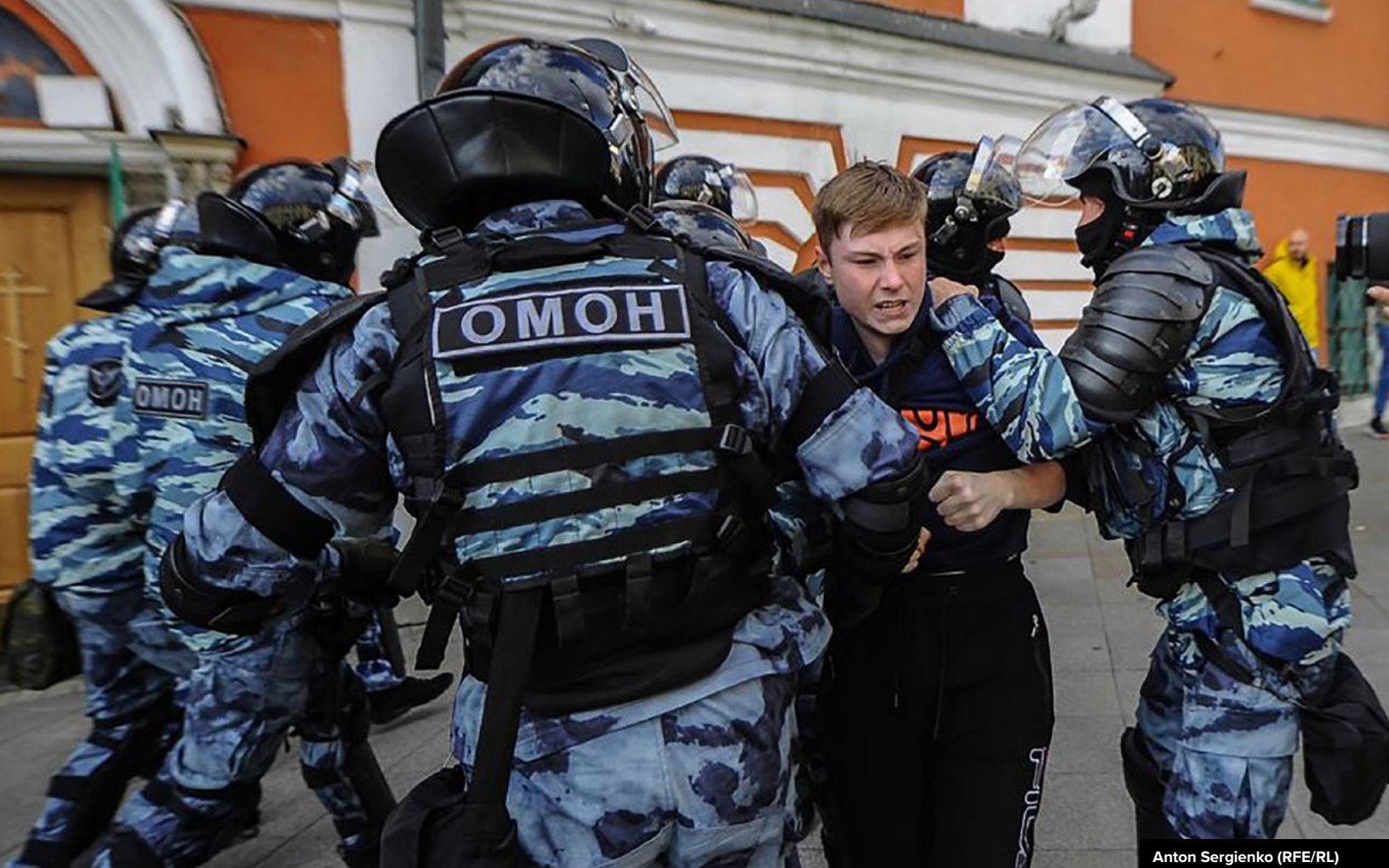
Anton Sergienko (RFE/RL)

Following the barring of opposition candidates in Moscow city elections, protests on the streets of Moscow continued throughout August 2019, with over 2,000 protestors detained. Photo credit: Anton Sergienko (RFE/RL)