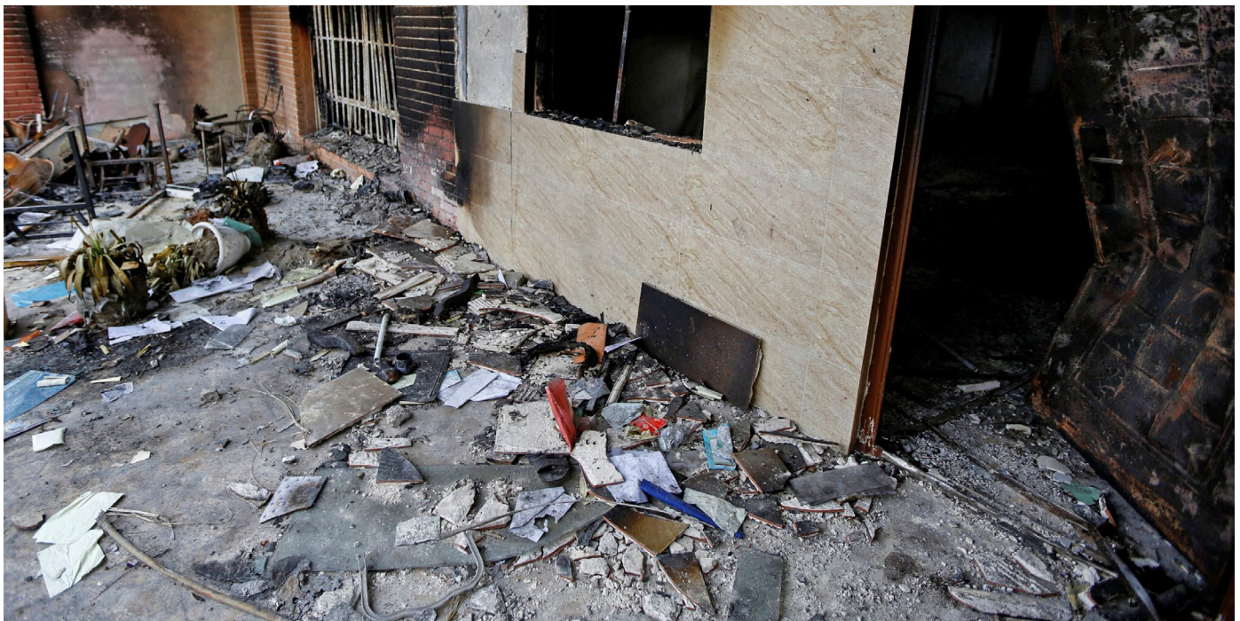
A view of the interior of the Iranian consulate after Iraqi demonstrators stormed and set fire to the building during ongoing anti-government protests in Najaf, Iraq December 3, 2019. Picture taken December 3, 2019.

Given Baghdad's apparent ambivalence about forcing a complete US withdrawal, ideally the two governments could reach an agreement where US forces depart non-Kurdish areas but are provided an exception that allows them to stay in Kurdistan, largely out of sight of the majority of Iraqis. If such an agreement is not possible, then the United State should seek to prevent language in relevant Iraqi declarations that would prohibit US forces from remaining in Kurdistan in order to postpone resolution of any legal issues and provide some room to maneuver should US forces again be necessary to combat ISIS. Absent an agreement or such room to maneuver, the United States would be forced to confront significant issues under international law should it unilaterally decide to remain. Such confrontation would call into question the US commitment to the international order as well as weaken its justification for continued operations in Syria. 59