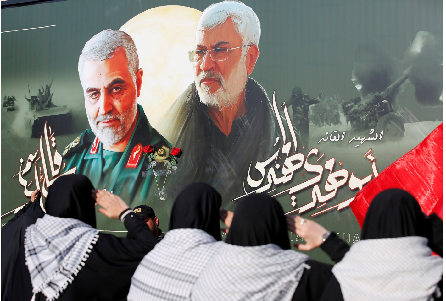
Iraqi women gather at the scene where Iran's Quds Force top commander Qassem Soleimani and Iraqi militia commander Abu Mahdi al-Muhandis were killed in a U.S. airstrike at Baghdad airport, Iraq February 13, 2020.

European oil companies play a significant role in Iraq's oil extraction, while Iranian companies play none. Underscoring this importance, when Exxon-Mobil departed the southern oil fields in response to threats from Iran-backed militias, the Basra Provincial Council called on the Iraqi government to sue if they did not return. 30 The United States also can assist Iraq with integrating into the international community and developing the economic and financial capabilities necessary to participate in the global economy in ways a politically and economically isolated Iran never could. 31