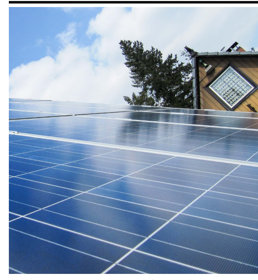
RESIDENTIAL SOLAR PANELS IN GERMANY.

he IEA anticipates robust deployment of solar and wind energy in Europe as increased technological innovation further reduces renewables costs. Ramped-up renewables and electrification will