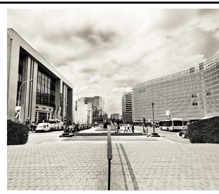
EUROPEAN COMMISSION, BRUSSELS.

These security threats cannot be resolved unilaterally, since their nature and scope necessitate a transatlantic approach. The US-EU Energy Council, which was formed in 2009 as a forum for transatlantic energy cooperation, will be the most effective platform for coordinating key transatlantic energy security initiatives with stakeholders in the government and the private sector. However, in order to maximize the Council's effectiveness, its Energy Technology, Energy Policy, and Energy Security working groups should be reinvigorated.<sup>2</sup> The United States, the EU, third countries, and the private sector should initiate dialogues, as necessary, to facilitate work on the proposed recommendations. The United States and the EU, and several of the member states, are already demonstrating strong cooperation through P-TEC and the Three Seas Initiative, which aim to improve energy infrastructure throughout Central and Eastern Europe.