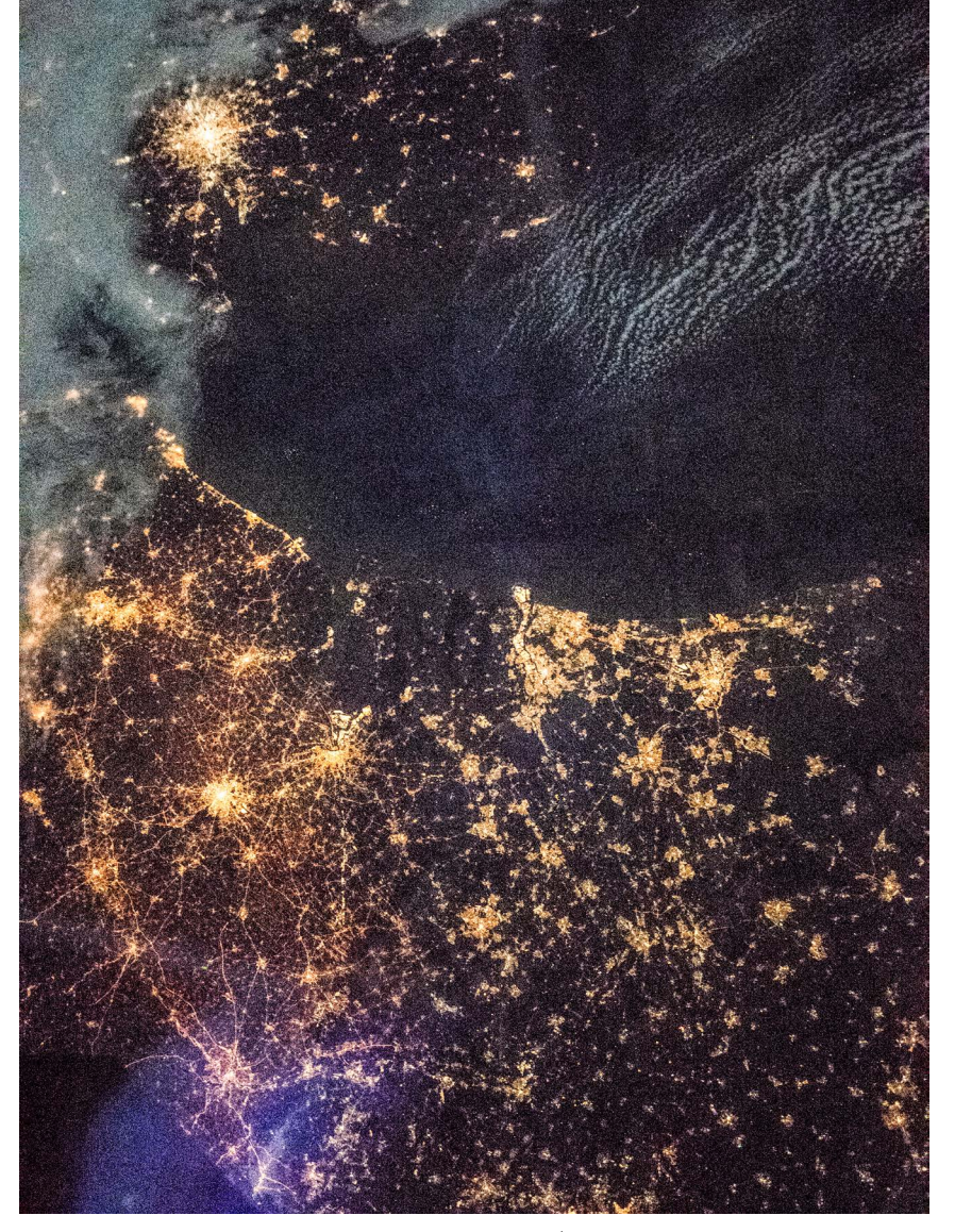
AERIAL VIEW OF NORTHERN EUROPEAN LIGHTS.