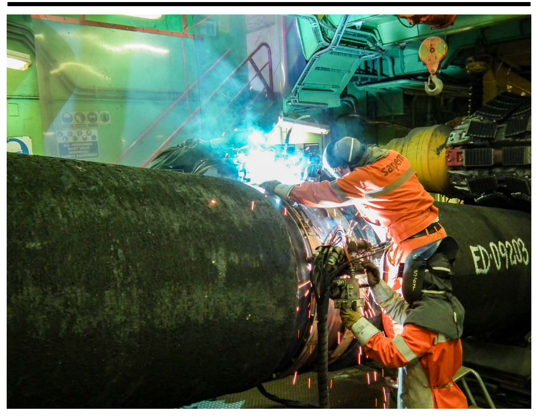
WELDERS WORK ON THE CASTORO SEI PIPELAYING VESSEL.

ransatlantic coordination on sanctions can strengthen European energy security if sanctions are carefully crafted with European stakeholders in mind, as European energy security relies on diverse energy imports from competitive suppliers. Sanctions should be crafted to avoid inadvertent negative effects on transparent and law-abiding suppliers. Sanctions on Russia, Venezuela, and Iran require meticulous coordination to be impactful. The United States and the EU must work closely on implementation of current energy sanctions, as well as drafting any sanctions in the future. To the extent possible, the US and EU should make sure that sanctions achieve their purpose without jeopardizing the transatlantic relationship.