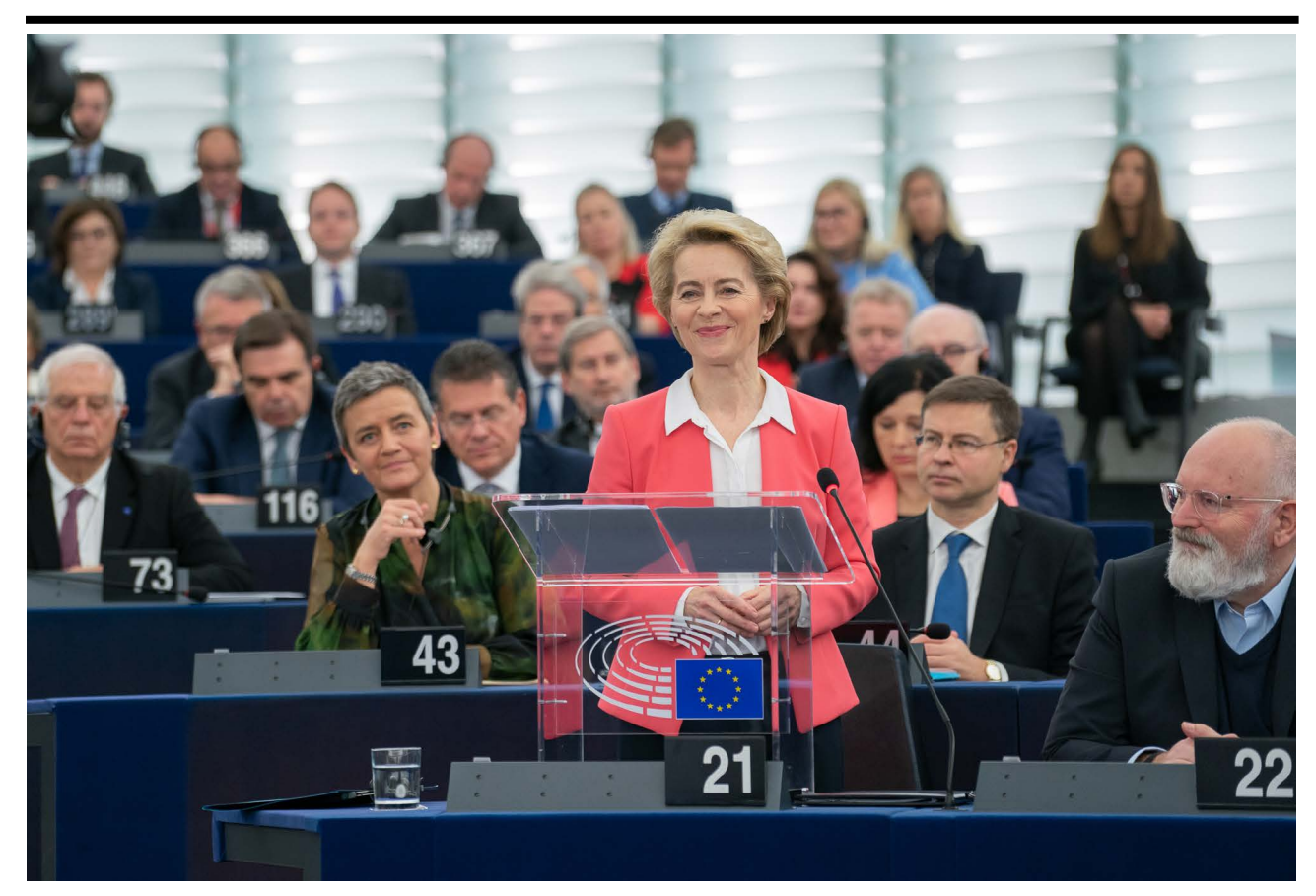
URSULA VON DER LEYEN SPEAKING IN A PLENARY CHAMBER.

The European Green Deal presents great opportunities and challenges for transatlantic collaboration. There is pressure on both sides of the Atlantic to achieve climate goals, while meeting society's energy demand at an acceptable price. This issue must be taken seriously,