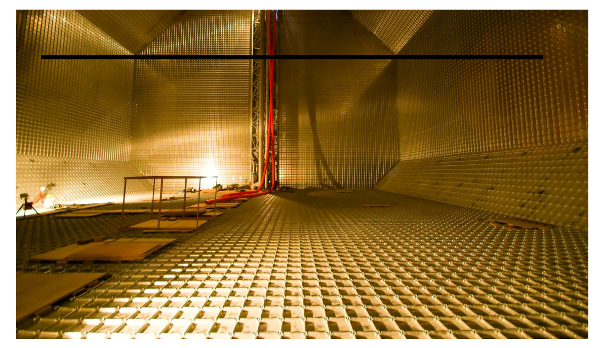
LIQUID NATURAL GAS MEMBRANE TANK.

NG could provide an alternative to both high-carbon coal and oil in multiple sectors, contributing to reduction in security threats from climate change. As an example, greater utilization of LNG in the shipping industry would provide greenhouse gas emissions reductions and cheaper fuel options. The shipping industry must reduce its carbon emissions 50 percent from 2008 levels by 2050, according to the United Nations International Maritime Organization's 2018 strategy.<sup>24</sup> Managing methane emissions leakage, or "methane slip," must be part of the shipping industry's transition. Seven hundred and forty-six ships are powered by LNG today, with two hundred and forty-three on order, out of sixty thousand global oceangoing vessels.<sup>25</sup> The industry presents tremendous potential for LNG demand and a natural area for US-FU collaboration.