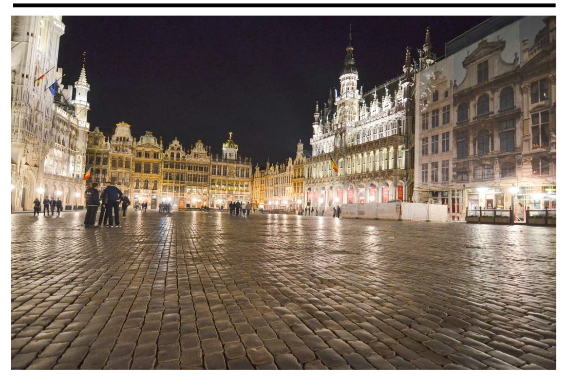
THE GRAND PLACE IN BRUSSELS, BELGIUM, AT NIGHT.

and Energy Security working groups of the Council should be reinvigorated.<sup>86</sup> The United States, the EU, and third countries should initiate dialogues, as necessary, to facilitate work on the proposed recommendations.