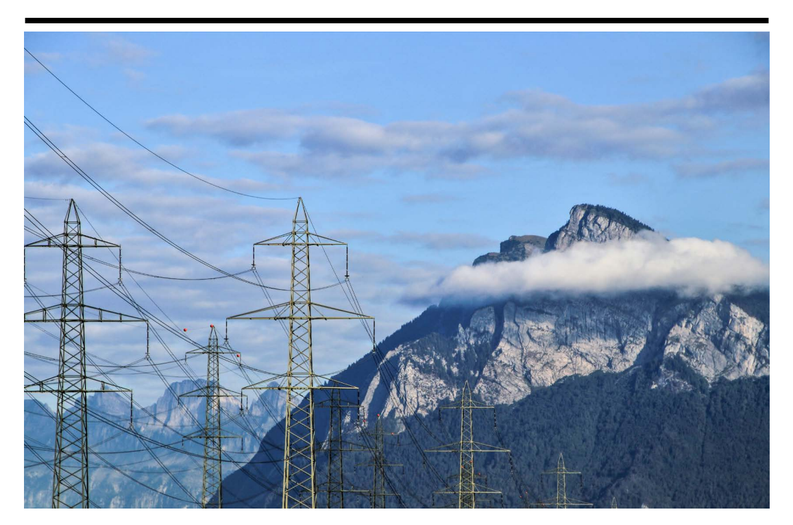
TRANSMISSION TOWERS IN THE ALPS.

rioritizing projects with the greatest energy security benefits is a crucial first step, and much of the work has already been done. Multiple European priority projects in energy infrastructure are identified in the EU's Projects of Common Interest (PCI) list and through regional efforts, such as 3SI, which outlined key energy, transportation, and digital projects in twelve EU member states located between the Adriatic,