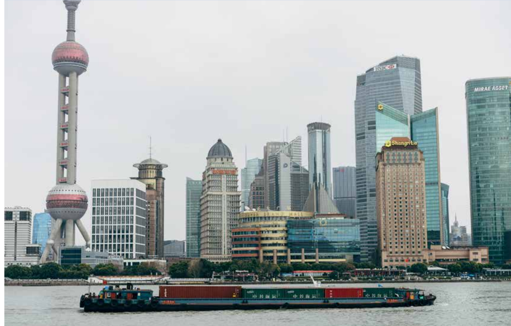
Container barge passing by in Shanghai, China. Increasingly, the center of gravity of the global trade and financial system is shifting East, toward China, and South.

But a larger body of evidence suggests countertrends—more a transition in the patterns and character of globalization, less a decline in interdependence than a shift toward more market-driven regionalization—evident in shorter, more local and regional global value chains and proliferating regional and intra-