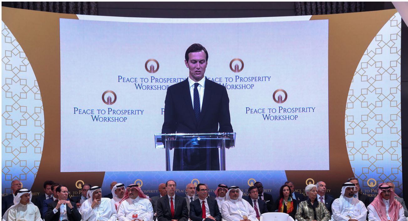
White House senior adviser Jared Kushner speaks at the “Peace to Prosperity” conference in Manama, Bahrain, June 25, 2019.

gruesome murder should not lead to its isolation. 7 In Washington, where Middle East tensions require delicate social protocols, Saudi Arabia’s Ambassador to the United States Princess Reema Bandar Al Saud surprised the diplomatic world in September by sending out Rosh Hashanah cards to celebrate the Jewish New Year. 8