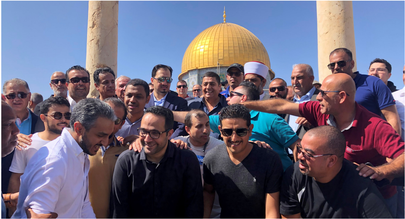
Saudi Arabia's national soccer team members pose in front of the Dome of the Rock in Jerusalem, October 14, 2019.

In addition to its conventional military capabilities, Israel is one of the most advanced countries in the world in the cyber domain, bolstered by strong private sector investment in technology. These capabilities are comparable to those of China, Russia, the United Kingdom, and the United States. Drones, or unmanned aerial vehicles, are another market where Israel has established itself as a major manufacturer and exporter. 25