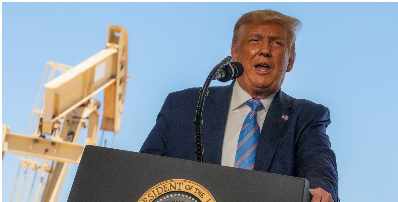
President Donald Trump delivers a speech during a tour of the Double Eagle Energy Oil Rig in Midland, Texas, on July 29, 2020.

influential issues will guide how the next administration approaches energy and climate policy in January 2021. Given the twists and turns that 2020 has presented so far, it is impossible to confidently predict the future status of any of them. With multiple scenarios in mind, this paper details their respective implications below.