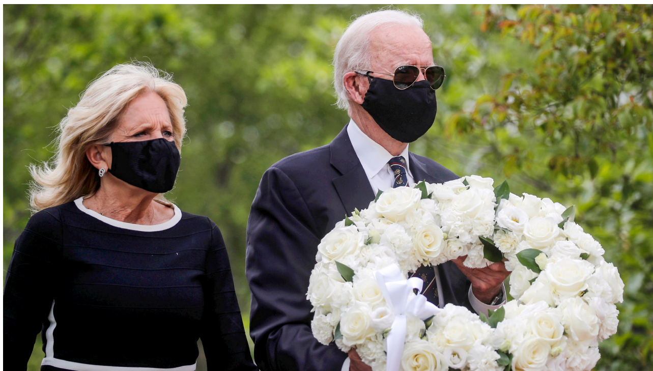
Democratic US presidential candidate and former Vice President Joe Biden and his wife Jill visit the War Memorial Plaza on Memorial Day 2020, amid the COVID-19 pandemic.

(e.g., support for bans on hydraulic fracturing on both private and public lands, and a fossil fuels export ban) and faster targets for a net-zero or fully decarbonized economy. The Biden campaign largely resisted the most controversial demands, such as some of the recommendations by the Democratic National Convention Environment and Climate Crisis Council. 21 Further, the Biden team has shown itself more open to options such as advanced nuclear energy technologies, carbon pricing, and carbon capture technologies, of which the party's more progressive wing has been much more skeptical.