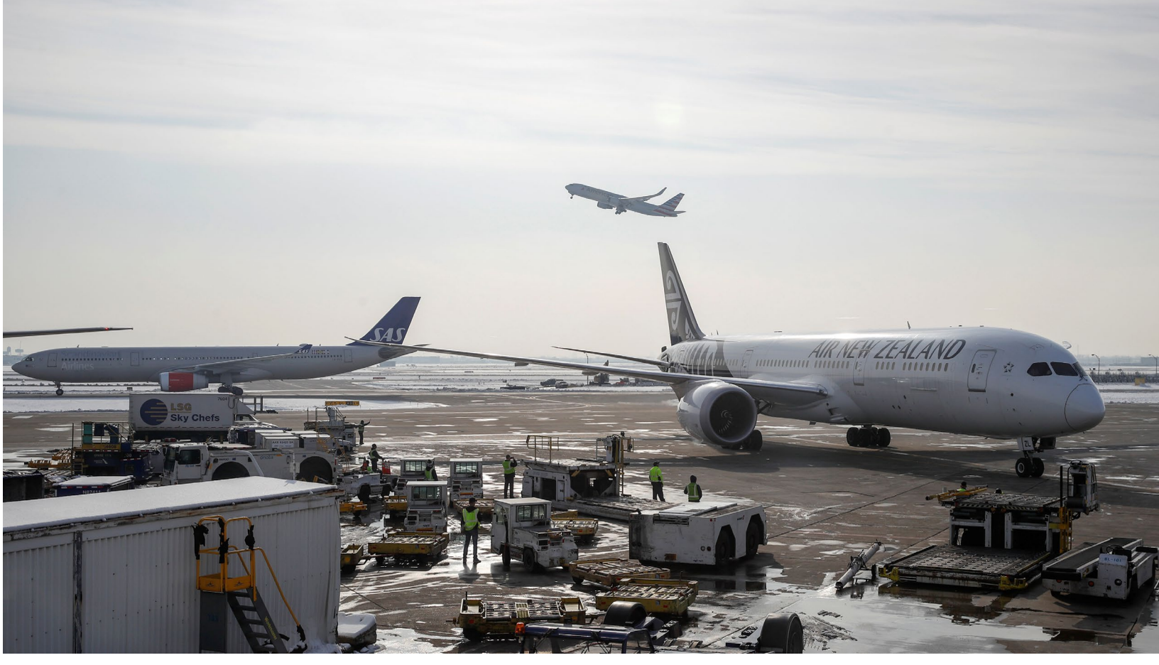
A SAS Airbus A330-300 plane and an Air New Zealand Boeing 787-9 Dreamliner plane taxi while a American Airlines Boeing 737 takes off at O'Hare International Airport in Chicago, Illinois, U.S. November 30, 2018.

WTO dispute settlement takes too long. Most WTO disputes now take more than three years to get an adopted panel or Appellate Body decision.<sup>29</sup> The time until the winning member can retaliate to induce compliance can often be much longer due to an appealable compliance proceeding and period of time for compliance. As one example, the US and EU disputes regarding the subsidization of large civil aircraft lasted fifteen years between initiation and retaliation by the United States.