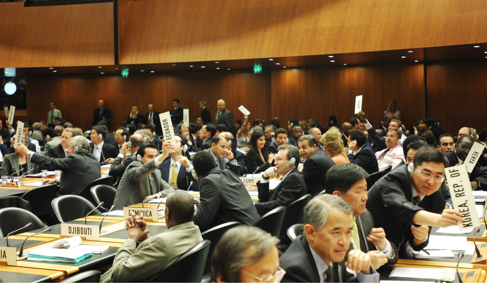
Consultations took place among a group of ministers representing all interests in the negotiations of the WTO's Doha Round. A series of meetings were held in Geneva from 21 to 30 July 2008.

permitted, especially among major economic competitors, while providing some flexibility for LDCs. As an initial matter, WTO members should seek to reduce bound rates (i.e., maximum permissible rates) close to applied levels (i.e., the level actually applied in practice). This would not require any change in the existing practices of many countries, and will provide greater predictability for traders.