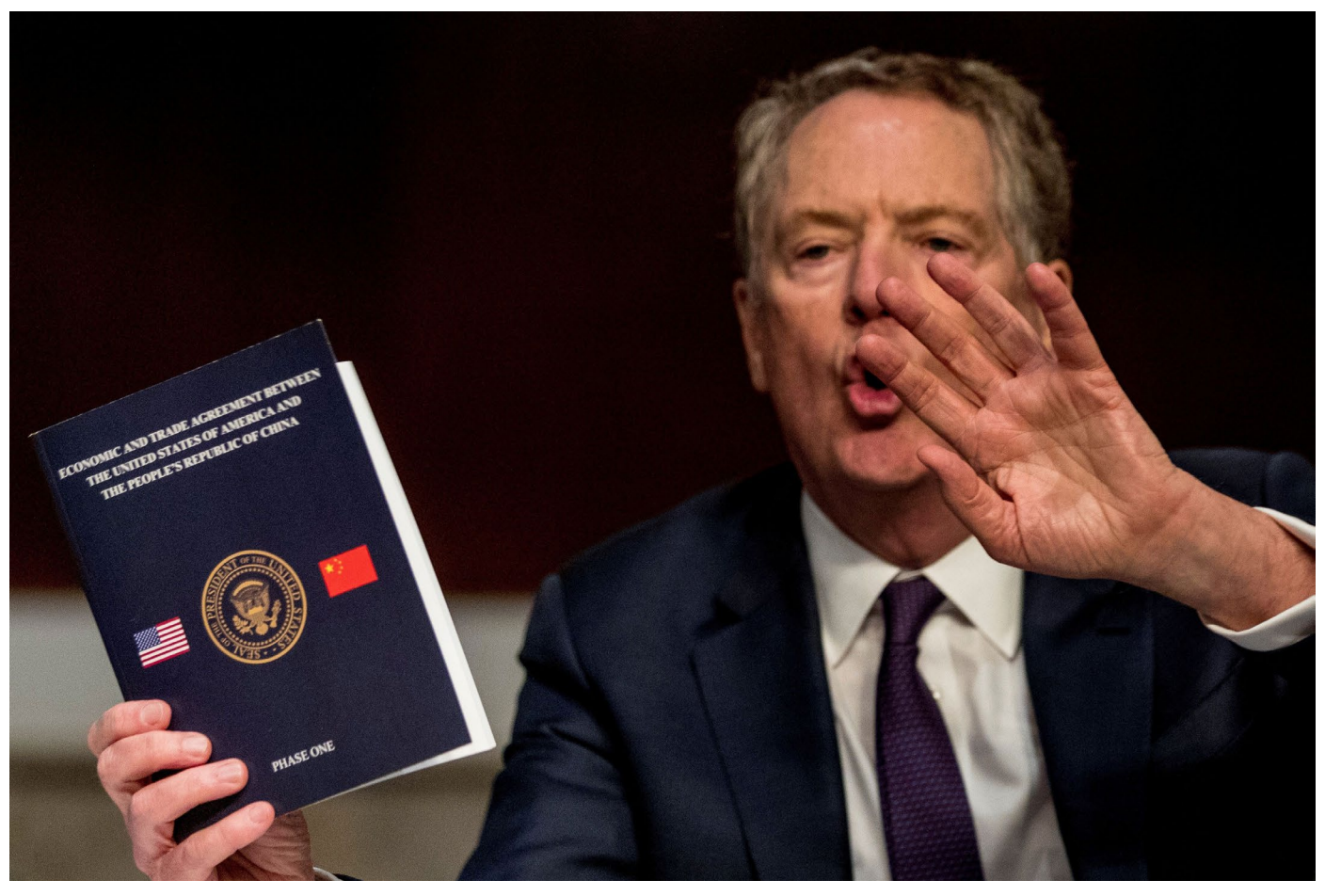
U.S. Trade Representative Robert Lighthizer holds up a document titled "Economic and Trade Agreement Between the United States of America and the People's Republic of China - Phase One"