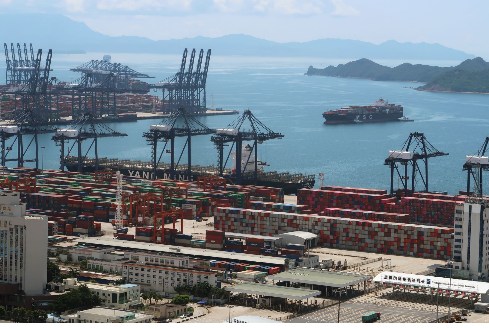
A cargo ship carrying containers is seen near the Yantian port in Shenzhen, following the novel coronavirus disease (COVID-19) outbreak, Guangdong province, China May 17, 2020 Photo Credit: Reuters. https://tinyurl.com/yyox47y3