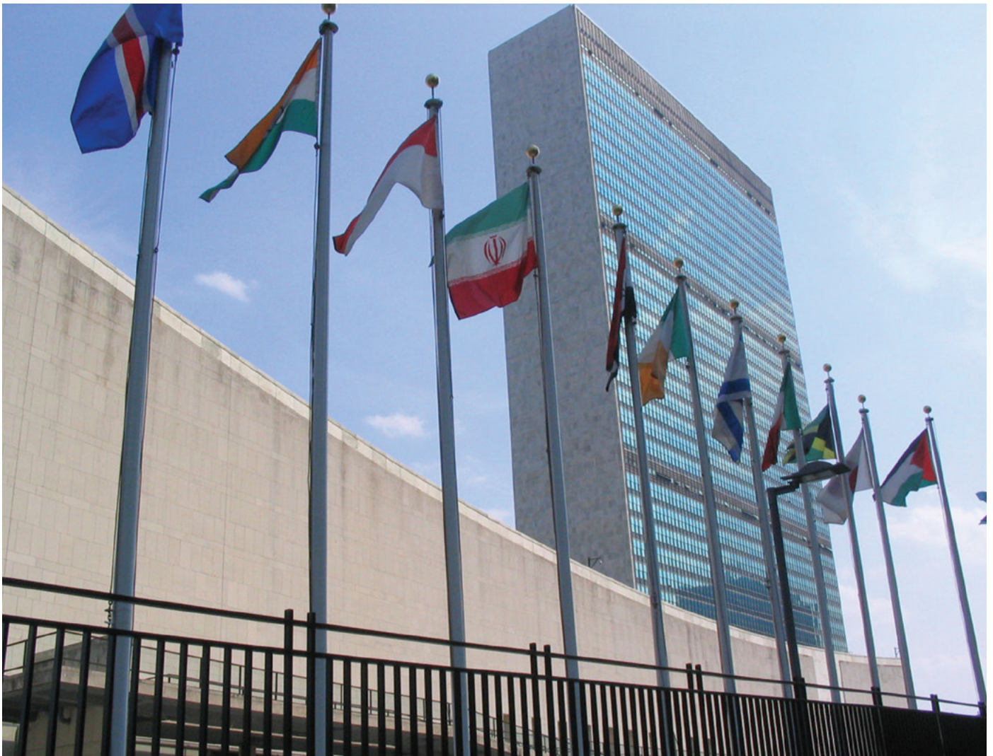
United Nations, flag of the Islamic Republic of Iran.

As the international community seeks to reengage with the Islamic Republic of Iran on security and trade issues, it should better understand, improve, and implement the civil litigation tools needed to hold IRI perpetrators responsible for serious international crimes. By doing so, the international community will ensure that security and trade issues do not overshadow human rights concerns in engagement with the IRI, and help combat impunity for gross human rights violations and atrocity crimes.