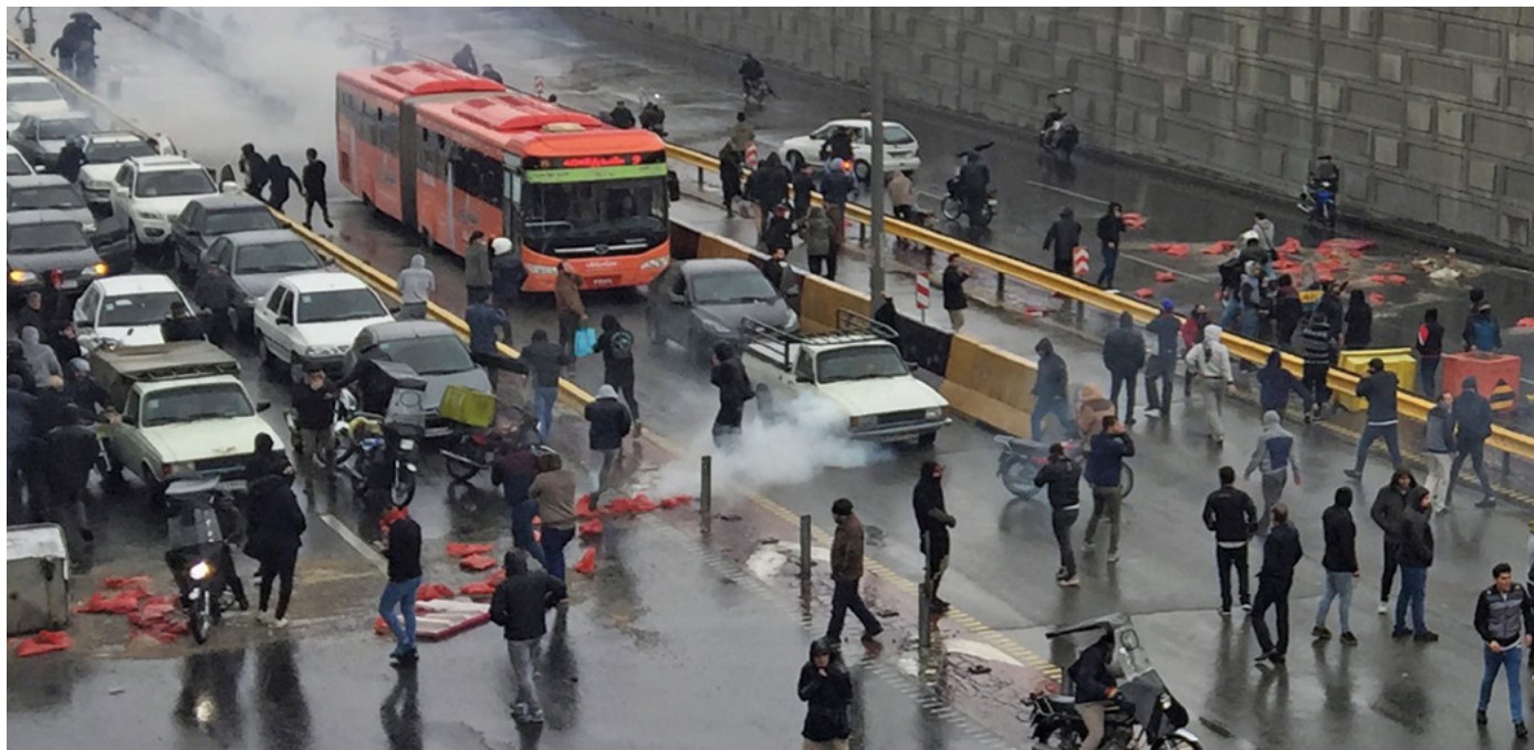
In November 2019, anti-government protests erupted in Iran and quickly spread nationwide. Known as the Aban protests, the demonstrations were met with a violent response by Islamic Republic state security forces. Thousands of peaceful protesters were killed or jailed on national security charges. To this day, no government officials or perpetrators of the killings have been held responsible.

on the legal bar and the jailing of lawyers who represent civil society activists. 21 This means that those who—around the world—act as a bulwark in societies for those targeted for political reasons are now the targets themselves in Iran, for no reason other than their peaceful representation of clients in politically sensitive cases.