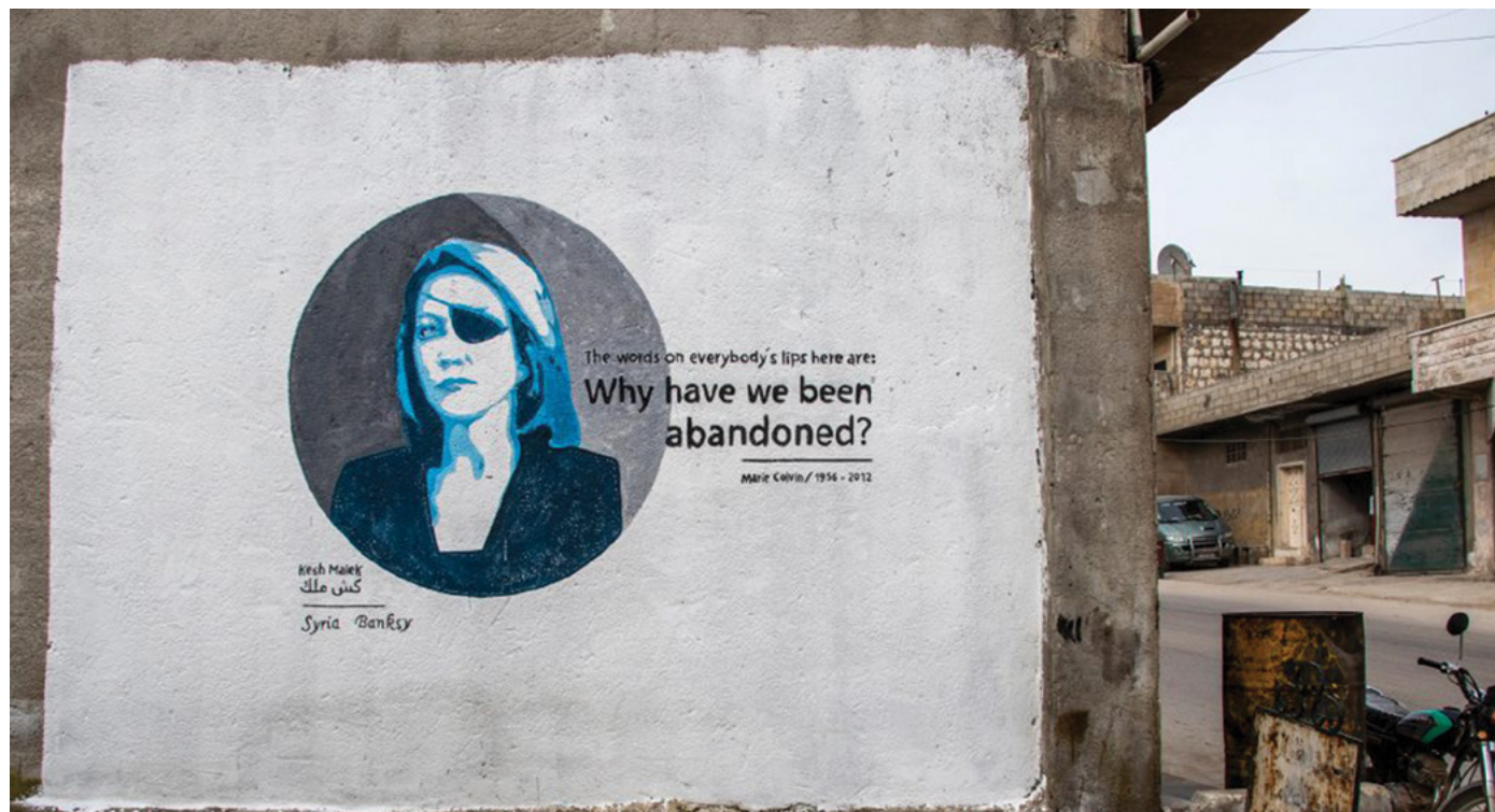
March 11, 2019. Marie Colvin “Why have we been abandoned?”; in homage to slain journalist Marie Colvin who lost her life in Homs while covering attacks by the Bashar al-Assad regime in 2012.

Victims may include those who were killed or physically or emotionally injured, as well as members of a victim’s immediate family who suffered from intentional infliction of emotional distress. Additionally, the private right of action provided by §1605A recognizes that both the foreign state itself and any official, employee, or agent of that state can be held liable for personal injury or death resulting from any of the enumerated acts specified by the statute. 92