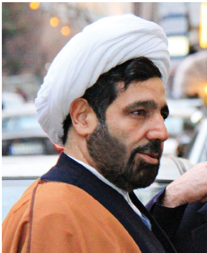
An Iranian fugitive judge who died after a fall from a hotel window in the Romanian capital Bucharest, Gholamreza Mansouri was accused of corruption in Tehran and of human rights violations by lawyers and activists.

In some instances, suing the state can also fill gaps in accountability where justice has proved elusive. While universal jurisdiction prosecutions in Europe for atrocities in Syria are now on the rise, up until recently, Syrian President