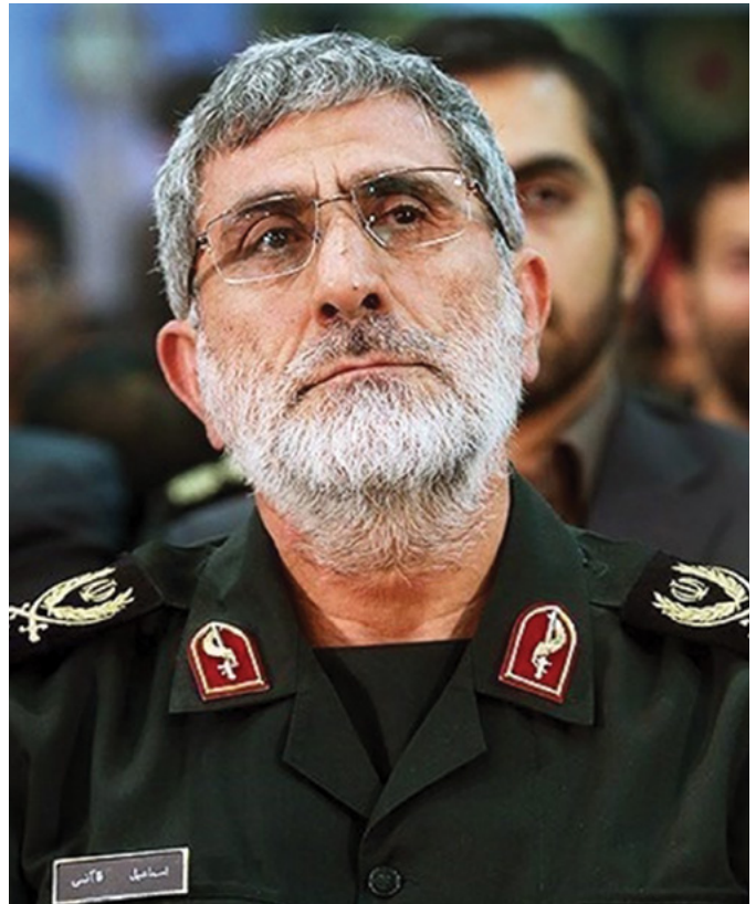
Esmail Ghaani, Head of Iran’s Islamic Revolutionary Guard Corps Quds Force. The Quds Force has been implicated in perpetrating alleged war crimes in Syria, among other abuses.

Whereas Iranian leaders have taken other actions of state officials to court, for example, when it comes to charges of corruption, this is usually the result of political infighting. 20 In this environment focused on punishing financial crimes, liability for human rights abuses tends to be largely absent.