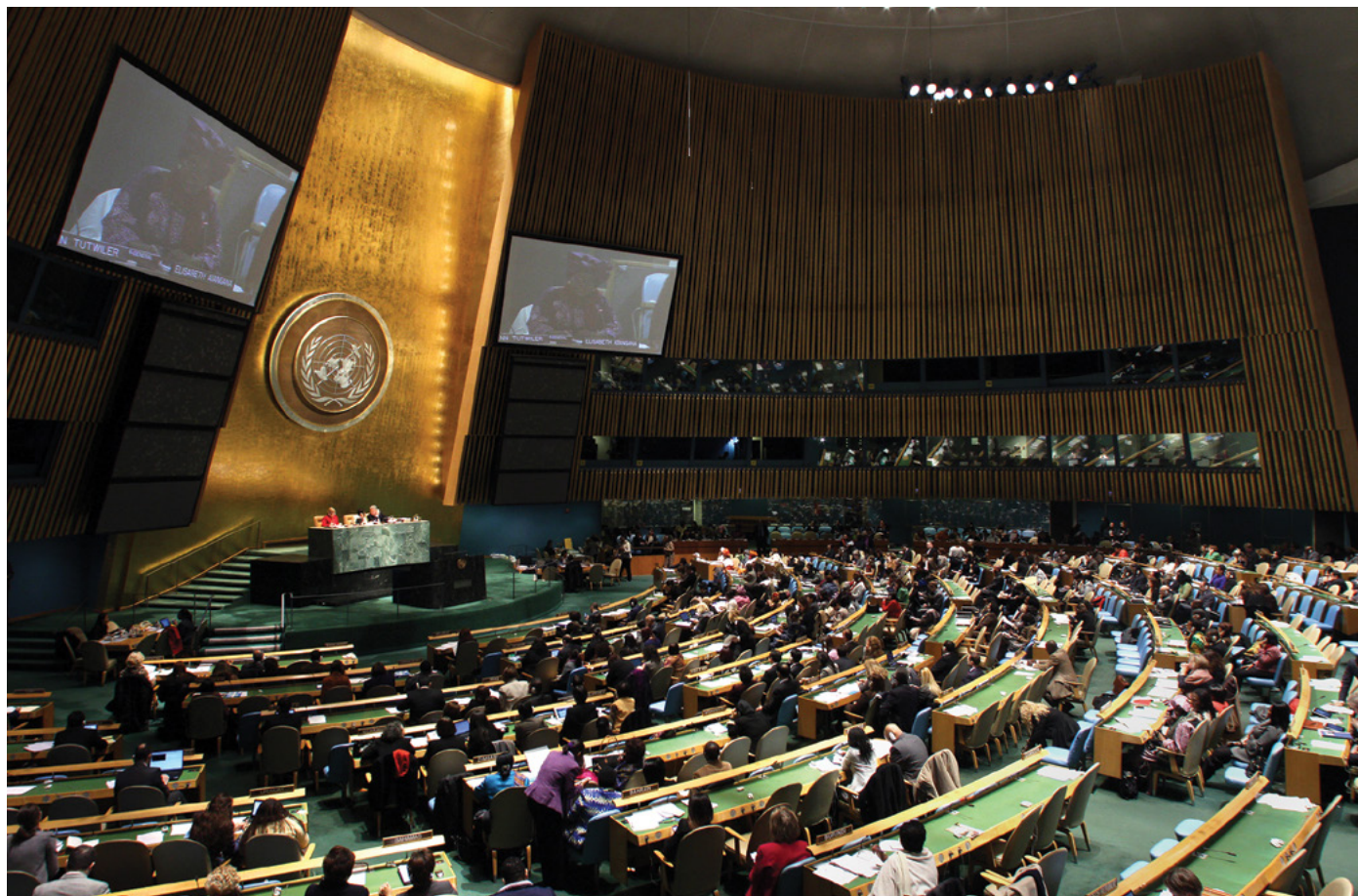
General Assembly Hall at United Nations Headquarters in New York.

the United States. Given the comprehensive immigration restrictions and travel bans currently in place for Iranian officials, it is not likely that an IRI perpetrator could be served, even once global travel resumes following the ongoing COVID-19 pandemic. 49 Additionally, a current head of state or anyone with diplomatic immunity cannot be the subject of a successful ATS suit, so that would rule out serving process on any IRI officials visiting the United States for the United Nations General Assembly. Extradition is not an option for civil suits so that would not be a means through which an IRI offender could be brought to a US court.