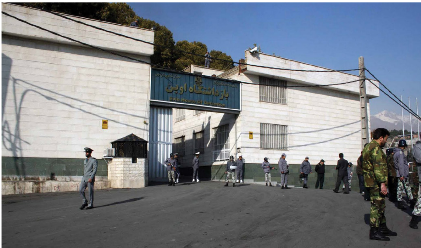
August 24, 2008. Located in north Tehran, Evin prison is one of Iran’s most notorious prisons. The prison holds a large number of political prisoners, many of whom report having been subjected to harsh interrogations, forced confessions, solitary confinement and mental and physical torture.

T his report combines a mix of desk research and insights from first-person interviews with government officials, lawyers, academics, and affected communities conducted between July 2019 and May 2020.