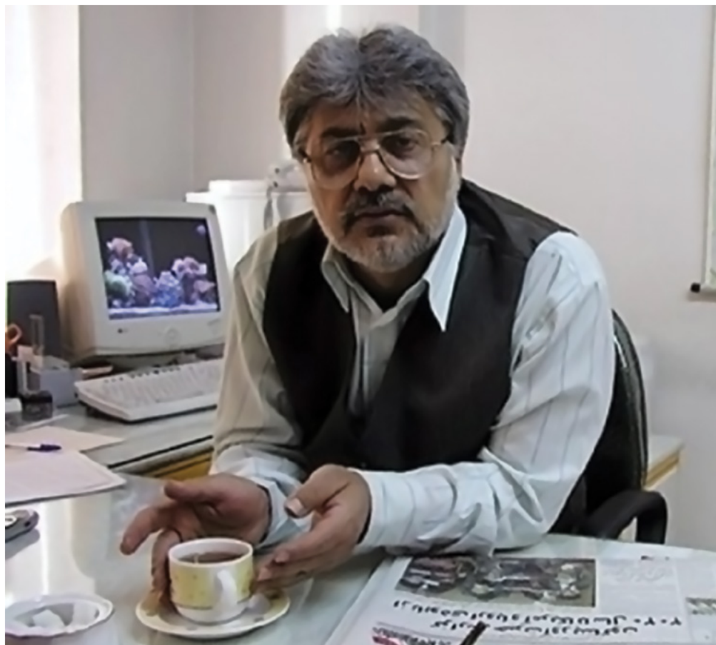
Isa Saharkhiz, Iranian journalist and political activist. Saharkhiz has faced multiple arrests and has been repeatedly targeted by the Iranian authorities for at least a decade.

claims involve a country or course of conduct for which the US government has a dedicated human rights sanctions regime (e.g., the country regimes focused on Iran, Venezuela, or North Korea, or the Global Magnitsky Human Rights Accountability Act). In limiting the ATS across the board, the Supreme Court cited separation-of-powers concerns that “apply with particular force” and cautioned against courts creating private rights of action under the ATS, which would implicate foreign policy issues. 62 In the case of countries, organizations, or individuals already subject to human rights sanctions for the types of violations and abuses that can be litigated under the ATS, the US State Department has already made a decision that those violations and abuses offend US government interests and warrant formal action. Therefore, ATS cases involving sanctioned countries, individuals, and conduct are less likely to negatively affect the comity of nations or those separation-of-powers issues about which the Supreme Court raised concerns.