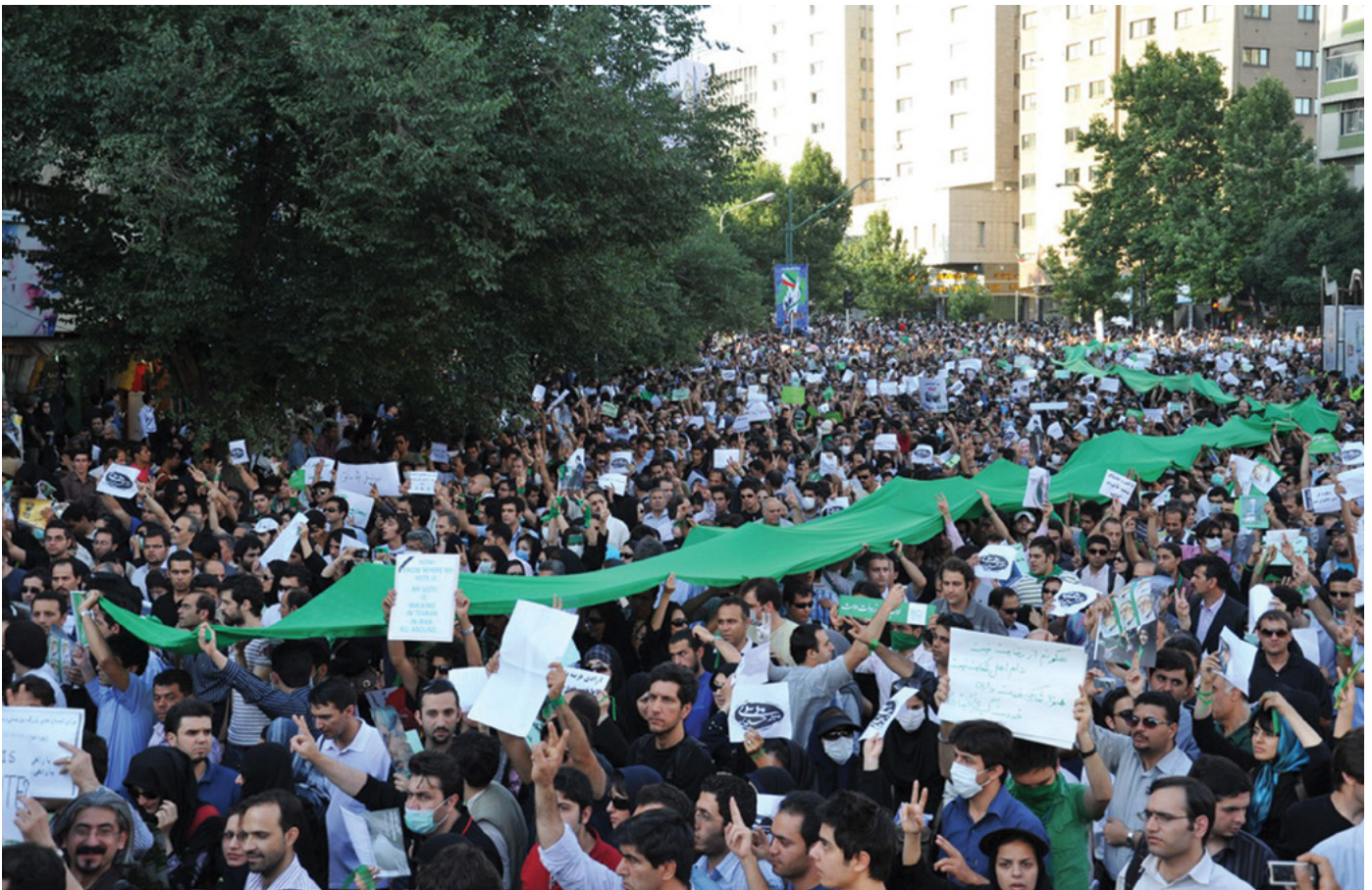
June 16, 2009. Tens of thousands of Iranians took to the streets to protest irregularities in the 2009 Iranian presidential election. In response to the protests, state security forces violently cracked down on peaceful protesters with disproportionate force. Scores of protesters were arrested and later tortured, and even killed, in detention centers.

The Atlantic Council aims for this report to be the first in a series of reports covering strategic litigation tools that can be applied to the IRI—as well as other states, state actors, and non-state actors in jurisdictions around the world.