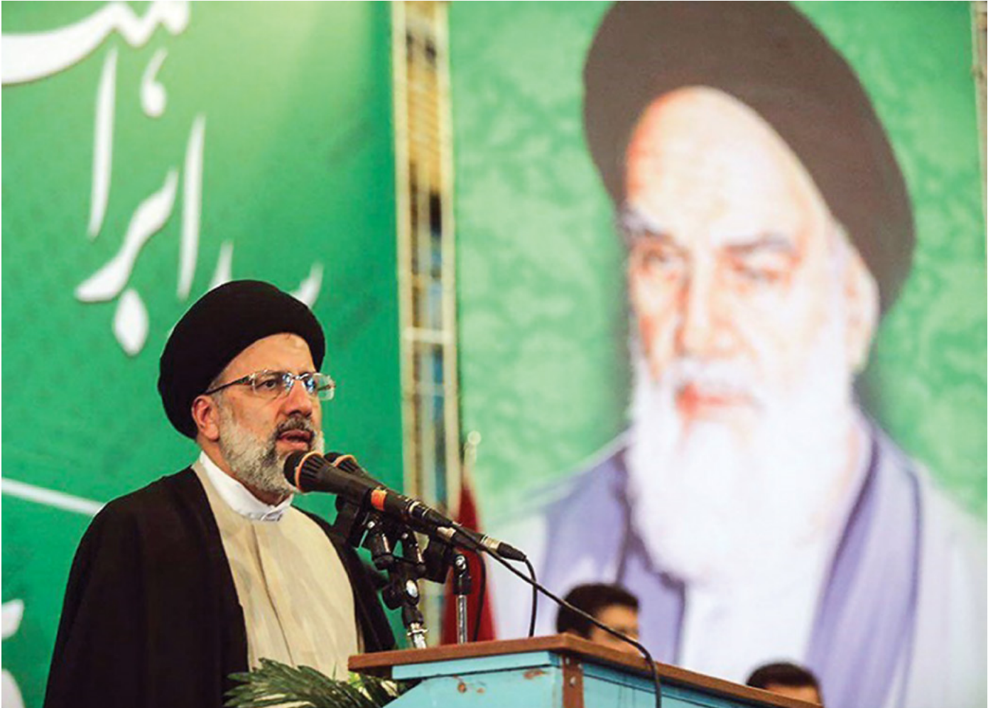
The head of the judiciary of the Islamic Republic, Ebrahim Raisi, known for his role in the summary executions of thousands of political prisoners in Iran in 1988.