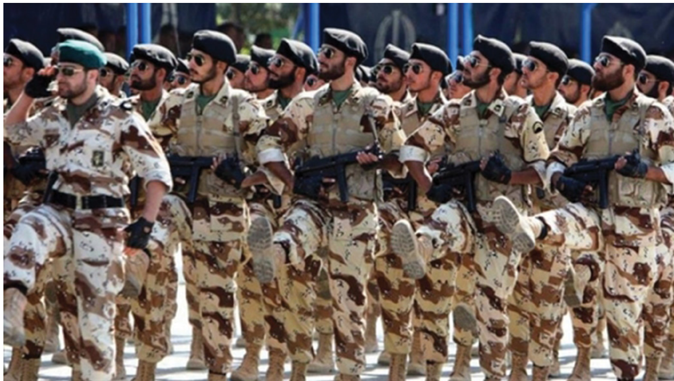
The Islamic Revolutionary Guard Corps marching in a Tehran military parade.

report, the international community has not yet agreed to a standard legal definition. 144 Some disputes center around political issues, for example, whether national liberation movements should be excluded from the scope of application of the definition or not. 145 The lack of alignment around a definition as well as selective application of this crime has led to a view by some states that terrorism is a “politicized” crime, and is a reason for reluctance to enforce terrorism judgments across borders. 146