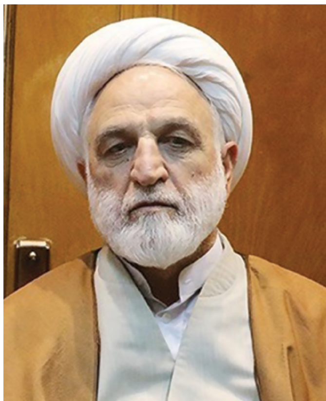
Gholam Hossein Mohseni-Ejei, First Vice Chief of Justice, 2014 - present. Mohseni-Ejei plays a key role in the human rights violations of the IRI judiciary and used his prior position as judiciary spokesman to defend and advance its abuses. As Minister of Intelligence, he played a leading role in the violent crackdown on peaceful protesters in the aftermath of the June 2009 presidential election in Iran.

Investing in strategic civil litigation could prove to be a useful tool toward this goal. It is a targeted, surgical option that directly ties the human rights violations of governments and governmental actors to the money damages they need to pay survivors and victims for those harms. Legal measures are, by their nature, targeted at those in