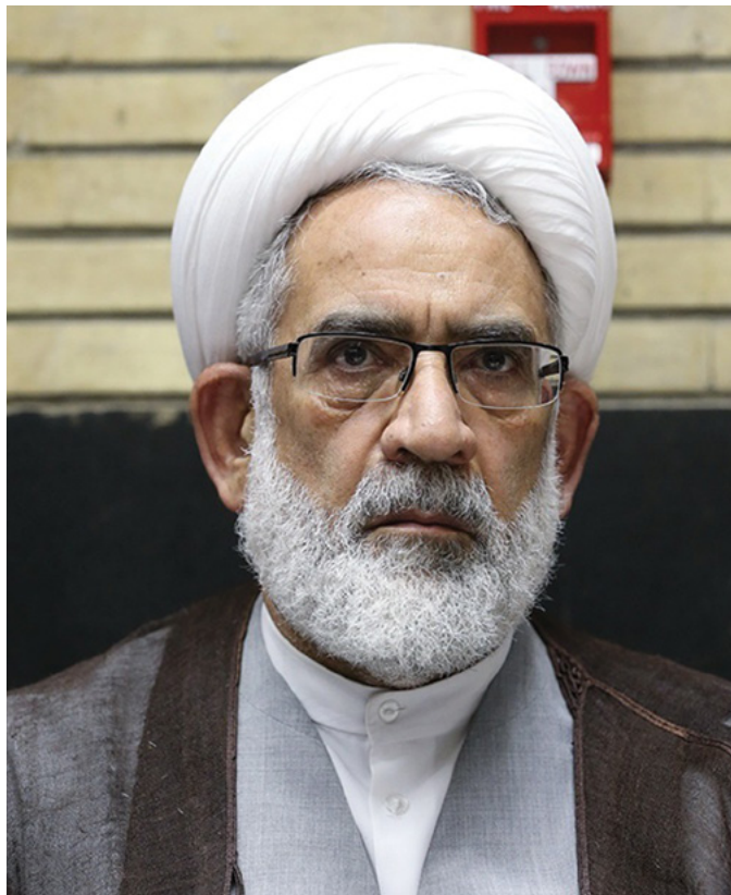
Mohammad Jafar Montazeri, Prosecutor General, 2016 - present. He played a key role in suppressing the December 2017-January 2018 anti-government protests in Iran. He is also responsible for harsh prison sentences, including death sentences, issued against protesters participating in the November 2019 protests.

categories of plaintiffs who can bring suit, what acts they can bring suit for, and which states they can bring suit against; ii) ensuring compensation and enforcement of judgments; and iii) building US governmental mechanisms that can assist with suits and enforcement of judgments.