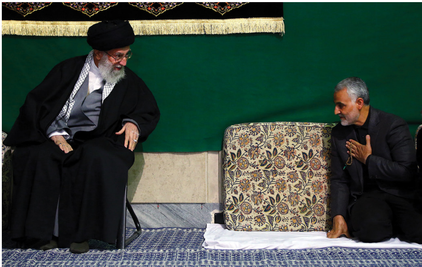
Iran's Supreme Leader Ali Khamenei and former IRGC Quds Force commander Ghassem Soleimani.

intelligence, no protected sources, or anything else that should be deemed classified, the information has not been provided and has been tagged as 1.4(c), which classifies intelligence activities, sources, and methods, and cryptology. 136 In some cases, attorneys have been forced to file lawsuits in court to enforce rights under FOIA.