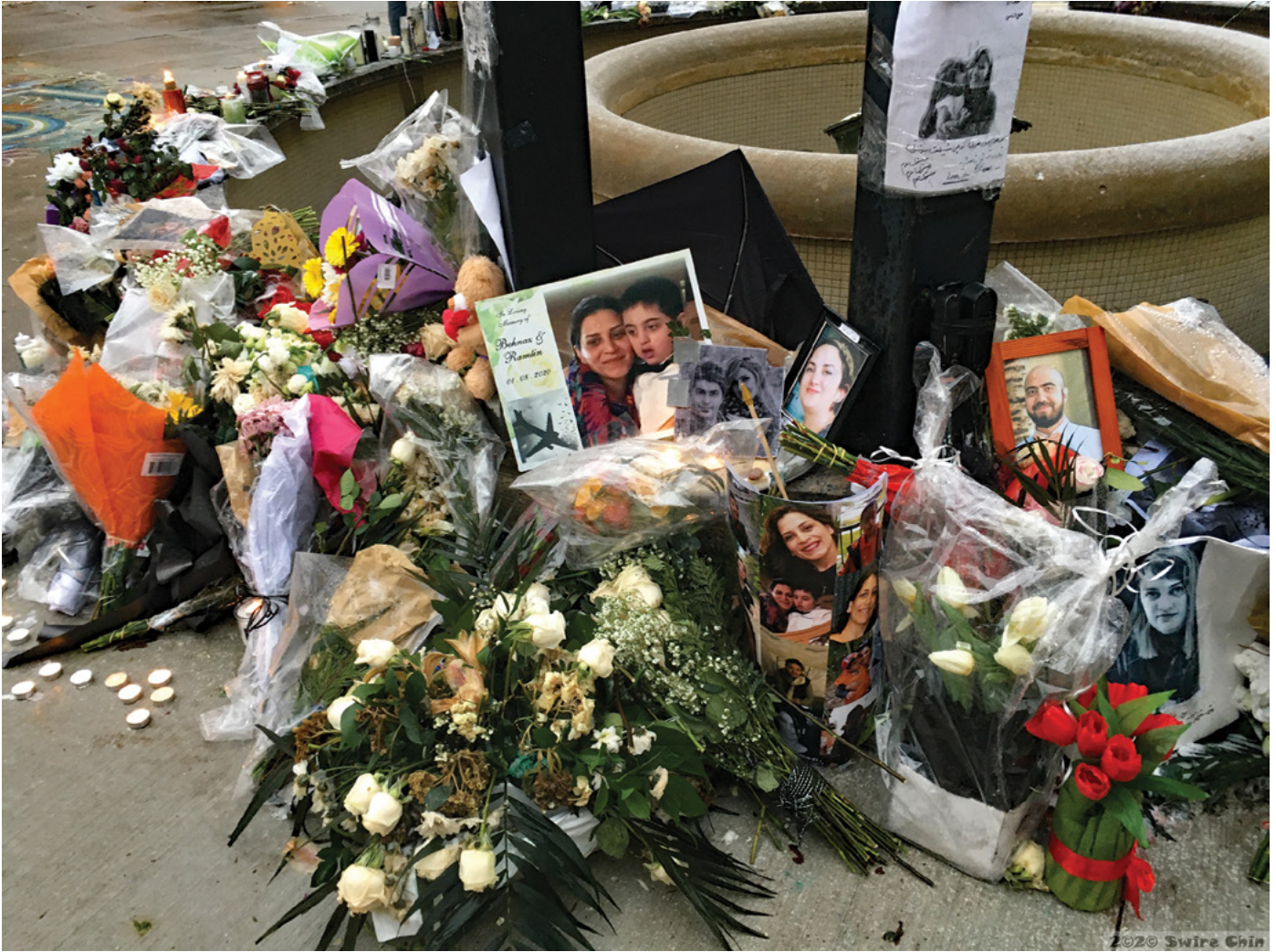
January 13, 2020. Faces of PS752 victims. The downing of Ukraine International Airlines Flight 752 (PS752) by Iran's IRGC forces on January 8, 2020 has put Canada's Iranian diaspora community into the spotlight. Of the 176 victims on the flight from Tehran to Kiev/Kyiv, 57 held Canadian citizenship and 138 were en route to Canada.

the Second Circuit held that the underlying acts violate jus cogens norms—a category of norms accorded a peremptory status under international law and that includes torture—and therefore cannot trigger the doctrine. 169