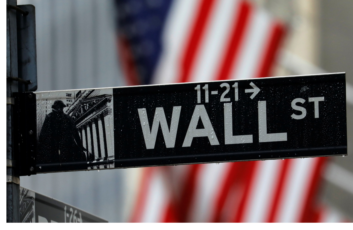
Raindrops hang on a sign for Wall Street outside the New York Stock Exchange in Manhattan in New York City, New York, U.S., October 26, 2020.

he China challenge has intensified during the COVID-19 pandemic. The Trump administration has blamed the CCP for unleashing "the China virus." China initially attempted to use the virus as an opportunity for increasing China's influence, including through its "mask diplomacy"