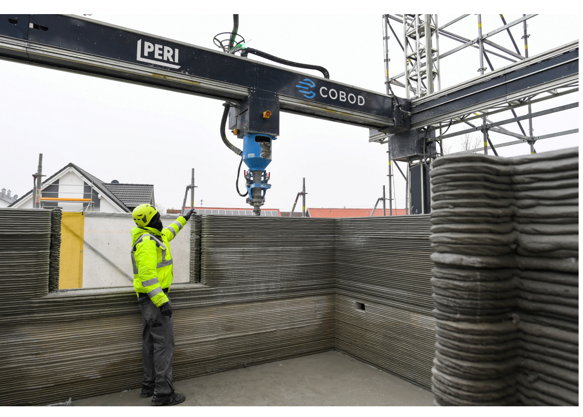
The wall of an apartment house is being printed by a 3D printer in Wallenhausen, Germany, November 25, 2020.

GLOBAL STRATEGY 2021: AN ALLIED STRATEGY FOR CHINA ELEMENTS OF THE STRATEGY