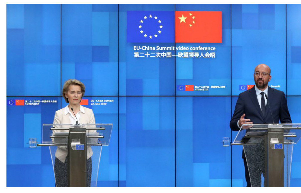
European Council President Charles Michel and European Commission President Ursula von der Leyen attend a news conference following a virtual summit with Chinese President Xi Jinping in Brussels, Belgium June 22, 2020.

The PRC has played a constructive role in nuclear nonproliferation. It supported multilateral sanctions against nuclear programs in Iran and North