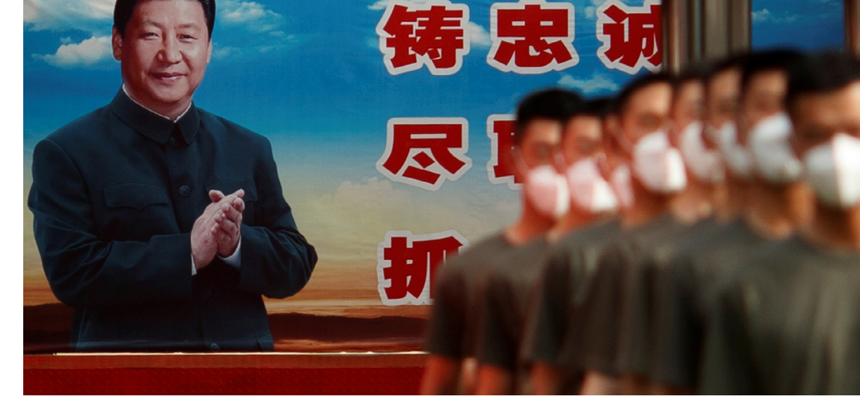
Paramilitary Police officers march in formation near a poster of Chinese President Xi Jinping at the gate to the Forbidden City on the opening day of the National People's Congress (NPC) following the outbreak of the coronavirus disease (COVID-19), in Beijing, China May 22, 2020.

hina presents a serious challenge to likeminded allies and partners, and to the rules-based system. Over the past several decades, China has experienced a remarkable economic expansion. Deng Xiaoping implemented economic reforms in the late 1970s that allowed China to adopt elements of a capitalist economy while maintaining strict CCP control of politics. He opened China to foreign investment and loosened restrictions on internal markets. At the same time, the CCP maintained strict control over strategic sectors of the economy through