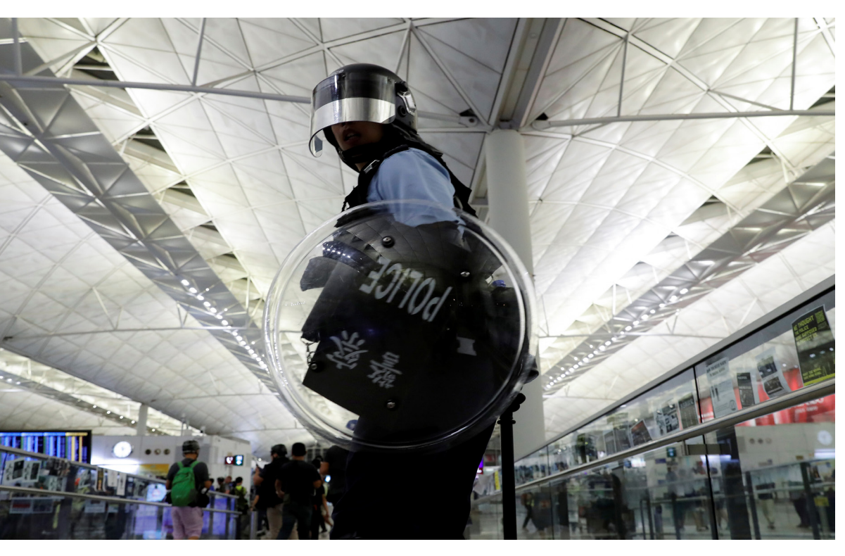
Riot police is seen during a mass demonstration after a woman was shot in the eye, at the Hong Kong international airport, in Hong Kong, China, August 13, 2019.

GLOBAL STRATEGY 2021: AN ALLIED STRATEGY FOR CHINA THE STRATEGIC CONTEXT