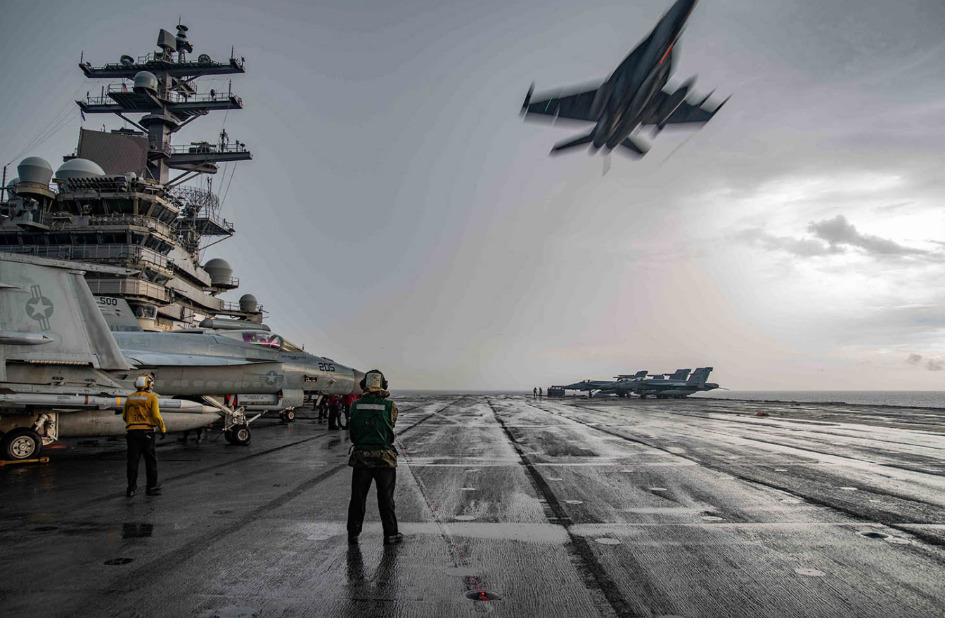
Hand out photo dated July 4, 2020 of an F/A-18E Super Hornet flies over the flight deck of the Navy's only forward-deployed aircraft carrier USS Ronald Reagan (CVN 76), maintaining Ronald Reagan's tactical presence on the seas. U.S.

With this broader framework in mind, consider China. China presents the greatest threat to the rules-based international system and likeminded allies and partners must defend against this challenge. A revitalized and adapted rules-based system will not flourish to its greatest extent if China, the world's second-largest economic and military power, remains outside the system or is actively attempting to undermine it. This brings this discussion to the goals for a global strategy for China.