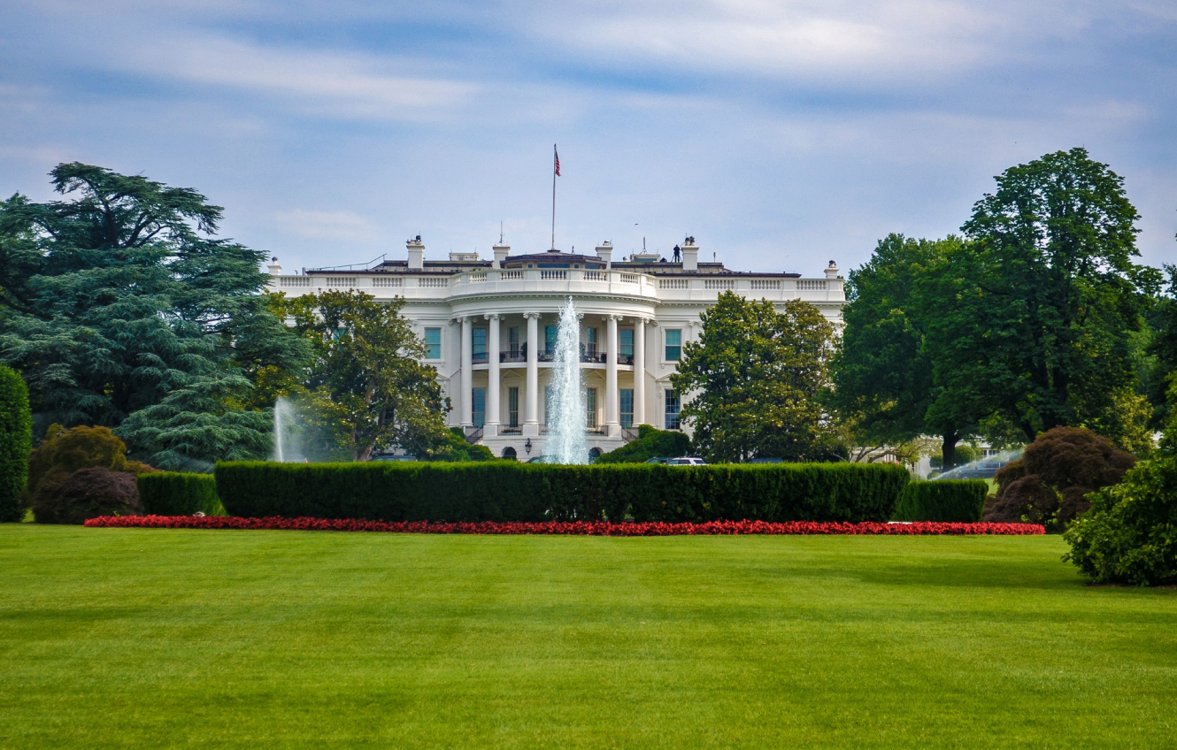
The White House.

According to this reading of China's interests, the CCP's primary goal is shaping the global order to assuage its concerns about its own survival. Therefore, it would be content with partially undermining the current rulesbased system to create enough space for its authoritarian norms and values to survive. Achieving this entails reducing the influence of liberal democracies in the global order to an undefined extent.<sup>160</sup> Furthermore, the precise contours of China's strategy to accrue power are unclear. One option would be for China to pursue regional hegemony as a gateway greater global influence. Another path is for China to focus on shaping global rules, standards, and institutions to its advantage, and leverage its economic and increasing technological power to boost its position in the global order.<sup>161</sup> This strategy is, therefore, resilient enough to address the CCP's various possible conceptions of its goals and its strategies for achieving them. It does not presume a specific strategy or set of objectives on the part of the CCP, but it is designed to address the CCP's evident assertiveness and willingness to undermine norms of the rules-based international system. The strategy would hold whether the CCP is pursuing global domination or a more limited sphere of influence designed to facilitate its survival.