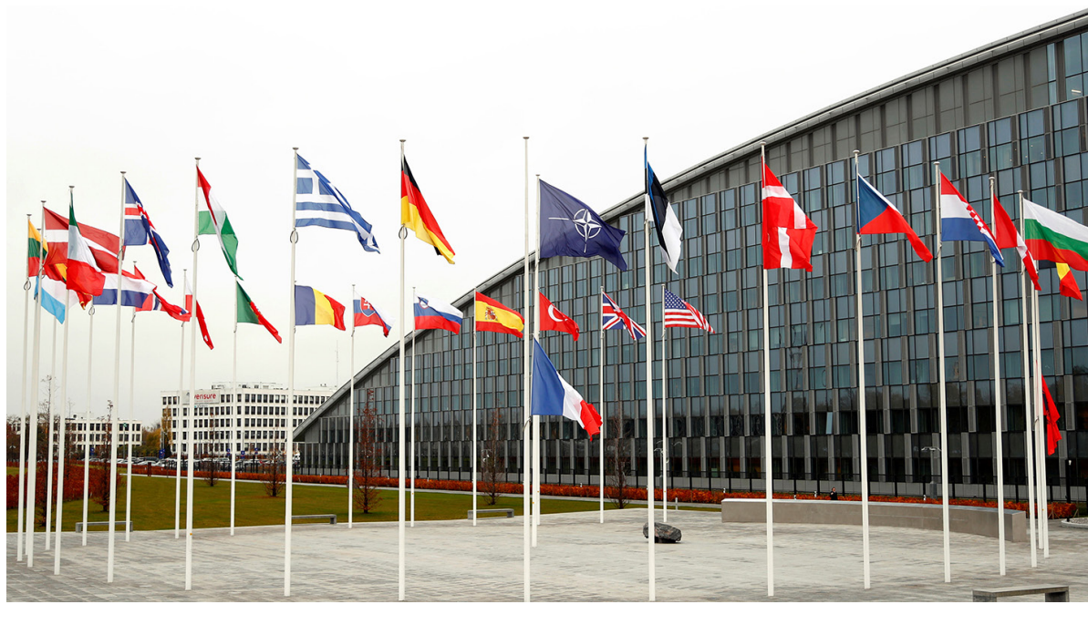
Flags of NATO member countries are seen at the Alliance headquarters in Brussels, Belgium, November 26, 2019.

ikeminded allies and partners must strengthen themselves, their alliances, and the rules-based system for a new era of great-power competition. Competition in most domains, such as athletics, is generally more about improving oneself than about bringing down a competitor. Great-power politics is no different. By bolstering themselves, likeminded allies and partners will be in a stronger position regardless of the choices made by China's leaders.