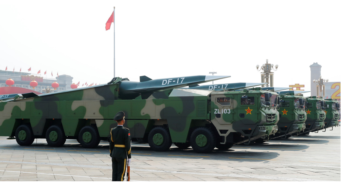
Military vehicles carrying hypersonic missiles DF-17 drive past Tiananmen Square during the military parade marking the 70th founding anniversary of People's Republic of China, on its National Day in Beijing, China October 1, 2019.

GLOBAL STRATEGY 2021: AN ALLIED STRATEGY FOR CHINA