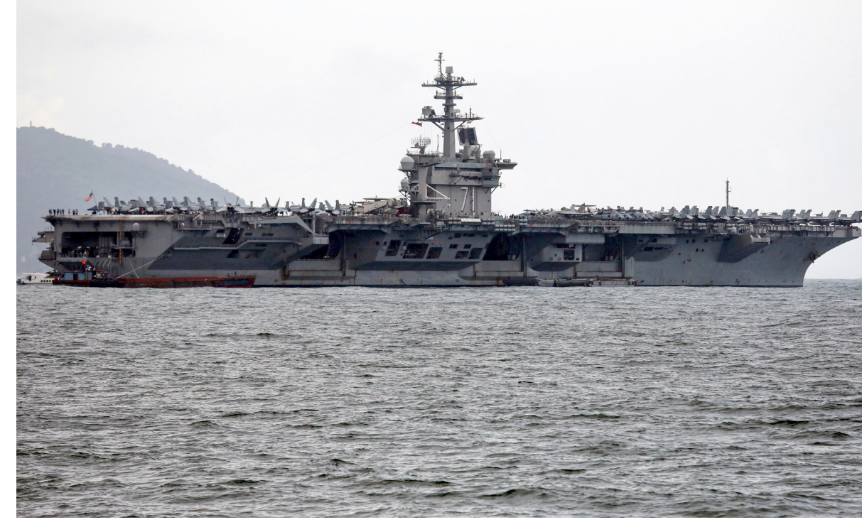
The USS Theodore Roosevelt (CVN-71) is seen while entering into the port in Da Nang, Vietnam, March 5, 2020.