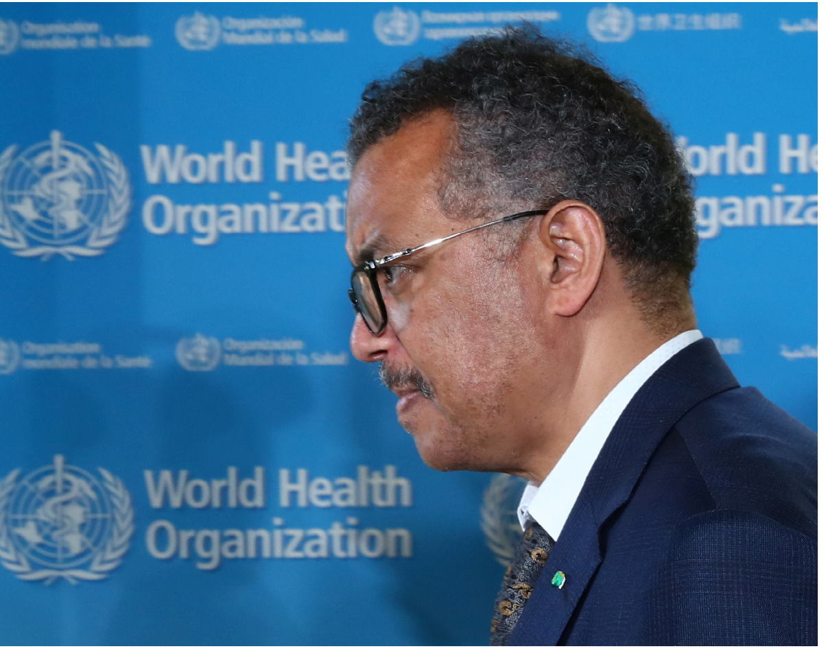
Tedros Adhanom Ghebreyesus, director-general of World Health Organization (WHO), attends a news conference in Geneva, Switzerland, June 25, 2020.