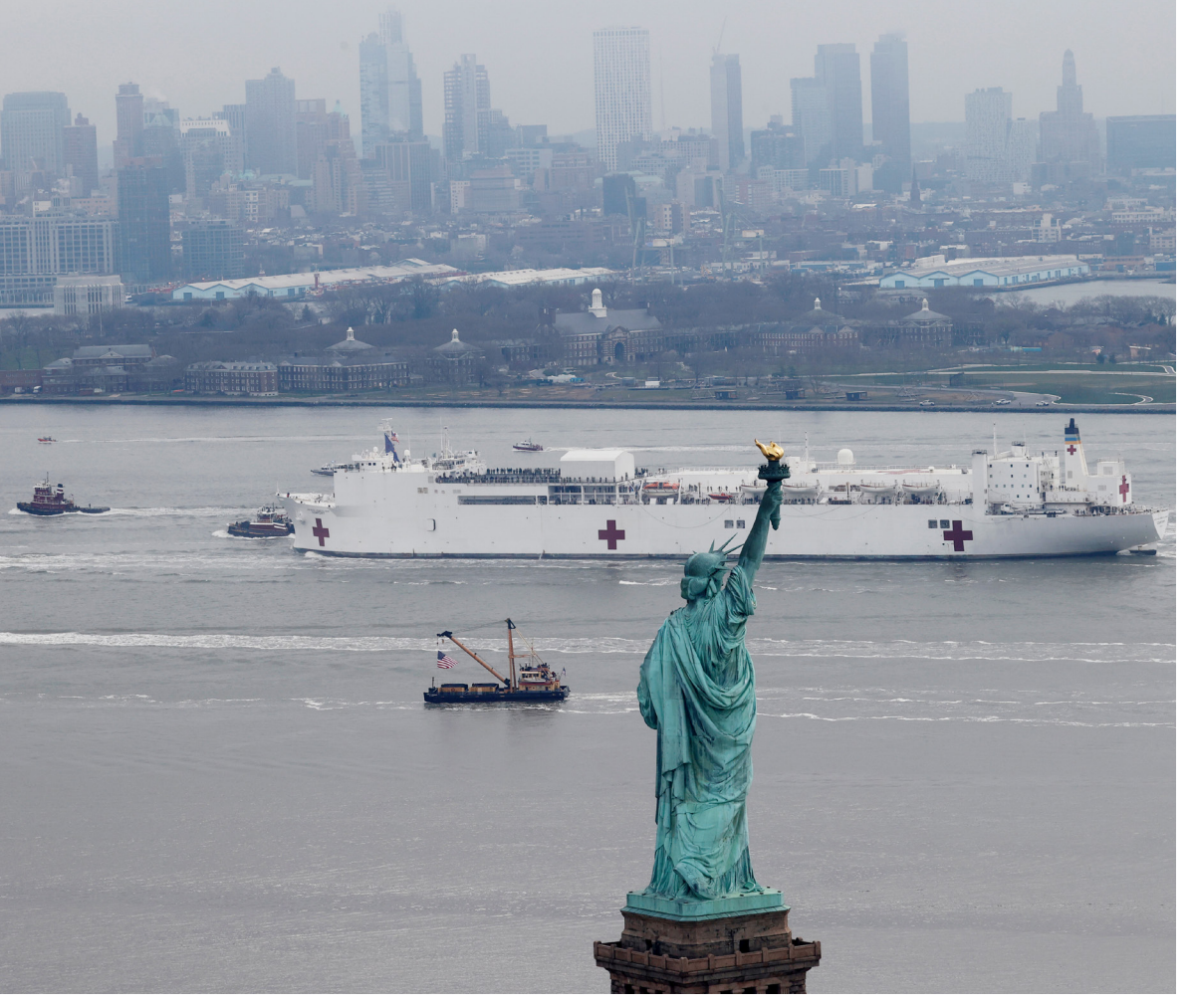
The USNS Comfort passes the Statue of Liberty as it enters New York Harbor during the outbreak of the coronavirus disease (COVID-19) in New York City, U.S., March 30, 2020.