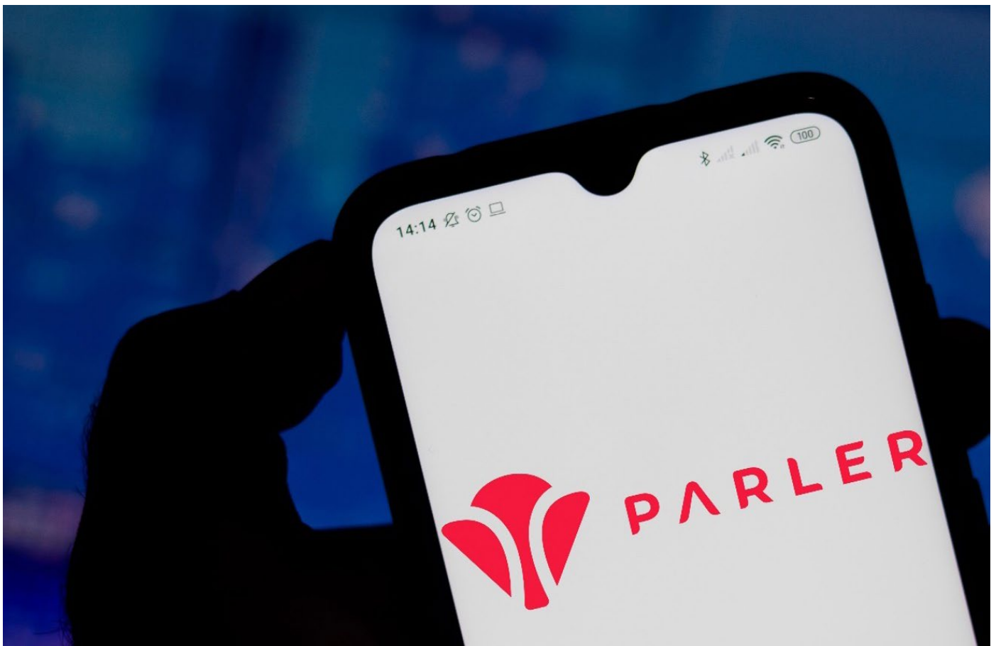
Illustration of Parler's logo on a smartphone. (Photo by Rafael Henrique / SOPA Images/Sipa USA. March 29, 2021.)

Leads developed by this unit via monitoring of social media would be referred to the FBI or state or local law enforcement for potential further investigation, as well as used by other parts of DHS (e.g., to support watchlisting nominations for TSA, among others).