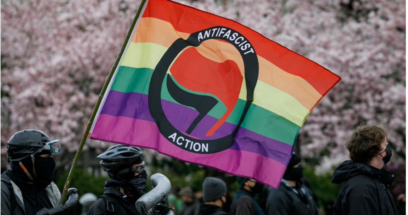
More than a hundred anti-fascist activists, Black Bloc, and anarchists gathered in Salem, Oregon's State Capitol building, March 28, 2021, to oppose a group of Trump, right-wing, Proud Boy and Qanon supporters who drove to the Capitol. A few scuffles led to about 5 arrests. No Use Germany.

In congressional testimony in September 2020, Acting Secretary Wolf noted that white supremacists have become the “most persistent and lethal” internal threat to the United States. He added, “White supremacist extremists, from a lethality standpoint over the last two years, particularly when you look at 2018 and 2019, are certainly the most persistent and lethal threat when we talk about domestic violent extremists.” 75