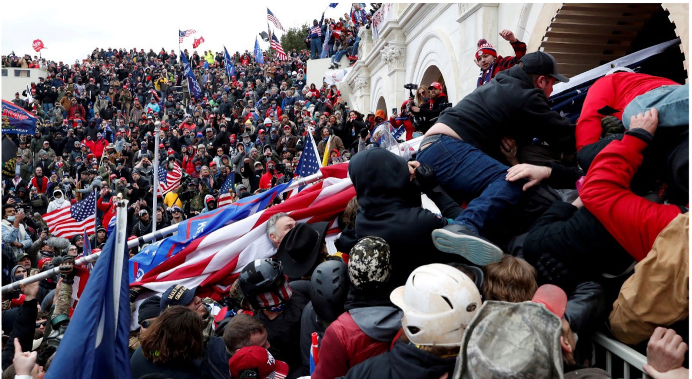
Pro-Trump protesters storm into the US Capitol during clashes with police, during a January 6, 2021 rally to contest the certification of the 2020 U.S. presidential election results by the U.S. Congress.

There is a somewhat shared, yet unique, element common to the wide spectrum of domestic groups committed to violent extremism in the United States that makes this challenge all the more complicated. Most, if not all, of them operate using a principle of leaderless resistance . The spectrum of militia groups, fascist white-power groups, and followers of bizarre conspiracies, among others, do