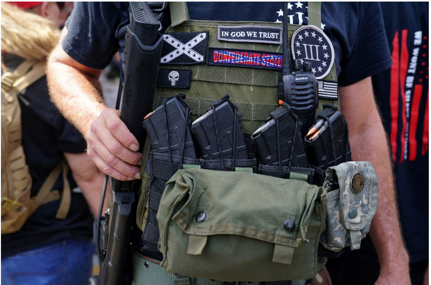
A far-right militia member carries a weapon as various militia groups stage rallies at the Confederate memorial at Stone Mountain, Georgia, August 15, 2020.