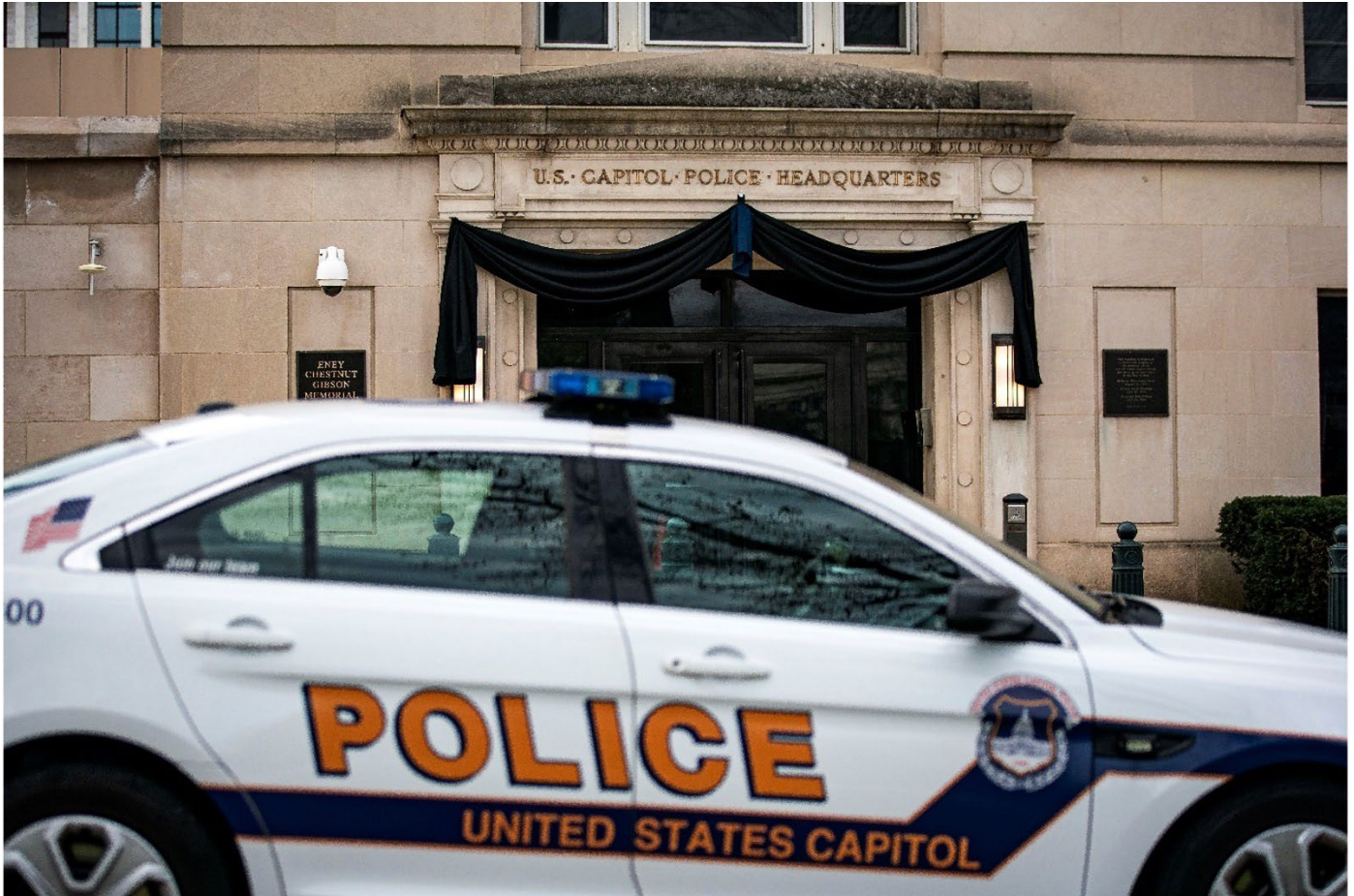
Black bunting is displayed at the entrance to the US Capitol Police headquarters, following the death of Capitol Police Officer William Evans, who was killed on April 2, 2021, in a violent incident at a security checkpoint on the U.S. Capitol grounds, in Washington, DC, April 4, 2021. Evans was an 18-year veteran of the force and a member of the Capitol Police first responders unit.

In spite of the prescient warning regarding the big-picture situation that would come to pass on January 6, the document does not explicitly predict or cite the Capitol itself as the target of violence. 26