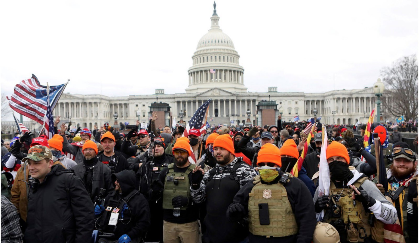
Members of the far-right group Proud Boys make 'OK' hand gestures indicating "white power" as supporters of US President Donald Trump gather in front of the US Capitol Building to protest against the certification of the 2020 US presidential election results by the U.S. Congress, in Washington, U.S., January 6, 2021.

not operate in hierarchical organizations. Rather, they function as small groups of autonomous cells, spread around the country and only loosely connected by shared ideology and social media. This makes traditional law-enforcement techniques used to bring down hierarchical networks poorly suited to address these decentralized threats. In a sense, by being disorganized, these groups are better organized to withstand traditional law-enforcement and intelligence efforts.