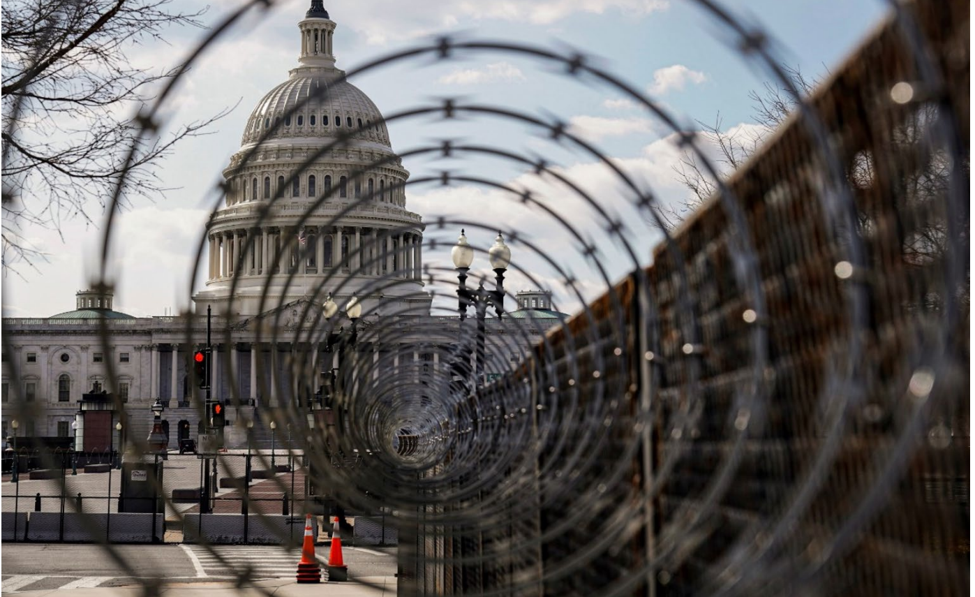
The US Capitol is seen through razor wire after police warned that a militia group might try to attack the Capitol in Washington, DC, March 4, 2021.

saw it. 28 According to a DHS spokeswoman, the department never received the Norfolk report before the rally. 29