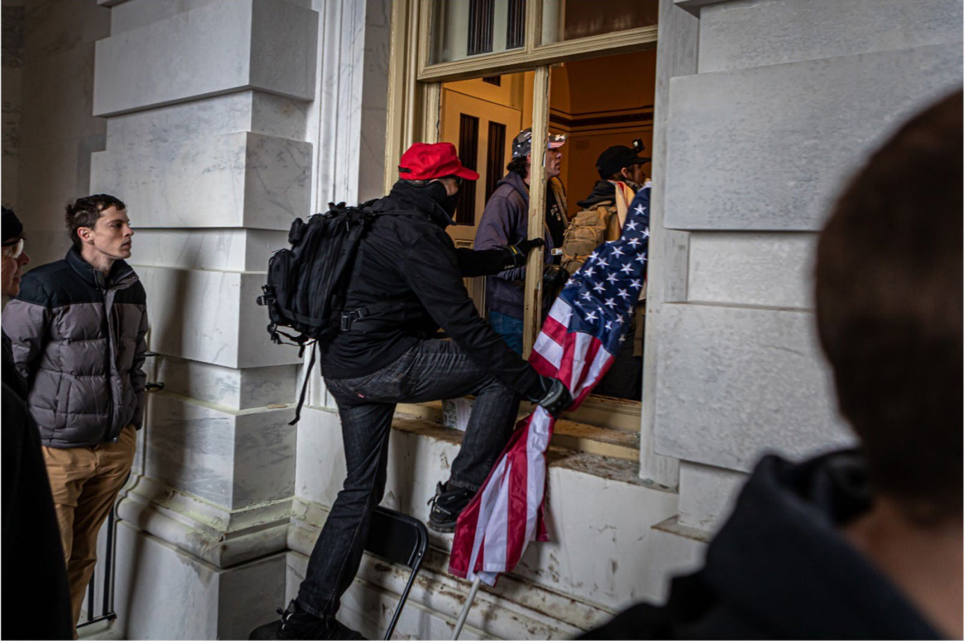
Protesters breach the US Capitol building on January 6, 2021, after pro-Trump supporters and far-right forces rallied in Washington DC to protest Trump's election loss. Hundreds breached the US Capitol Building, approximately 13 were arrested, and five people died.

Then there is the FBI. Numerous accounts note that Director Christopher Wray “was briefed in advance more broadly regarding online chatter about violence, as well as information from the FBI’s sources about possible extremists intending to travel to the Capitol.” 14 Both the HUMINT and signals-intelligence (SIGINT) collection processes were functioning in the lead-up to January 6 and, in fact, led to tactical success whereby the FBI conducted active interventions to dissuade some domestic extremists from even attending the January 6 rally. 15