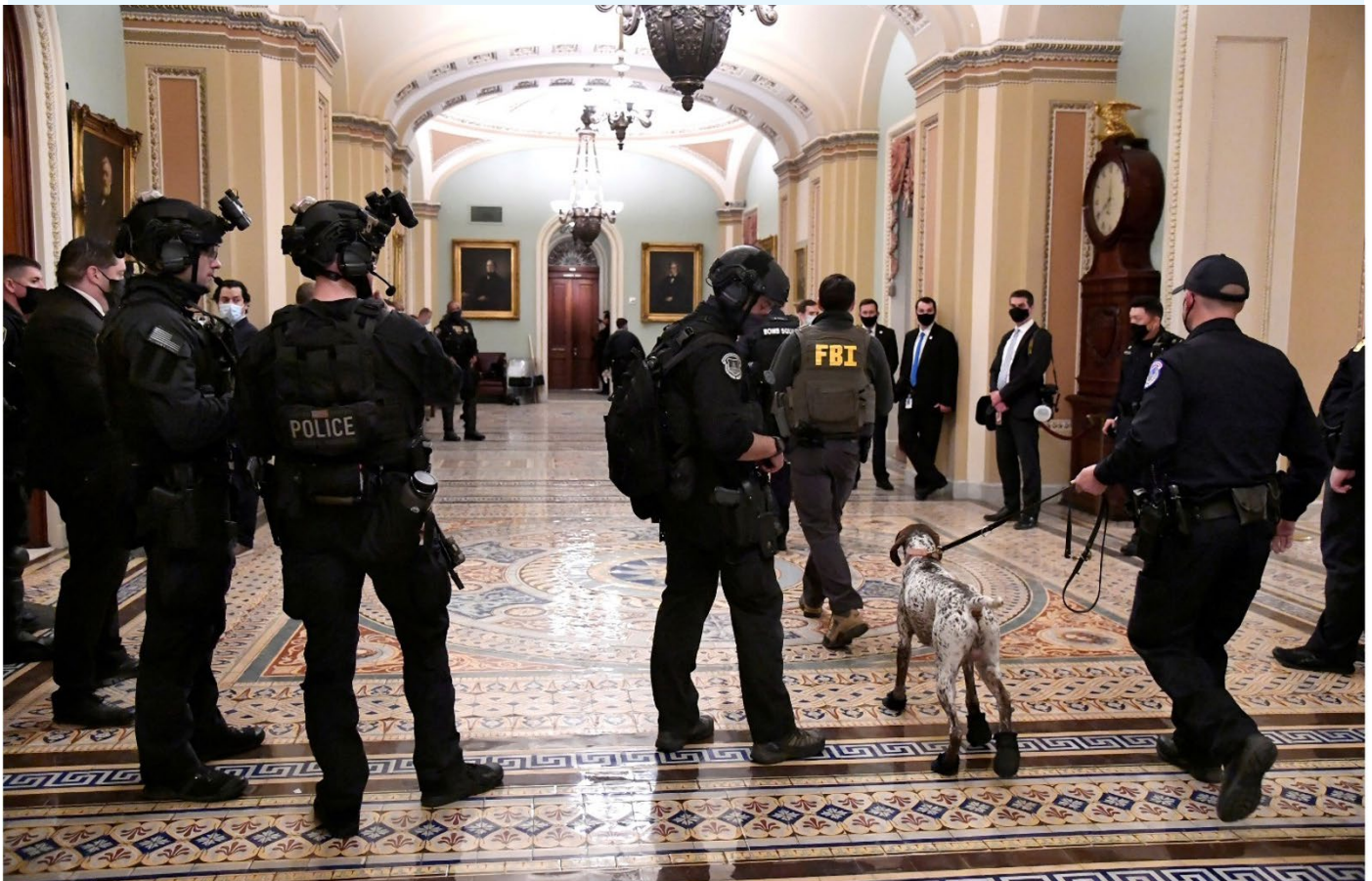
A heavy police force is evident at the Senate door after supporters of President Donald Trump breached security at the US Capitol, rioting through the Senate and House and delaying the certification of President-elect Joe Biden, in Washington, DC, January 6, 2021.

Besides its specializing in intelligence collection and analysis, Judge Posner argues that creating a US MI5 agency would mean arrests would not be made prematurely. Posner speculates that the FBI has a tendency to make arrests prematurely—as soon as an investigation collects sufficient evidence to make prosecution possible—rather than