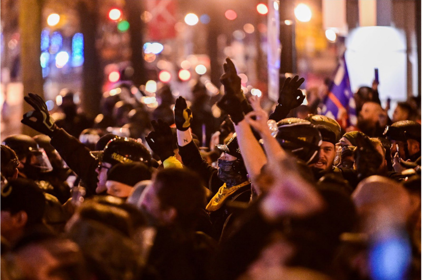
Members of the far-right group Proud Boys make 'OK' hand gestures indicating "white power", as they gather near Black Lives Matter Plaza in Washington, DC, December 12, 2020.