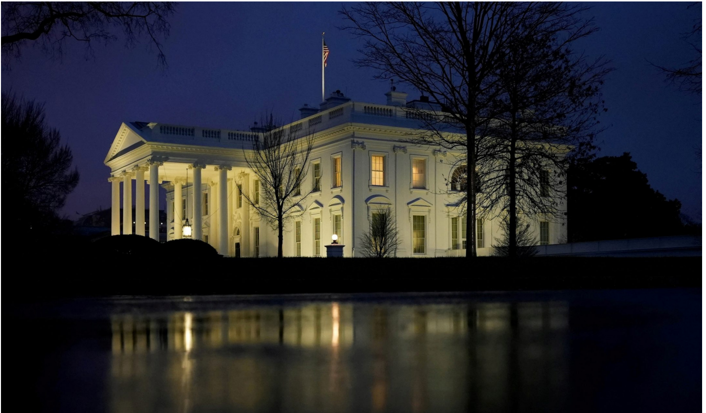
The White House is seen on the day when the Senate handed then-President Trump the first veto override of his presidency, passing the National Defense Authorization Act. in Washington, DC, January 1, 2021.

and personal sanctions on some oligarchs that have scared other wealthy Russians to take more money out of Russia.