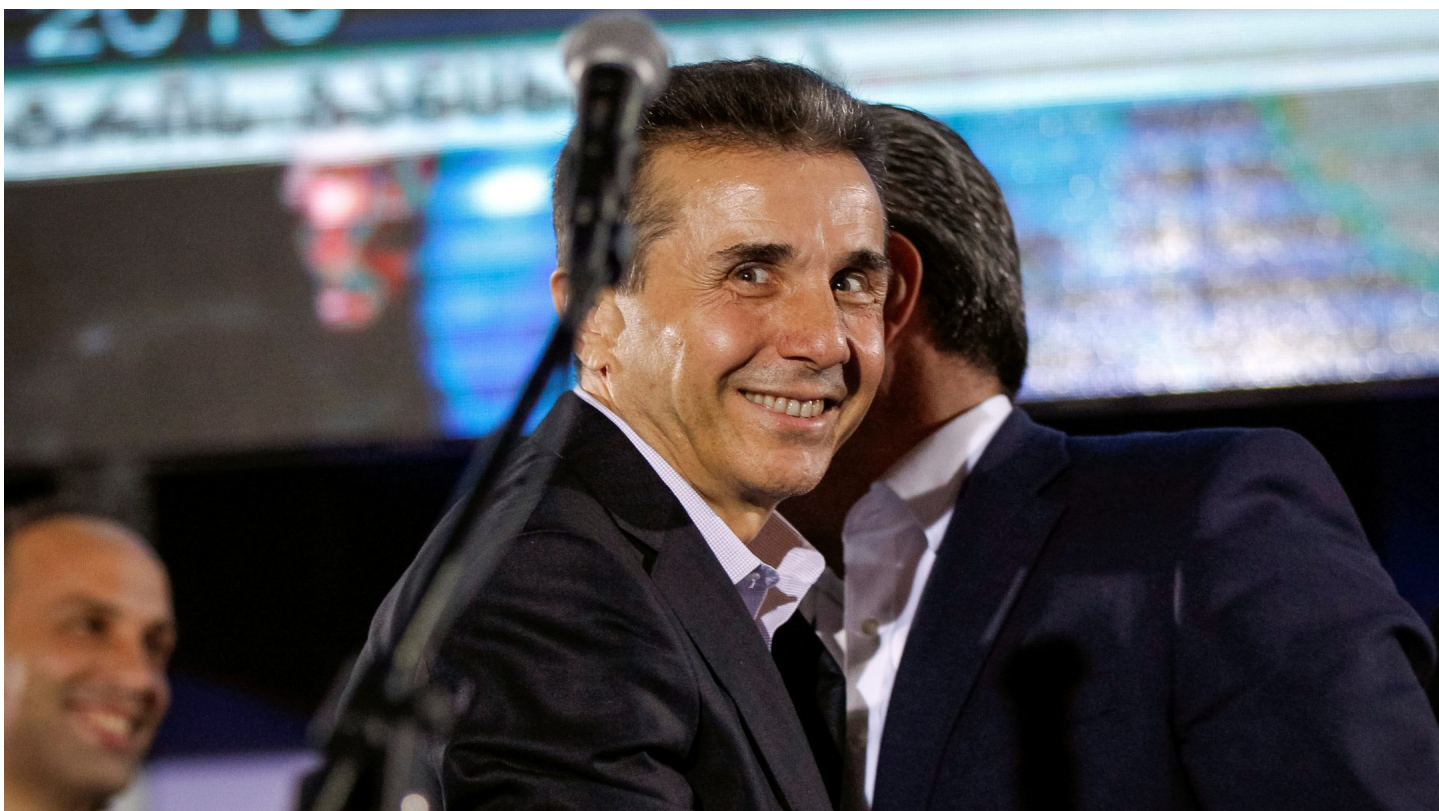
Georgia's former Prime Minister Bidzina Ivanishvili smiles at a rally of ruling Georgian Dream party after the parliamentary elections in Tbilisi, Georgia, October 8, 2016.

politically dominant Russian-Georgian oligarch Bidzina Ivanishvili. 28 In Greece, the Soviet-born Ivan Savvidis serves Kremlin causes. 29