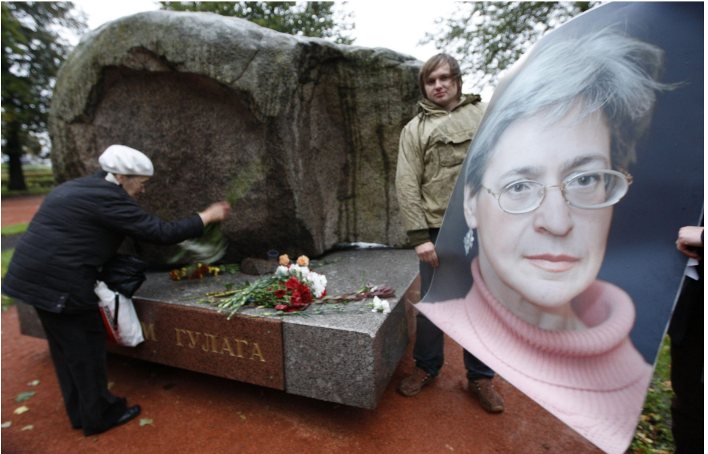
A man holds a portrait of the killed journalist Anna Politkovskaya as a woman lays flowers during a commemorative rally in St.Petersburg, October 7, 2009.

series of protests shook Moscow and several regions in response to an obviously fraudulent election in which Putin returned to the presidency after a brief stint as prime minister. Since 2019 another series of country-wide protests have taken place across the multiple Russia's regions. But, nothing seemed to seriously shake Putin. He has responded by gradually turning his regime more repressive.