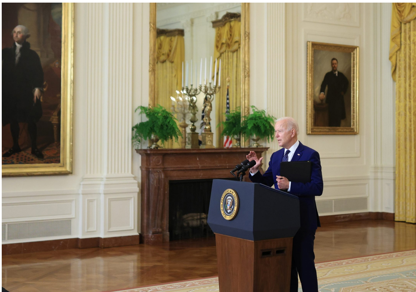
US President Joe Biden delivers remarks on Russia in the East Room at the White House in Washington, U.S., April 15, 2021.

tors avoided entering into long-term operations with multiple Russian counterparts, while payments were not impeded.