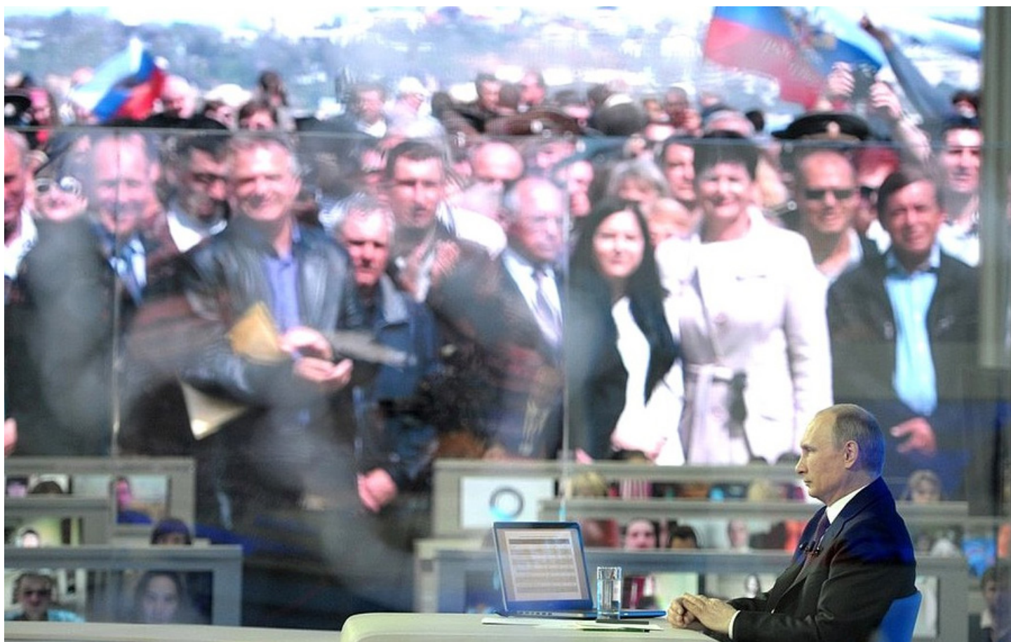
President Vladimir Putin speaks at 2014's annual "Direct Line with Vladimir Putin."

Lugansk, Donetsk, Kherson, Nikolayev and Odessa—were not part of Ukraine back then. These territories were given to Ukraine in the 1920s by the Soviet government. Why? Who knows. They were won by Potyomkin and Catherine the Great in a series of well-known wars. The centre of that territory was Novorossiysk, so the region is called Novorossiyska. Russia lost these territories for various reasons, but the people remained.” 44