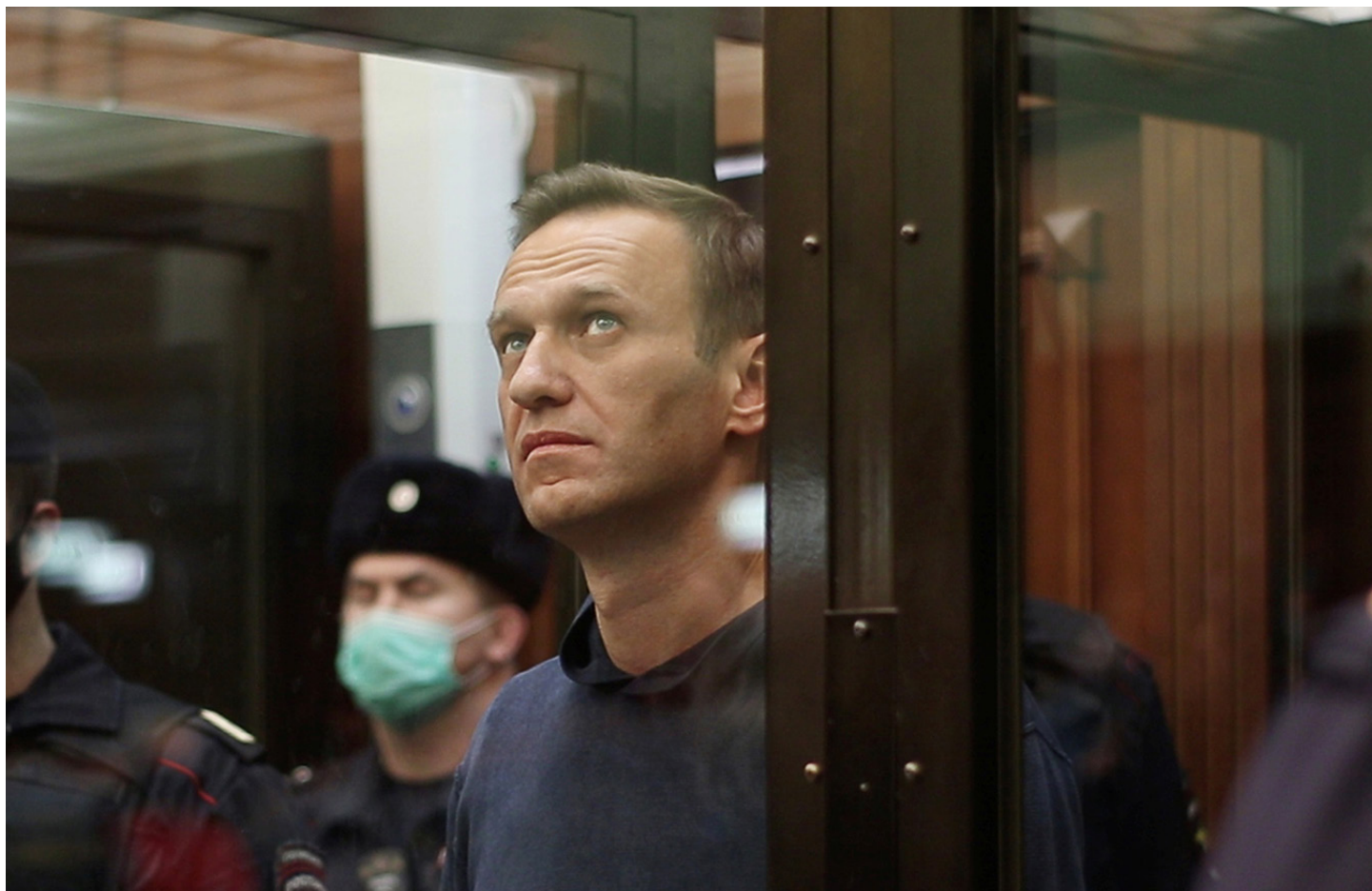
Russian opposition leader Alexei Navalny, who is accused of flouting the terms of a suspended sentence for embezzlement, inside a defendant dock during the announcement of a court verdict in Moscow, Russia February 2, 2021.

and Switzerland. They should all reframe their view of money laundering as a national security threat and strengthen their defenses against illicit finance.