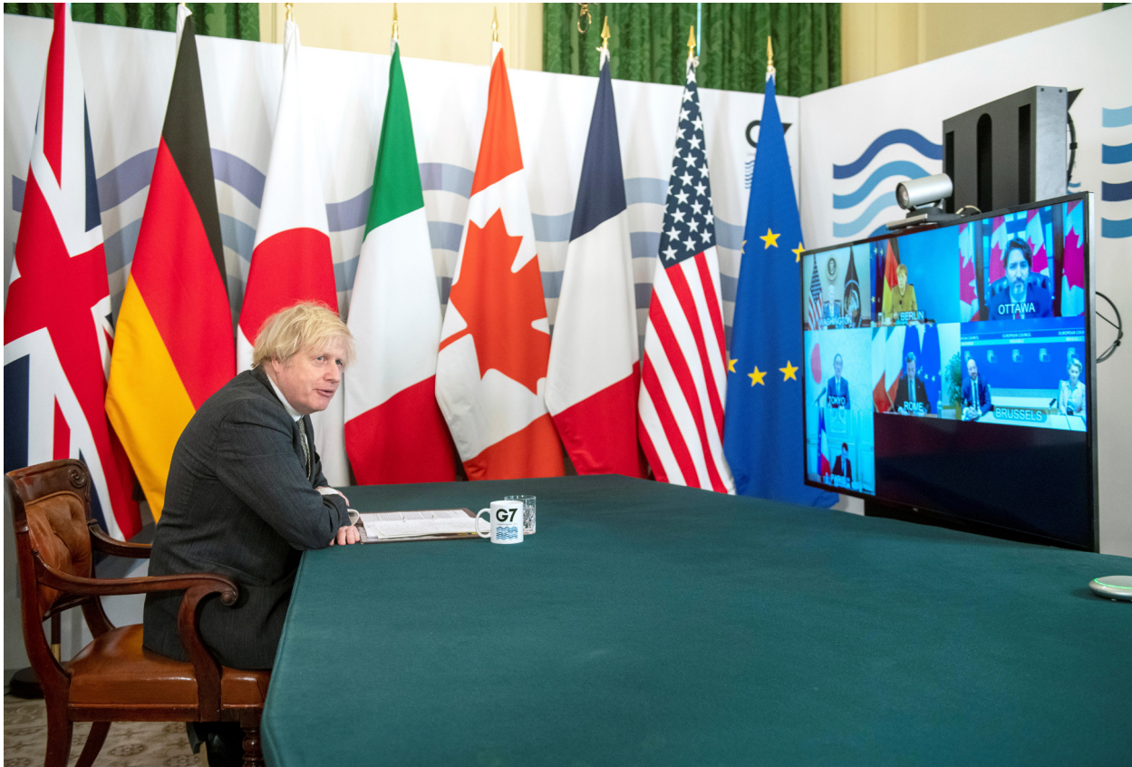
British Prime Minister Boris Johnson hosts a virtual meeting of G7 leaders on February 19, 2021.