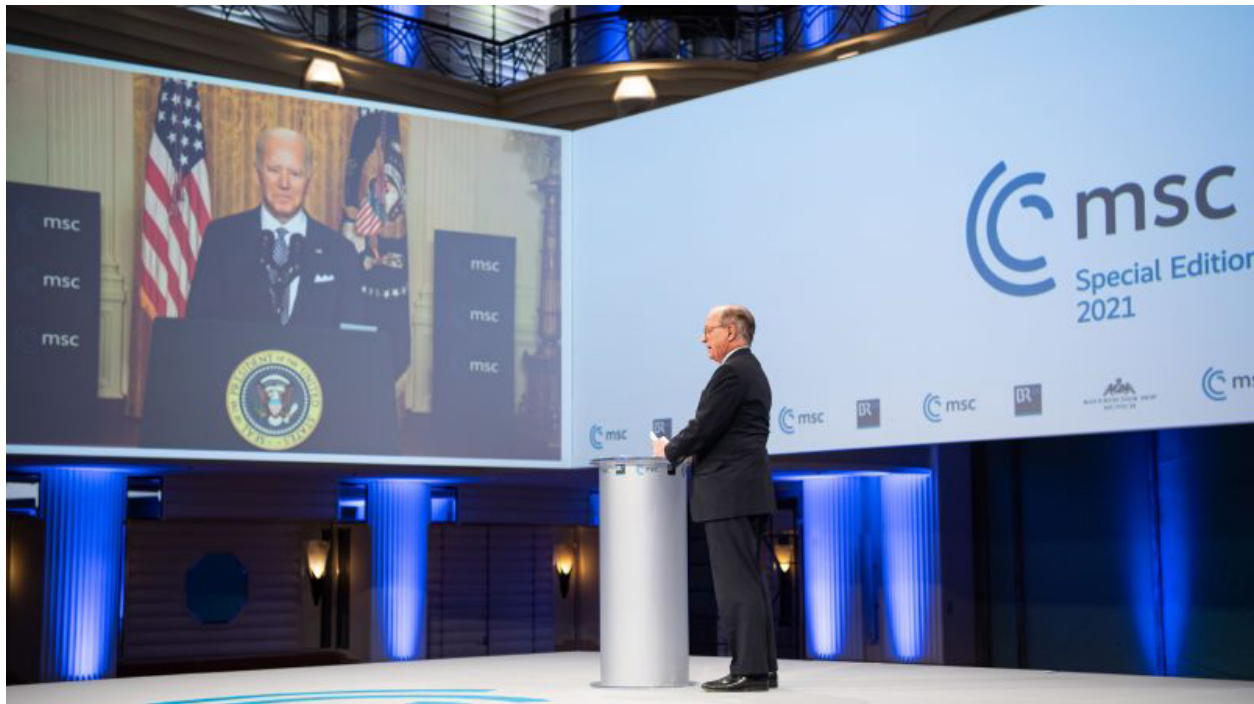
A handout photo made available by the Munich Security Conference (MSC) shows US President Joe Biden (screen) speaking during the Munich Security Conference 2021 Special Edition, in Munich, Bavaria, Germany, February 19, 2021.