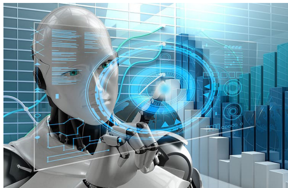
Technology challenges will require stronger cooperation among leading democracies

3 Trade and economic engagement. The D-10 could focus on developing an innovative new architecture—a revised Bretton Woods—for managing the global economy and aligning the free world through