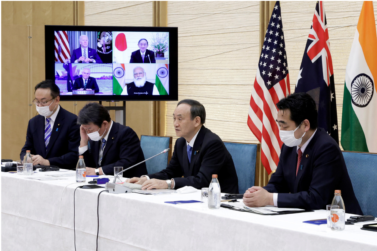
Yoshihide Suga, Japan's Prime Minister, second from left, speaks while a monitor displays U.S. President Joe Biden, Scott Morrison, Australia's Prime Minister, and Narendra Modi, India's Prime minister, during the virtual Quadrilateral Security Dialogue (Quad) meeting at his official residence in Tokyo, Japan, on Friday, March 12, 2021.

NATO engagement with democracies in Asia and other regions is highly desirable. However, NATO's focus is on mutual defense and security cooperation, whereas current threats and challenges will require coordinated action on a wider range of diplomatic activities, such as sanctions, foreign assistance, and technology coordination. Other important priorities, such as the promotion of democracy and human rights, remain largely outside NATO's purview, and could distract from its core mission. 32