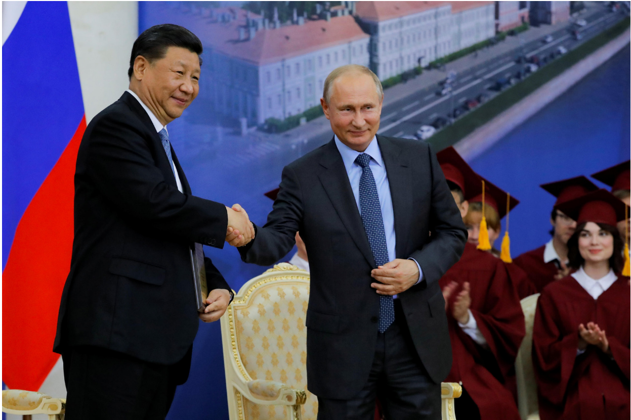
Chinese President Xi Jinping and Russian President Vladimir Putin at the St. Petersburg International Economic Forum (SPIEF) in St. Petersburg, Russia, June 6, 2019.