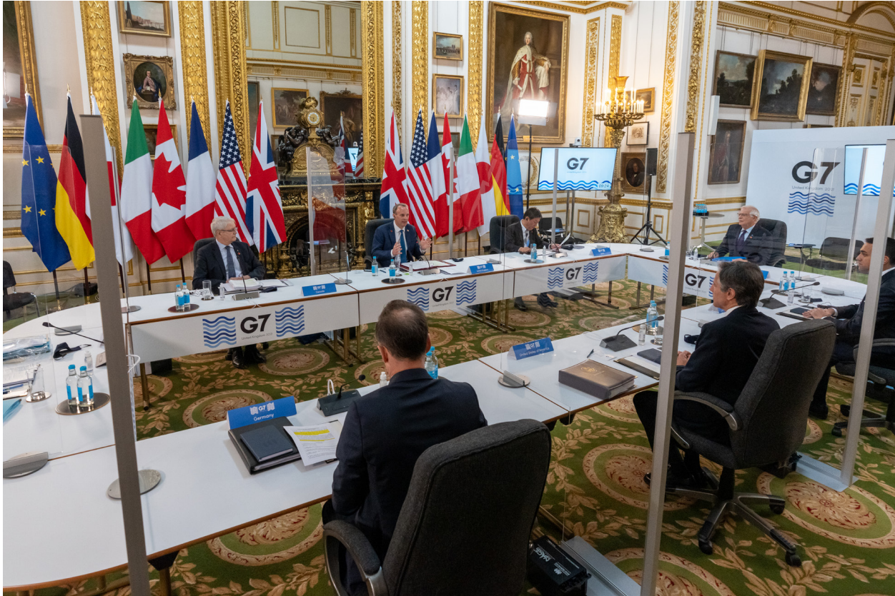
G7 Foreign Ministers meet in London on May 4, 2021