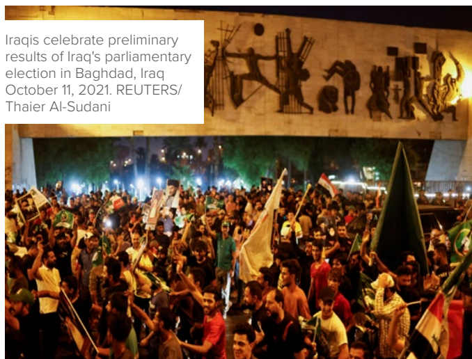
Iraqis celebrate preliminary results of Iraq’s parliamentary election in Baghdad, Iraq October 11, 2021. REUTERS/Thaier Al-Sudani

Brief descriptions of these lines of effort and specific recommendations for the Iraqi government and its partners follow. These recommendations are intended to be applied in concert to help resolve the current dislocation and build the political will necessary to build a prosperous, inclusive, and democratic Iraq.