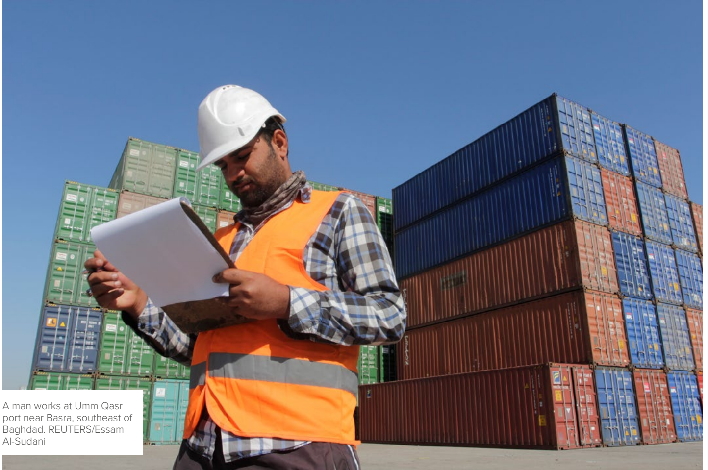
A man works at Umm Qasr port near Basra, southeast of Baghdad.