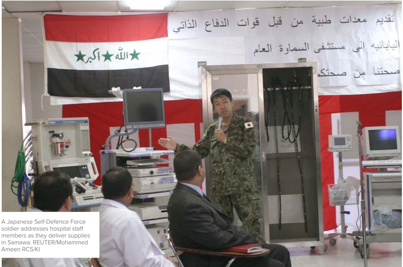
A Japanese Self-Defence Force soldier addresses hospital staff members as they deliver supplies in Samawa.