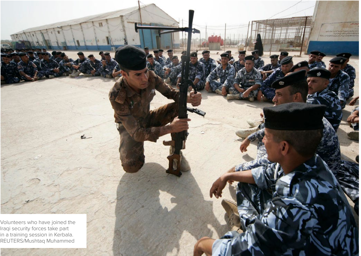
Volunteers who have joined the Iraqi security forces take part in a training session in Kerbala.