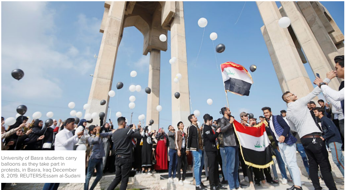
University of Basra students carry balloons as they take part in protests, in Basra, Iraq December 8, 2019.