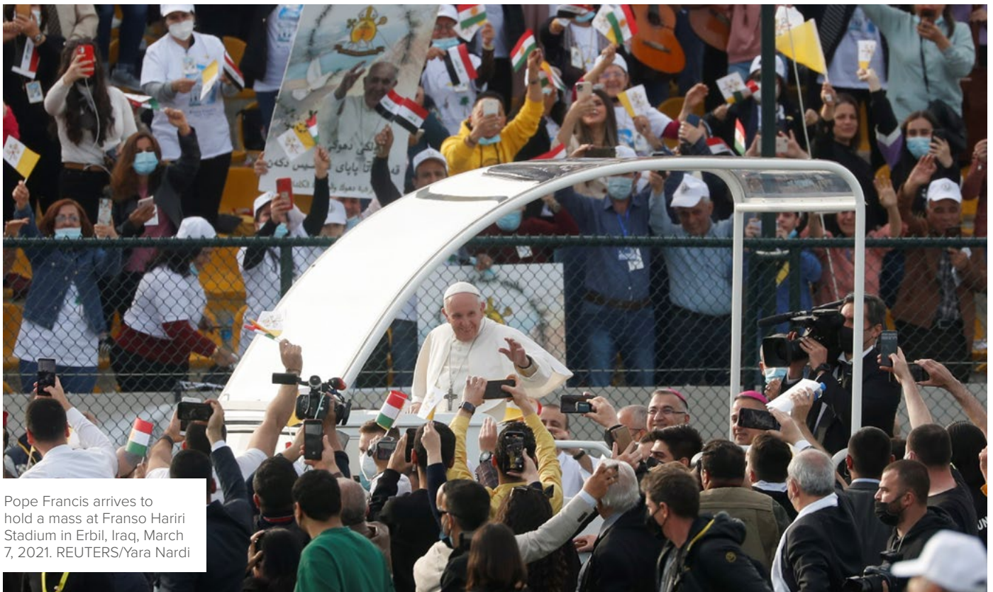
Pope Francis arrives to hold a mass at Franso Hariri Stadium in Erbil, Iraq, March 7, 2021.