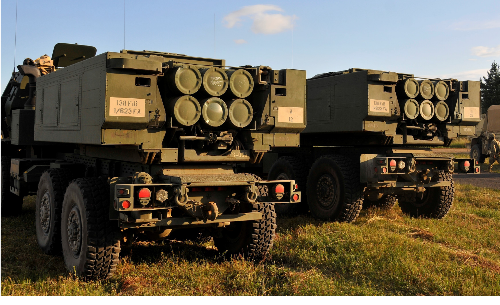
M142 High Mobility Artillery Rocket System (HIMARS) vehicles with the 1st Battalion, 623rd Field Artillery Regiment, Kentucky Army National Guard participating in Saber Strike 18 execute a fire mission at Bemoko Piskie, Poland, June 14, 2018.

with the need to preserve Alliance unity and avoid escalation across the nuclear threshold. Here the right mix of firmness, boldness, and discretion will be key. This suggests that introducing NATO ground troops into the conflict, or actions directed at regime change or the dismemberment of the Russian state, go too far. A Russian military failure in Ukraine presents opportunities to solve a range of regional security issues by leveraging sanctions relief and reintegration into the global economy in exchange for removal of Russian forces from occupied territories.<sup>99</sup> Even partial Russian success will threaten NATO