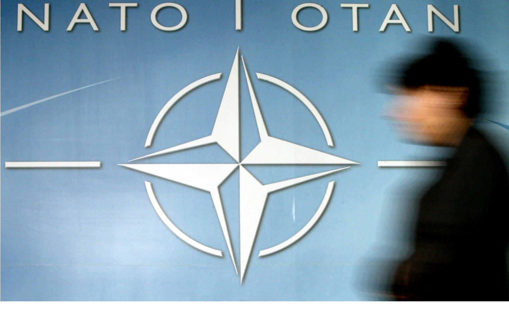
A woman walks past the NATO logo at the entrance of the Alliance headquarters ahead of a NATO foreign ministers meeting in Brussels December 4, 2003.