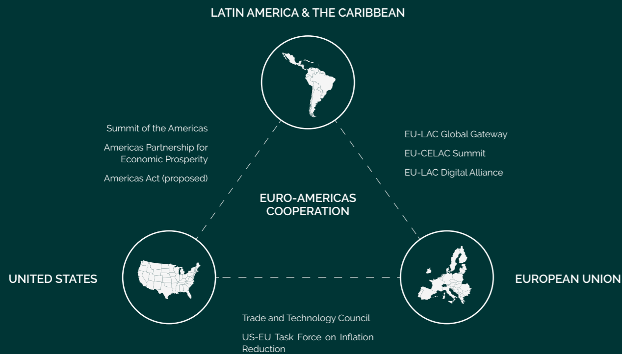
Figure 1: Key bi-regional and bilateral initiatives between the partners of the Euro-Americas.

Spain's presidency of the Council of the EU was a great stride toward developing trilateral mechanisms of cooperation and integration, which will bolster the existing bi-regional initiatives by tackling similar challenges and embracing comparable opportunities.